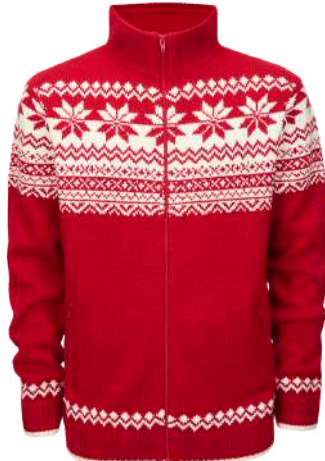
38 · red