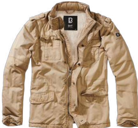
70 · camel