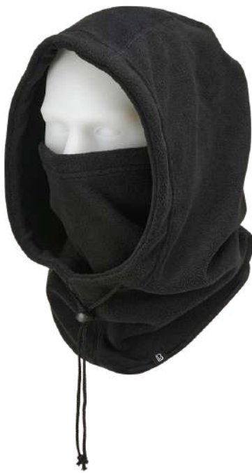
2 · black