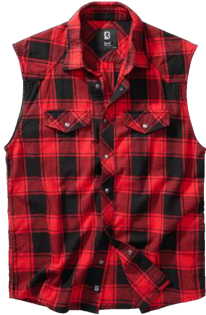
41 · red/black