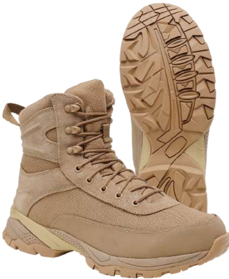
3 · beige