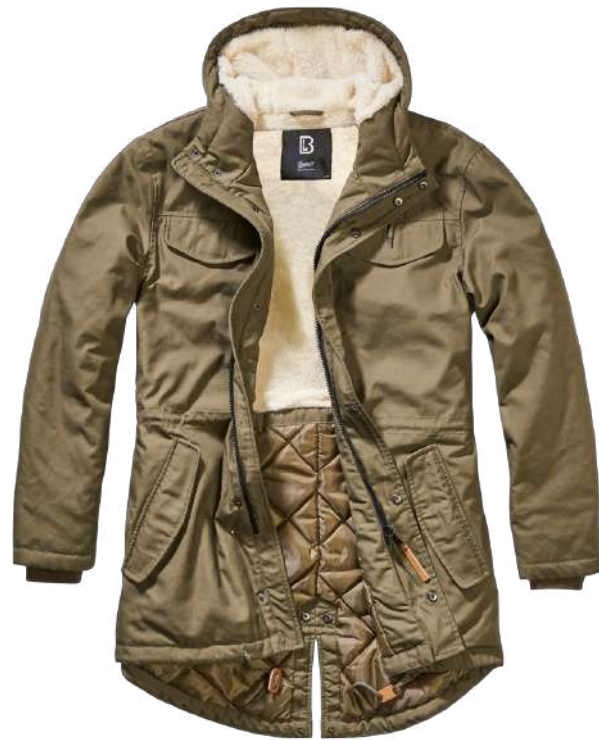
1 · olive