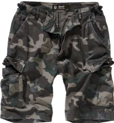
4 · darkcamo