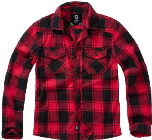
41 · red/black