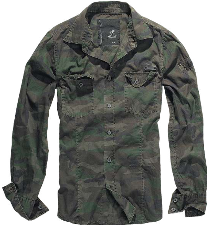
10 · woodland