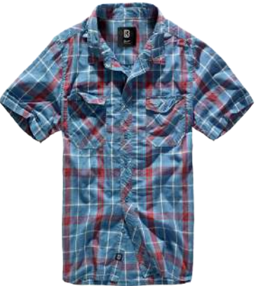
42 · red/blue