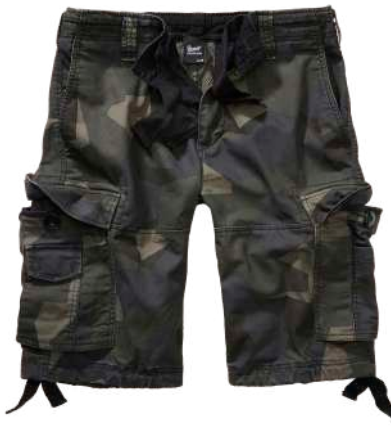
199 · m90 darkcamo