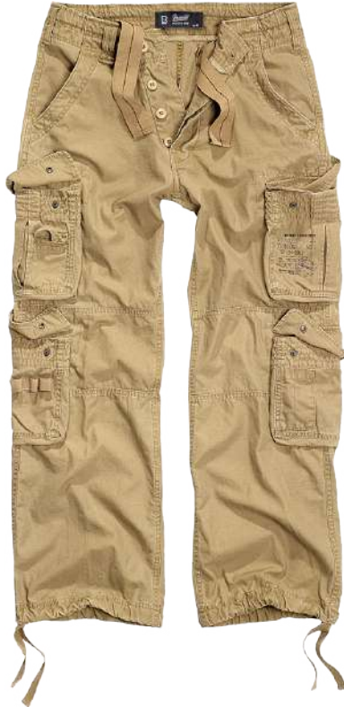
3 · beige