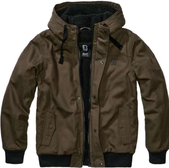
15001 · olive