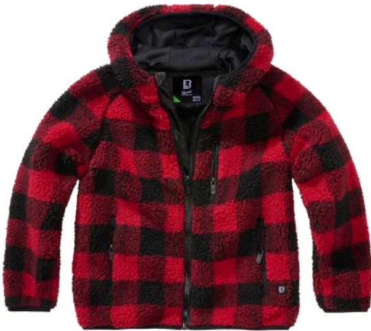
41 · red/black