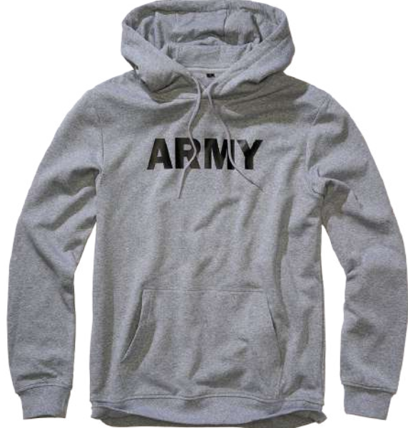
182 · grey melange