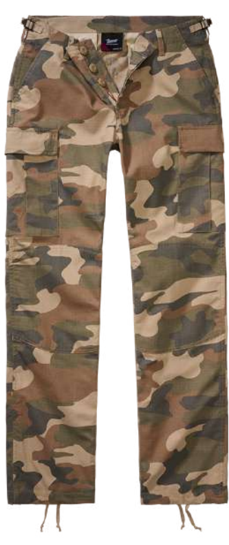
107 · light woodland