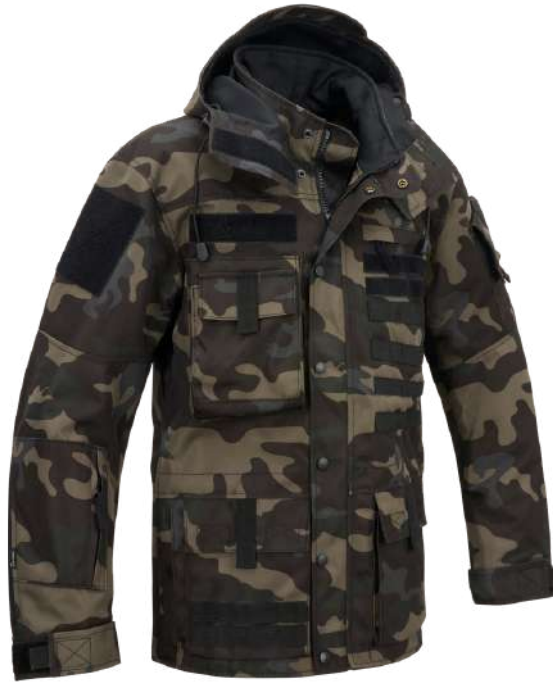
4 · darkcamo