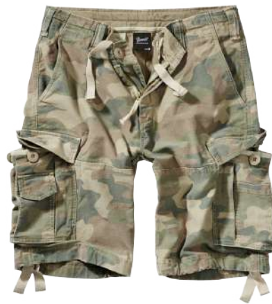
107 · light woodland