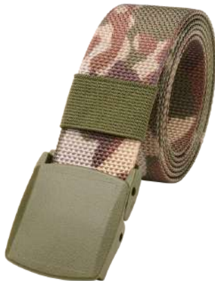
161 · tactical camo