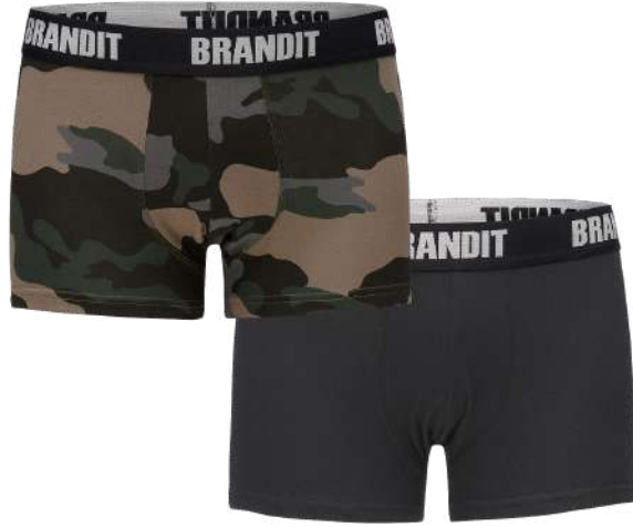
166 · darkcamo/black