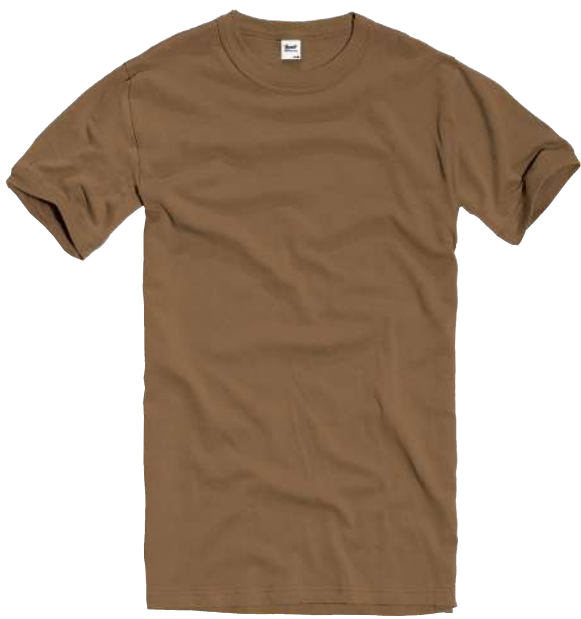
3 · beige