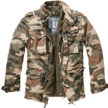
107 · light woodland