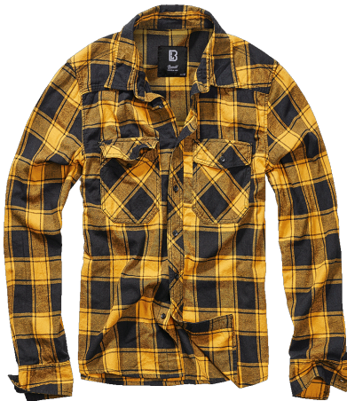
119 · yellow/black