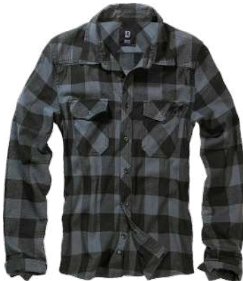
28 · black/grey