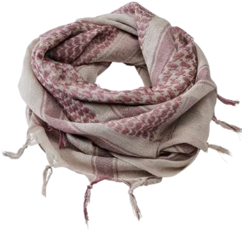
194 · coyote/brown