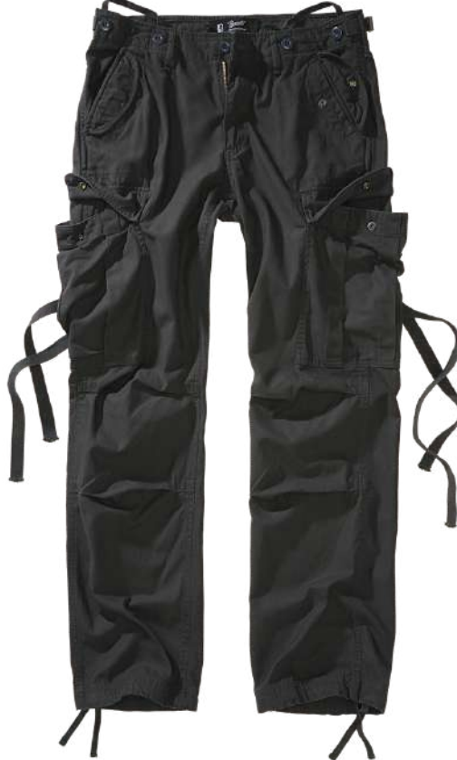
5 · anthracite