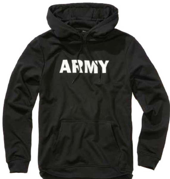
11002 · black