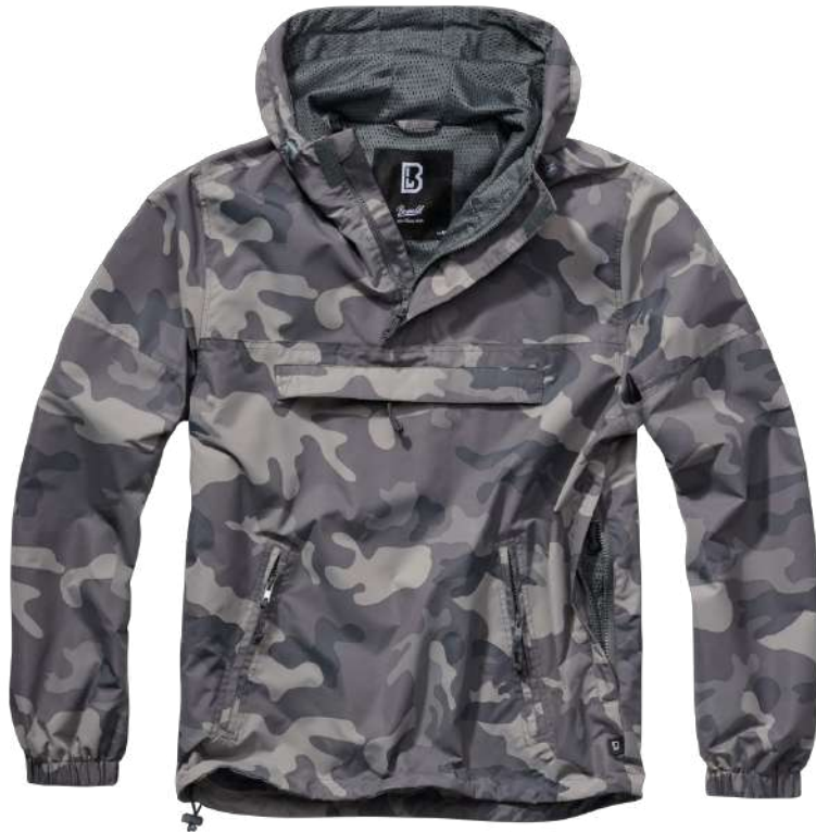
222 · grey camo