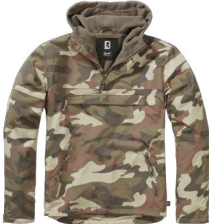
107 · light woodland