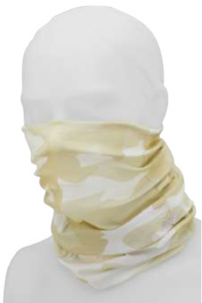
11 · sandstorm