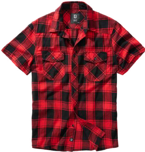
41 · red/black