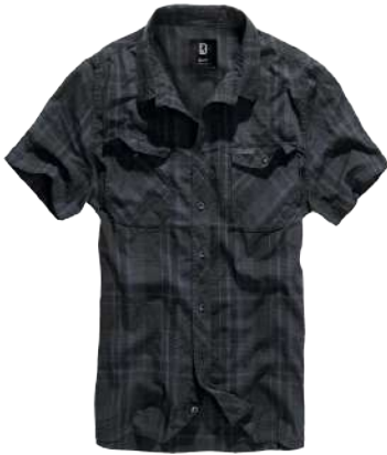
29 · black/blue