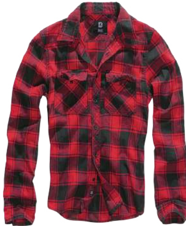
41 · red/black