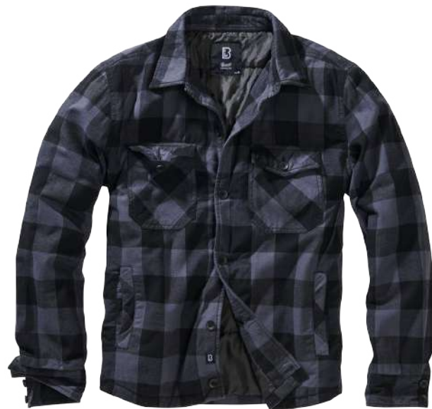
28 · black/grey