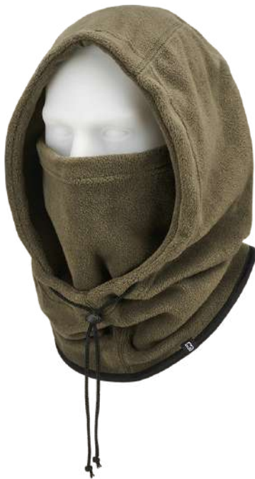
1 · olive