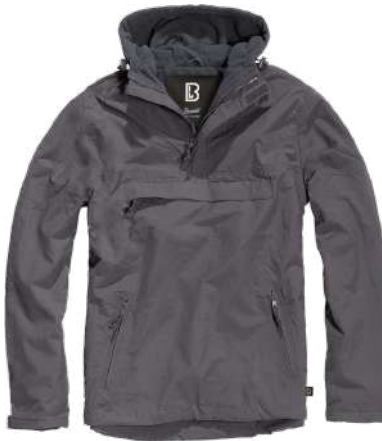
5 · anthracite