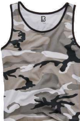
15 · urban