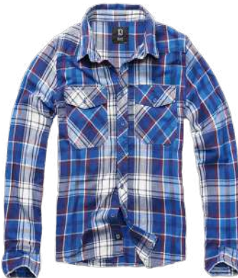
8 · navy