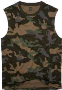
12004 · darkcamo