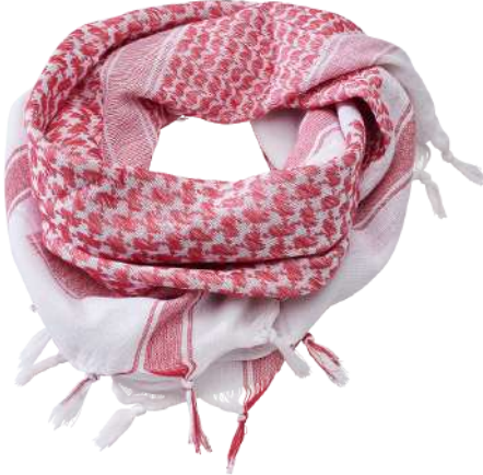
192 · red/white