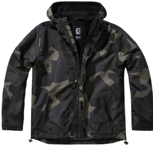
199 · M90 darkcamo