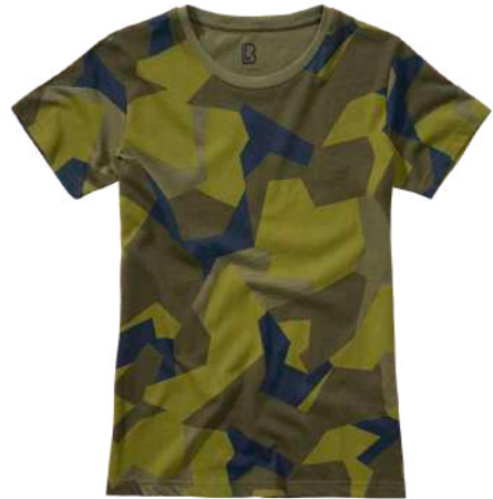
125 · swedish camo