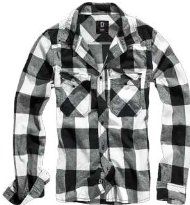
46 · white/black