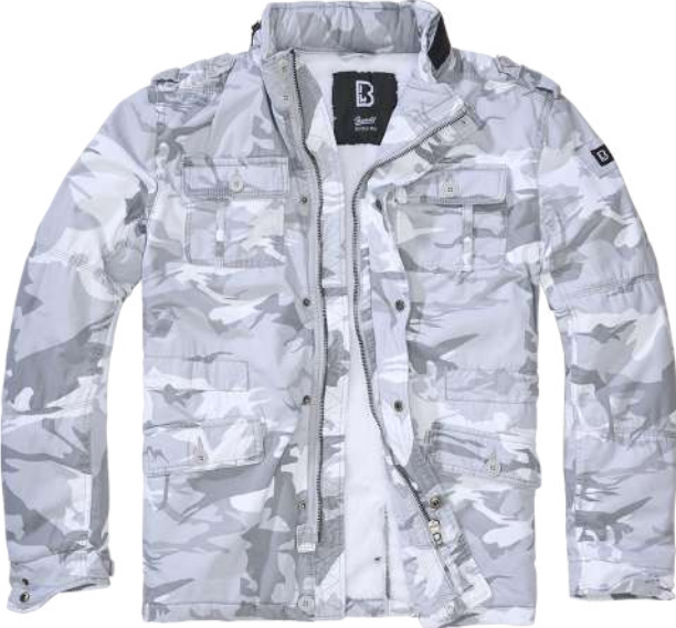
280 · blizzard camo