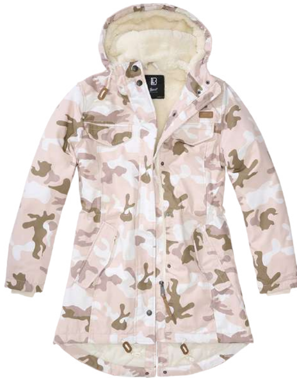
279 · candy camo