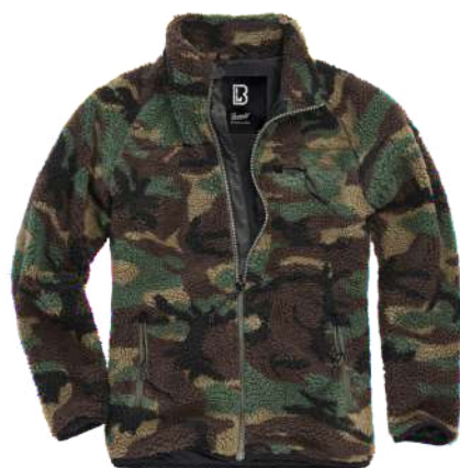
10 · woodland