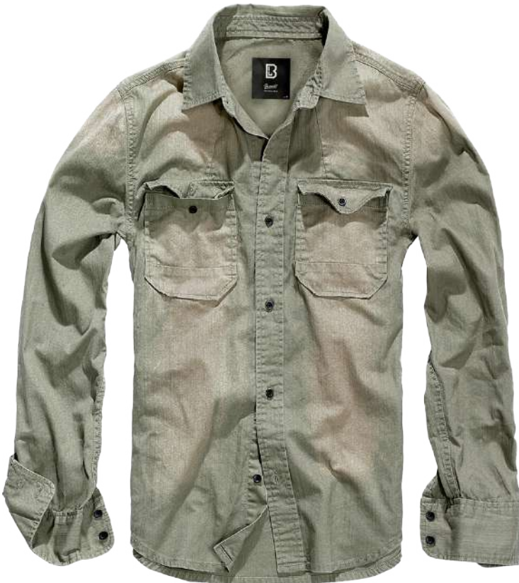
9 · olive/grey