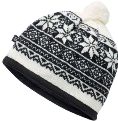
7 · white