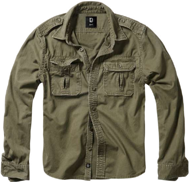
1 · olive