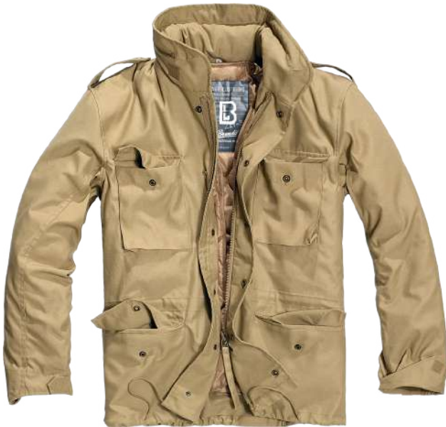
70 · camel