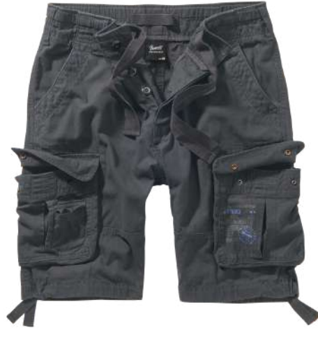
5 · anthracite