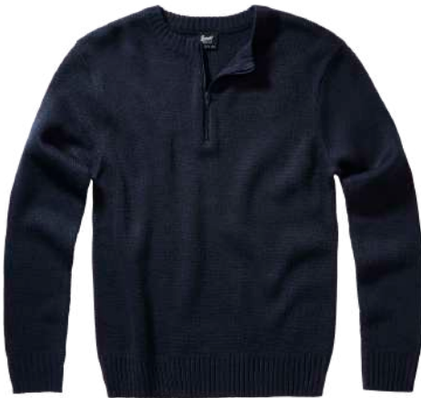
8 · navy