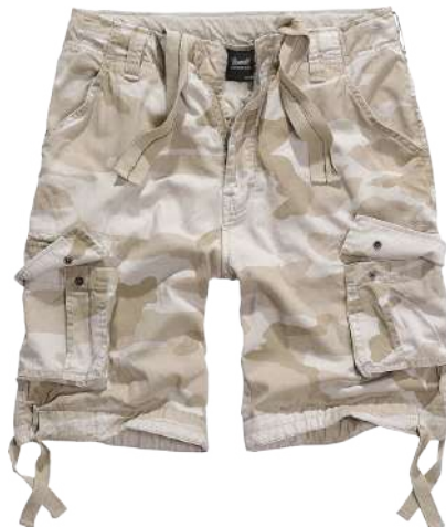
11 · sandstorm