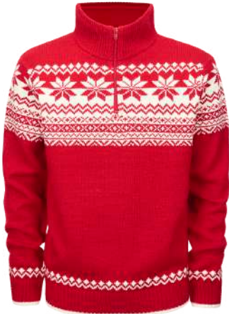
38 · red