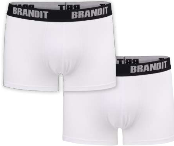
212 · white/white