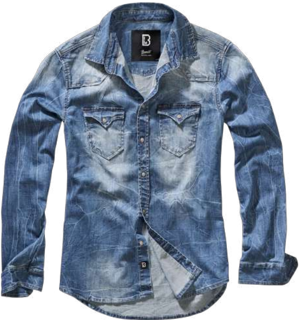
62 · denim blue