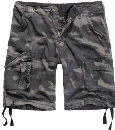
4 · darkcamo