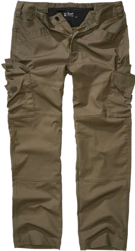
15001 · olive