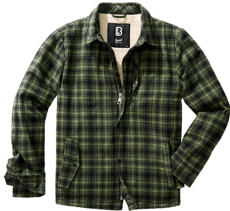
277 · olive/black