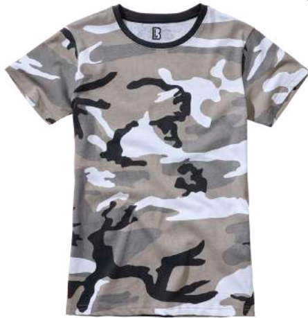
15 · urban