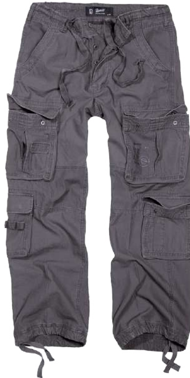
5 · anthracite