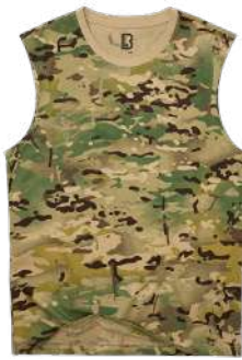
15161 · tactical camo