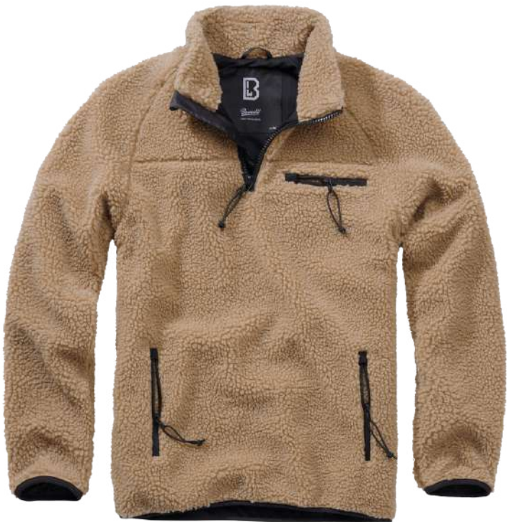
70 · camel