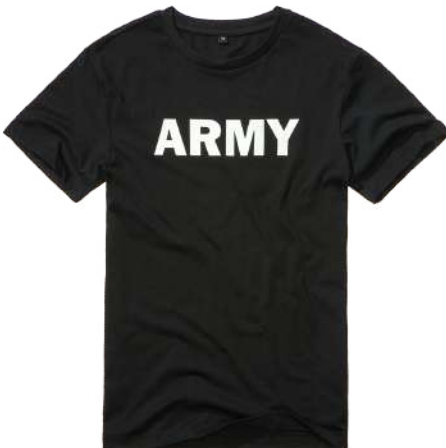
11002 · black