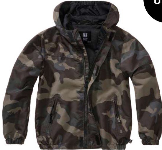
4 · darkcamo