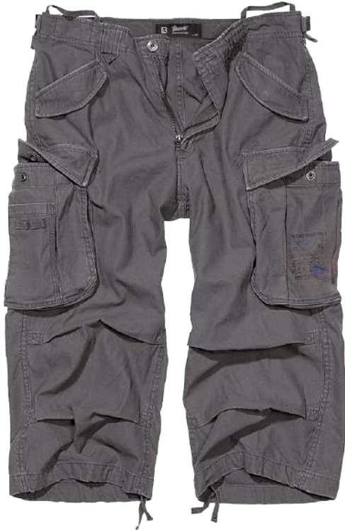
5 · anthracite