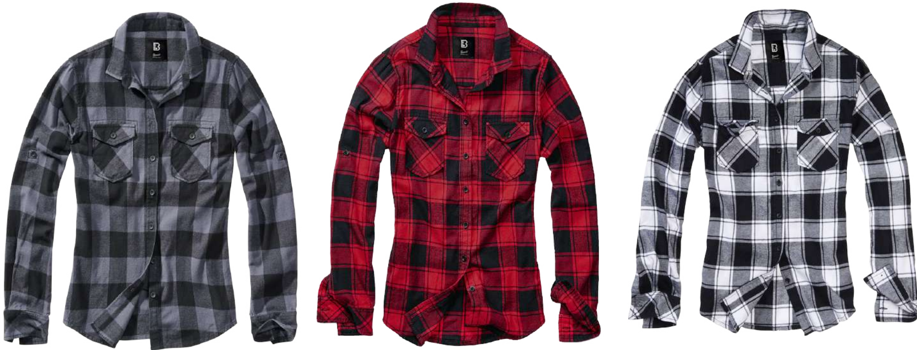
28 · black/grey