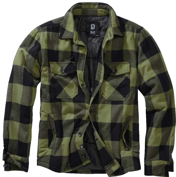
184 · black/olive