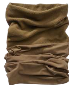
70 · camel