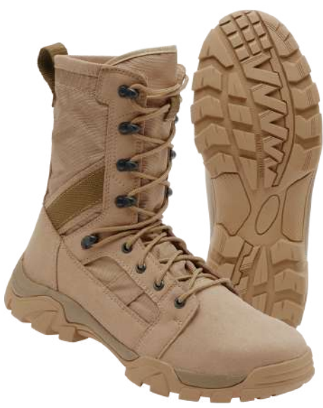
70 · camel