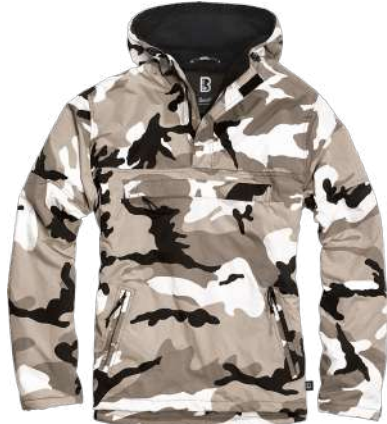
15 · urban