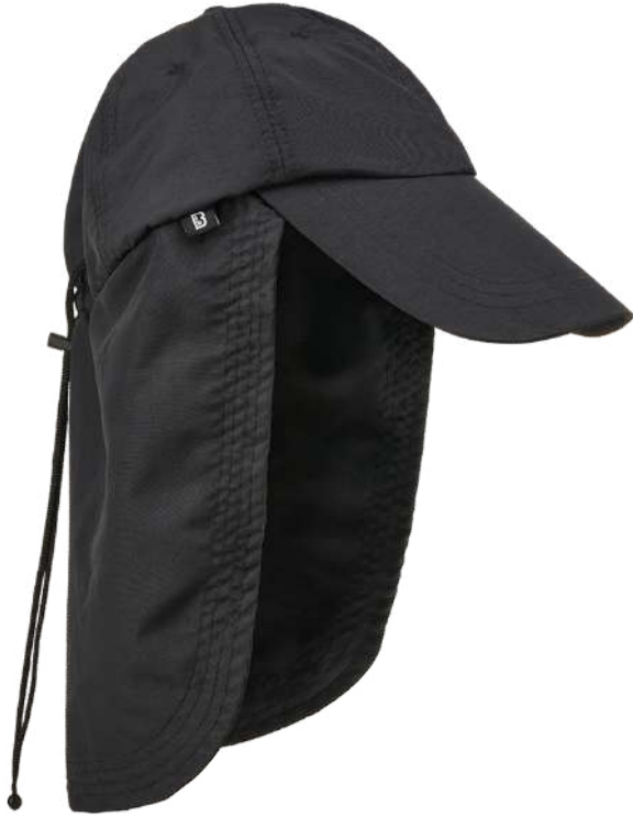
2 · black