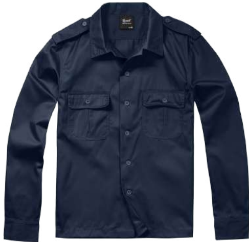
8 · navy