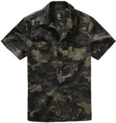
4 · darkcamo