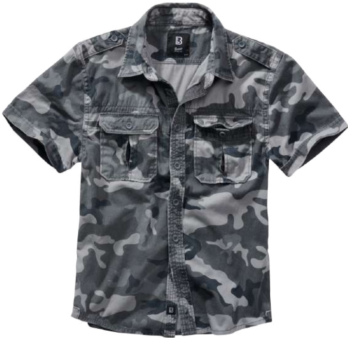
222 · grey camo