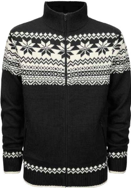
2 · black