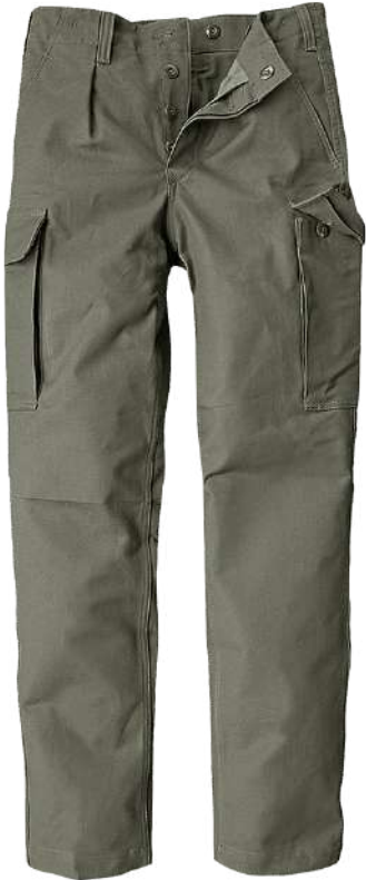
15001 · olive