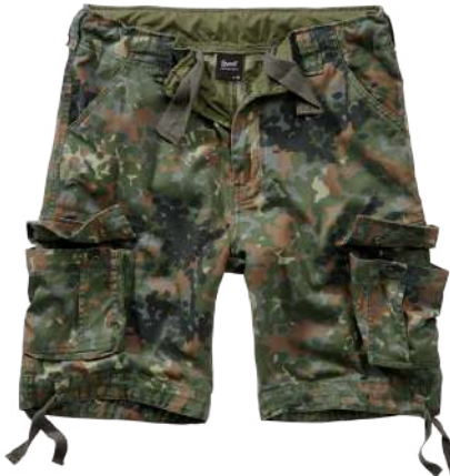
14 · flecktarn