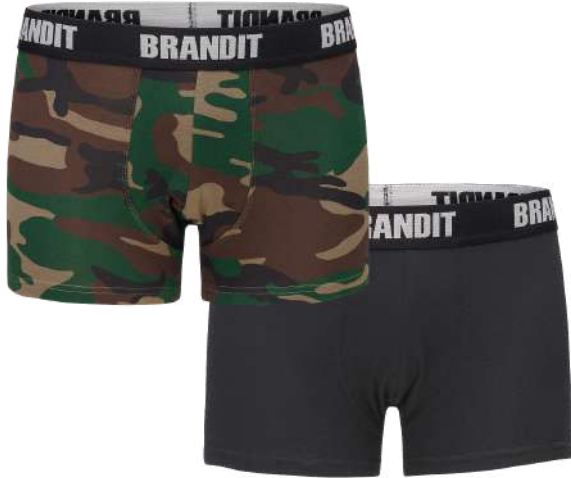
198 · woodland/black