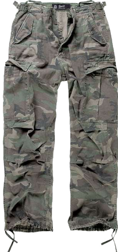
10 · woodland