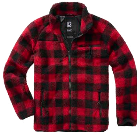
41 · red/black