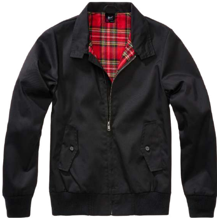
2 · black