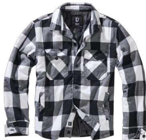
46 · white/black