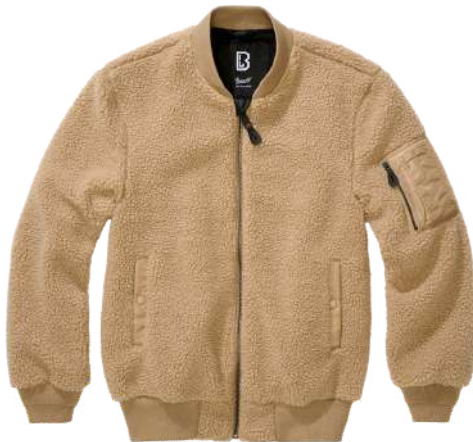
20070 · camel