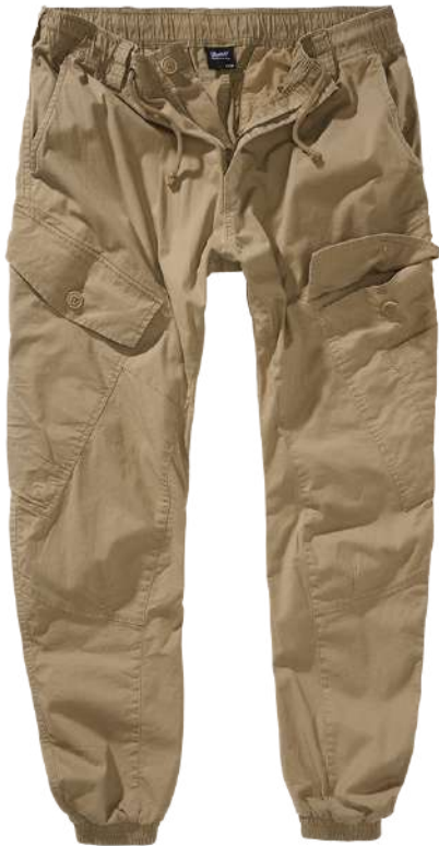
70 · camel