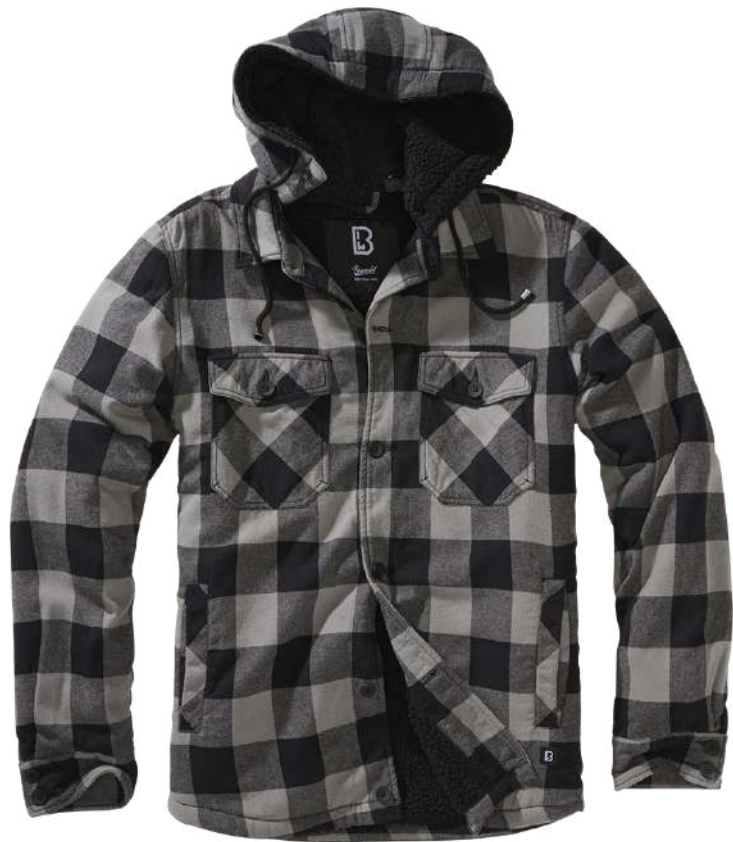
221 · black/charcoal