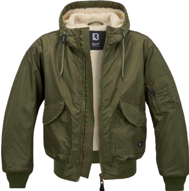
1 · olive