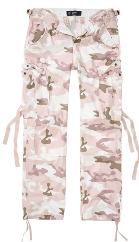
279 · candy camo