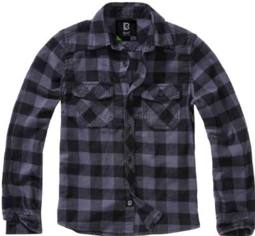
28 · black/grey