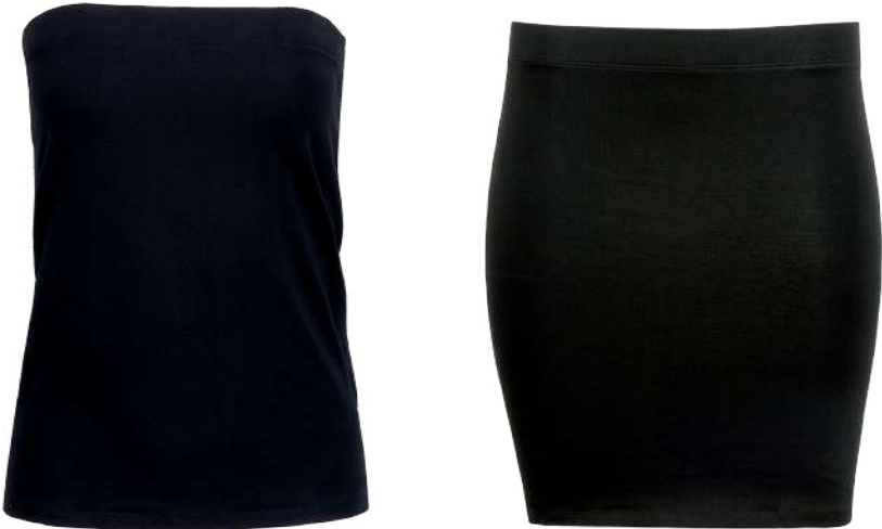
11002 · black