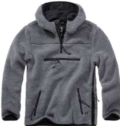
5 · anthracite