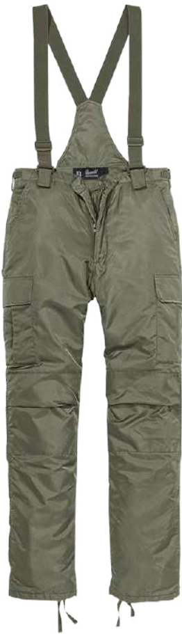
1 · olive