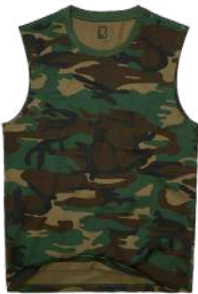
15010 · woodland