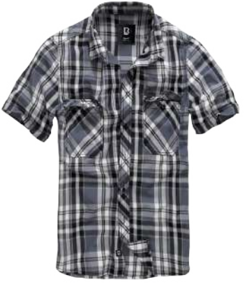
69 · black/anthracite