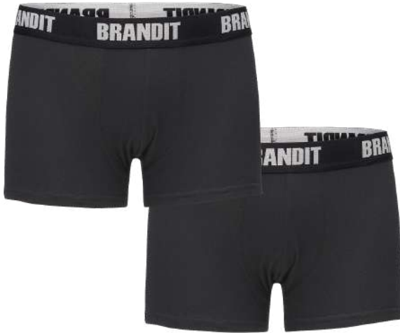
196 · black/black