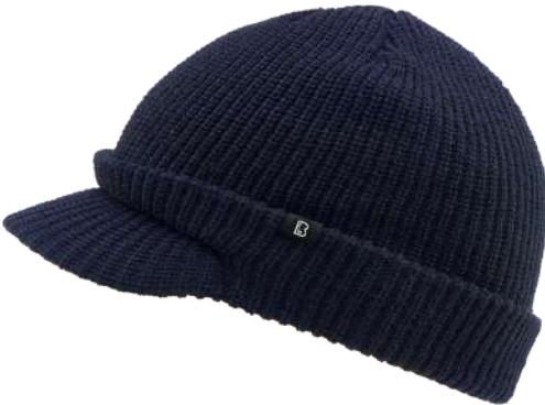
8 · navy