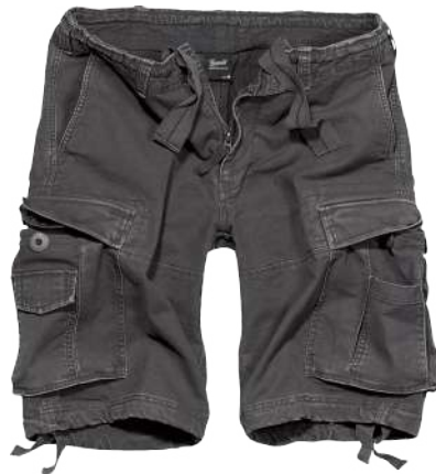
5 · anthracite