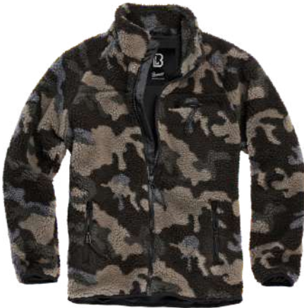
4 · darkcamo