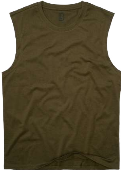
15001 · olive