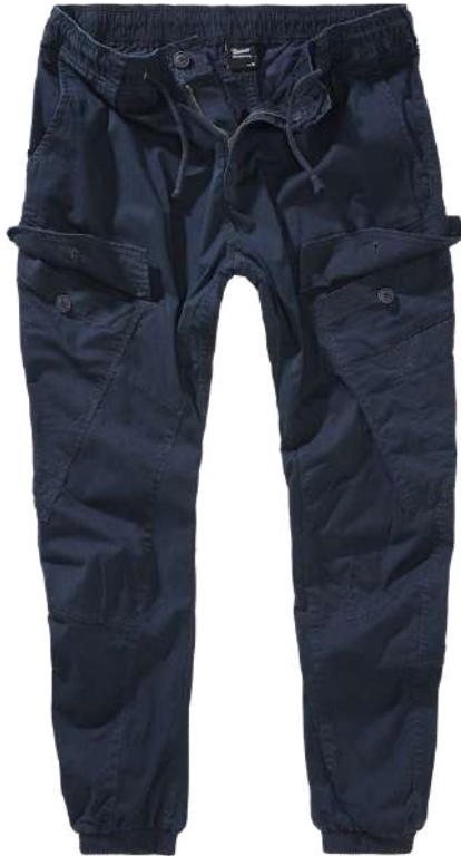
8 · navy