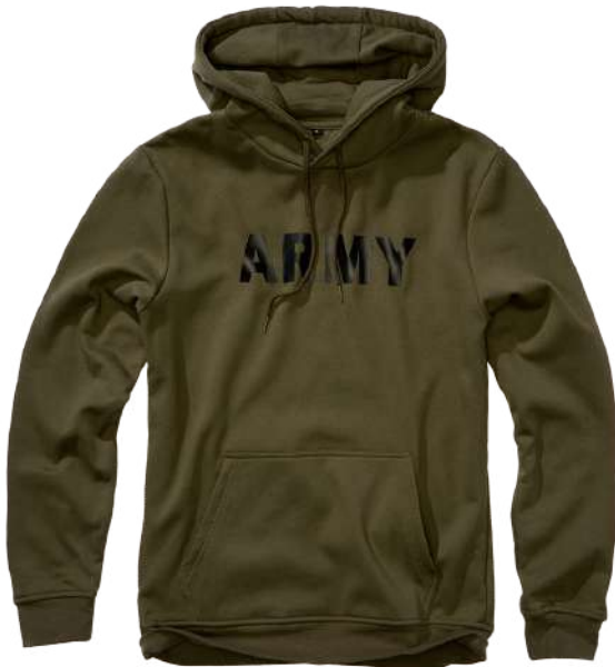
15001 · olive