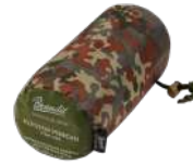
14 · flecktarn