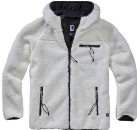
7 · white