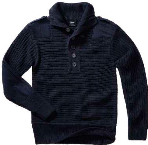
8 · navy