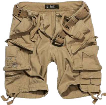
3 · beige