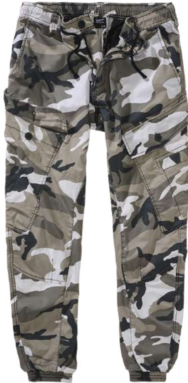
15 · urban