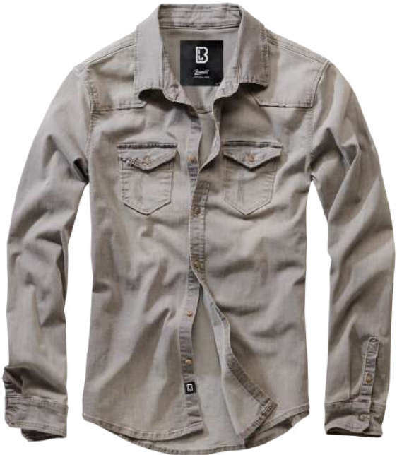
169 · grey denim