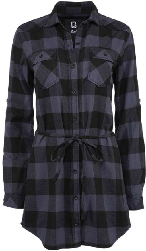
28 · black/grey