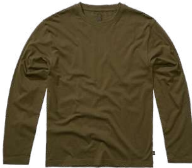
15001 · olive