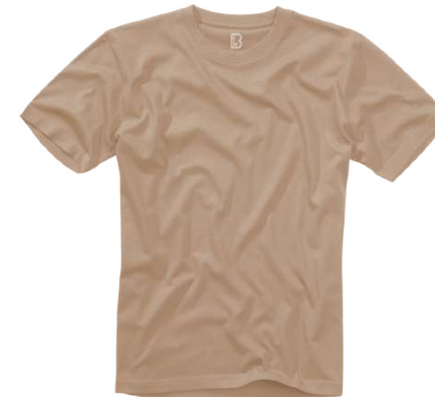
3 · beige