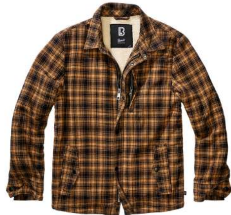
278 · camel/black