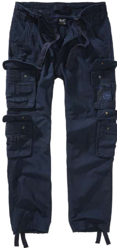
8 · navy