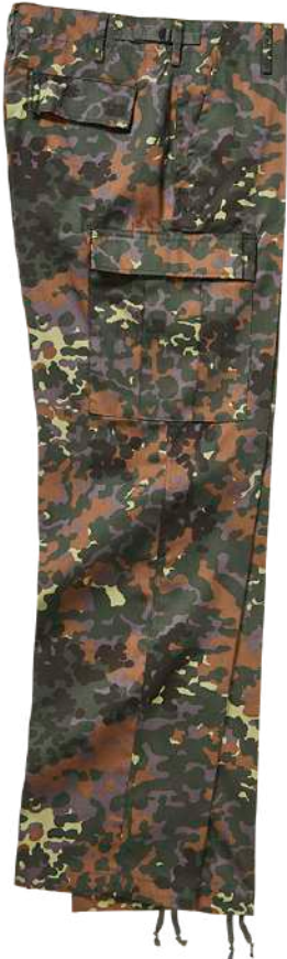
14 · flecktarn