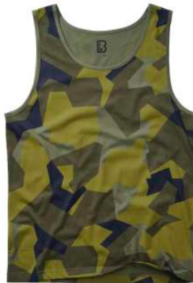
125 · swedish camo