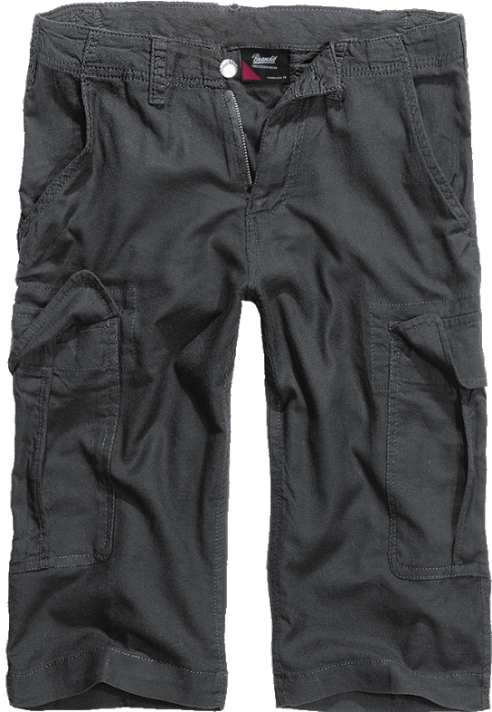
2 · black