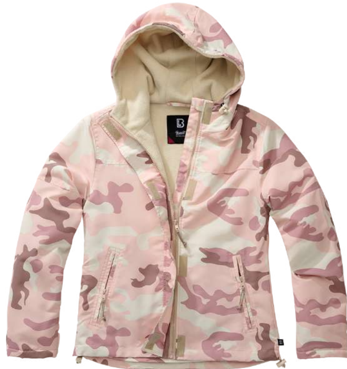
279 · candy camo