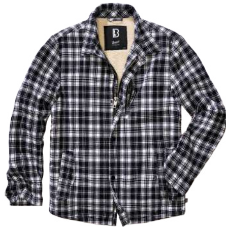
46 · white/black