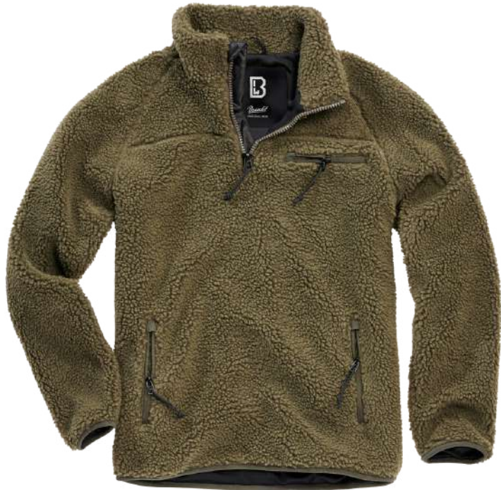
1 · olive