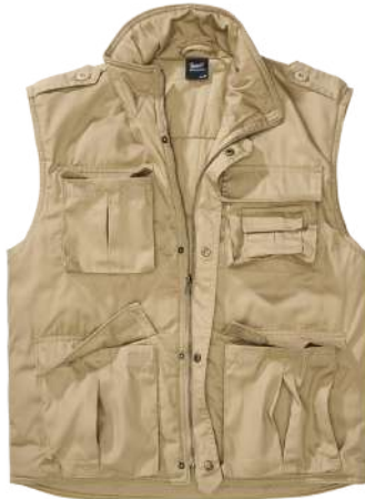
70 · camel