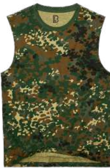
15014 · flecktarn