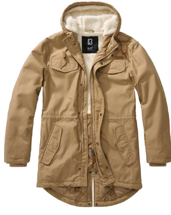
70 · camel