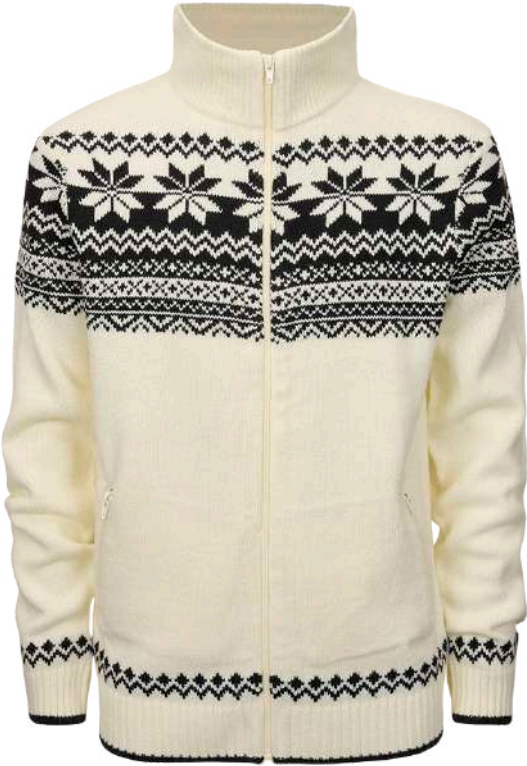
7 · white