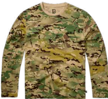
15161 · tactical camo