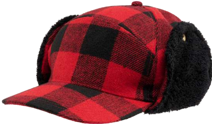
41 · red/black