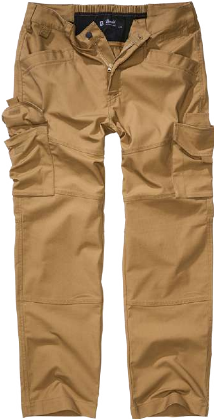
20070 · camel