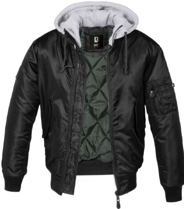
78 · black/grey