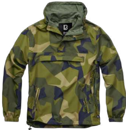
125 · swedish camo