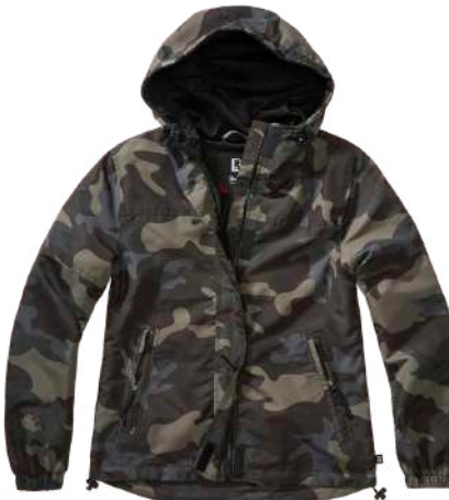
4 · darkcamo