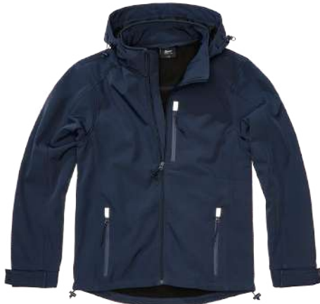
14008 · navy