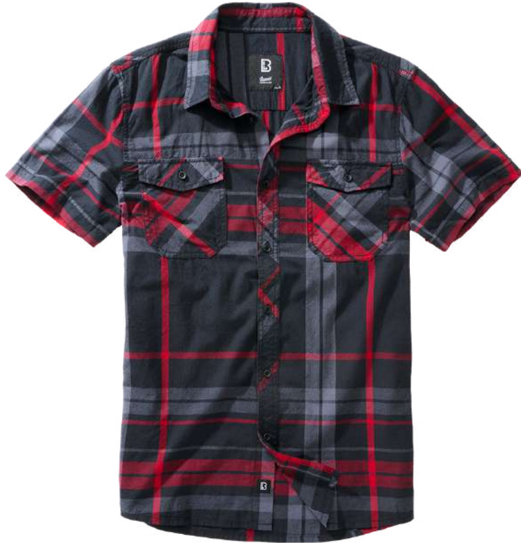
240 · anthracite/red