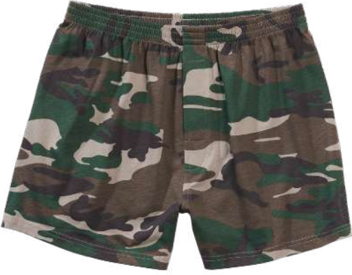
10 · woodland