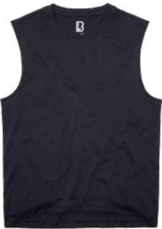
14008 · navy