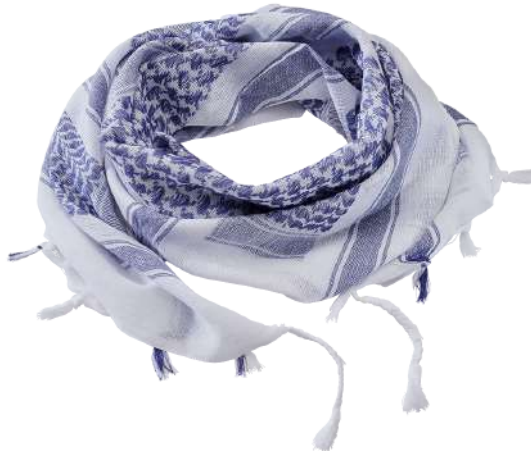
153 · blue/white