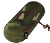
10 · woodland