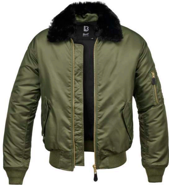
1 · olive