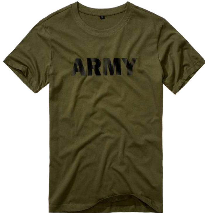
15001 · olive