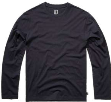
14008 · navy