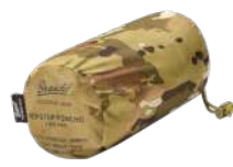
161 · tactical camo