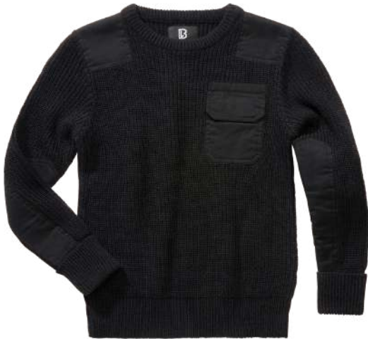
2 · black