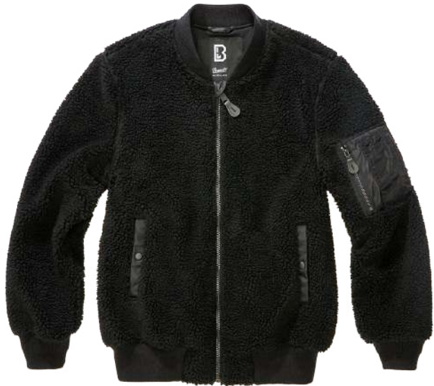
11002 · black