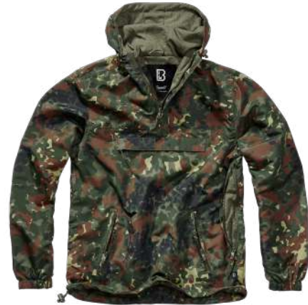
14 · flecktarn