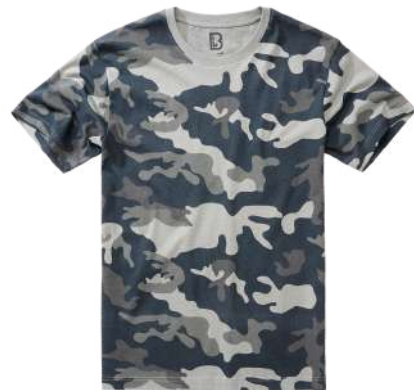
222 · grey camo