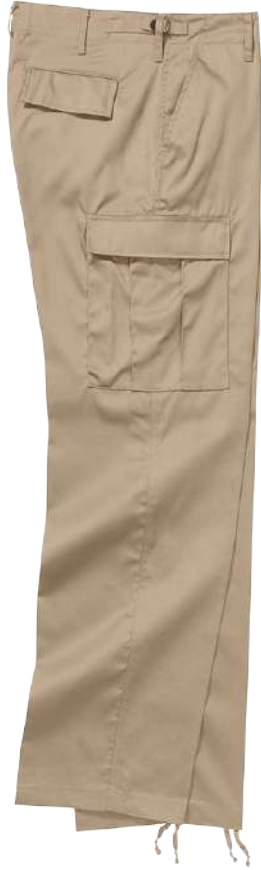
3 · beige