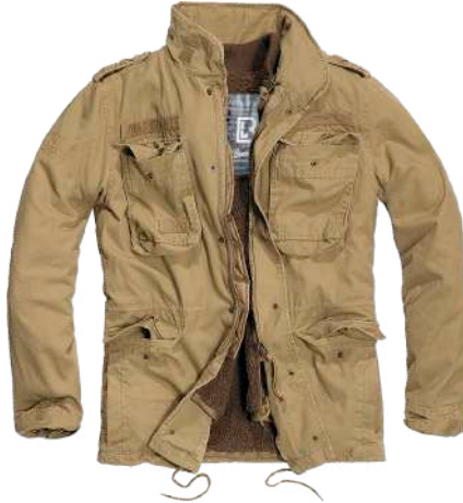
70 · camel