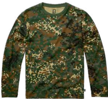
15014 · flecktarn