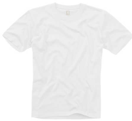
7 · white