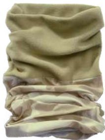
11 · sandstorm