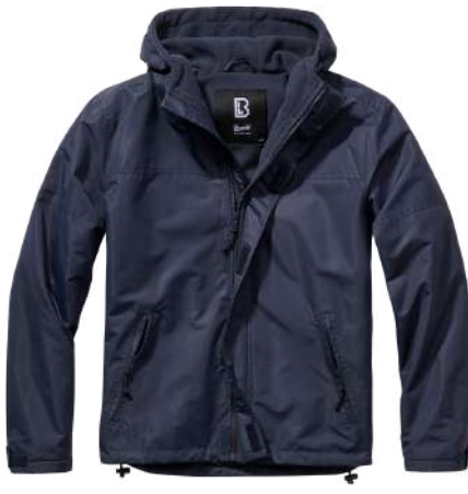
8 · navy