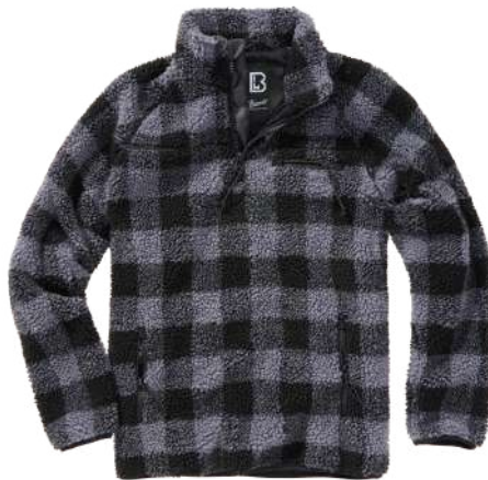
28 · black/grey