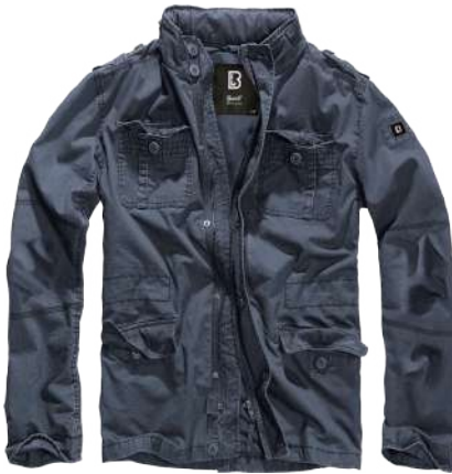
88 · indigo