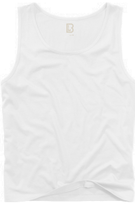
7 · white