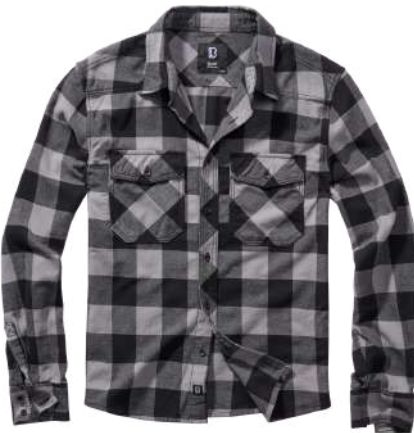
221 · black/charcoal