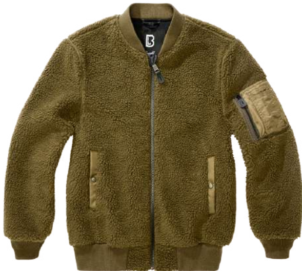
15001 · olive