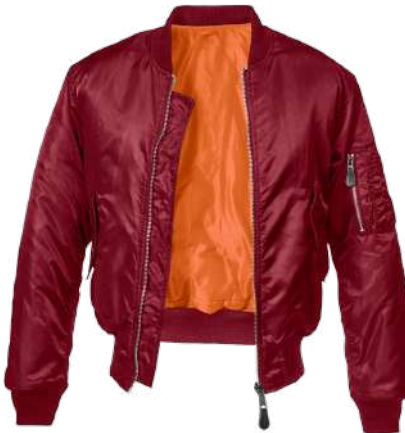
91 · burgundy