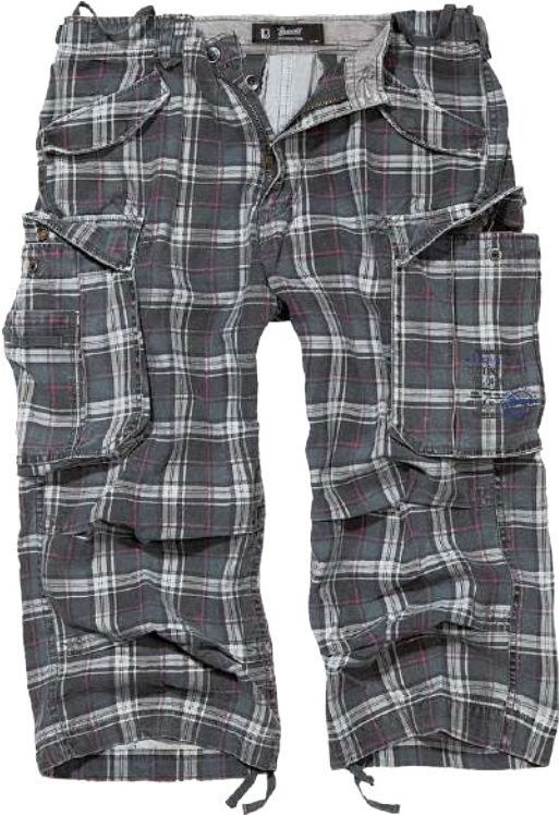
21 · darkgrey purple