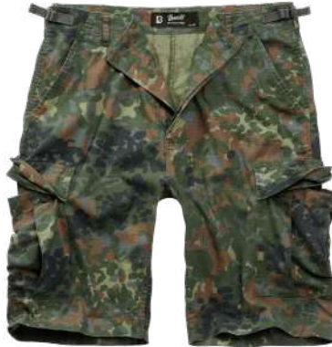
14 · flecktarn