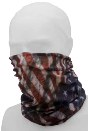
233 · US Flag