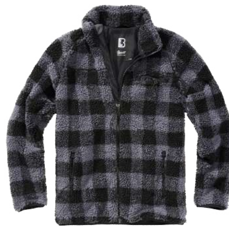
28 · black/grey