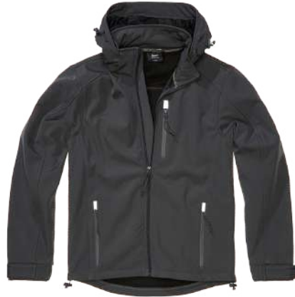
12005 · anthracite