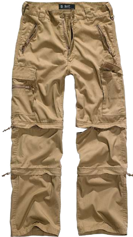
70 · camel