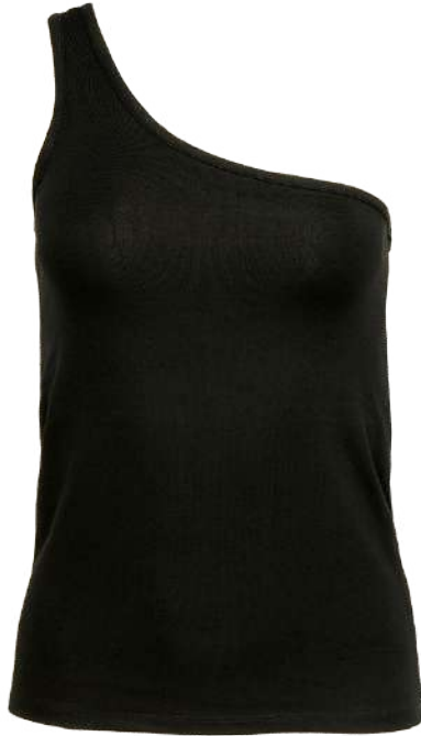
11002 · black