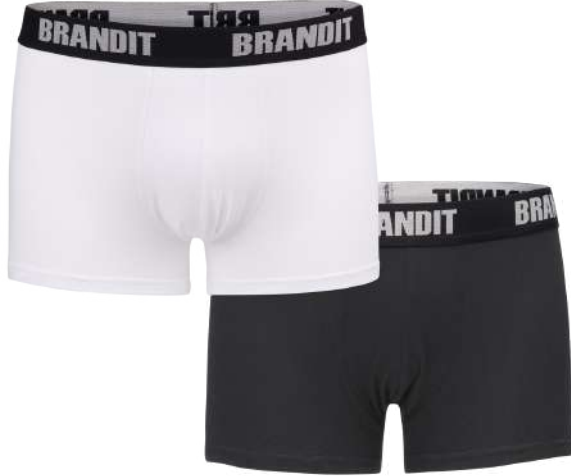
188 · white/black