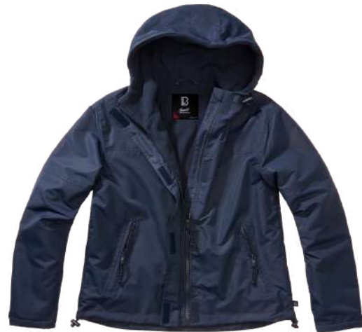
8 · navy