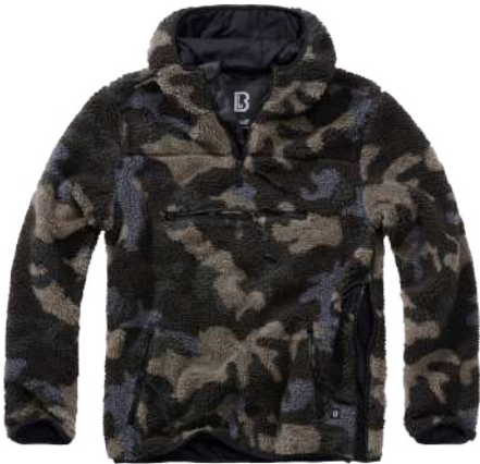
4 · darkcamo