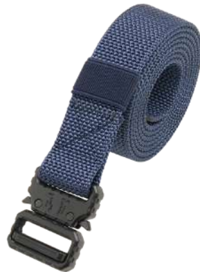
8 · navy