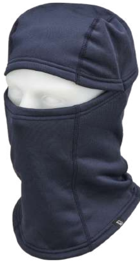
8 · navy