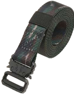
10 · woodland