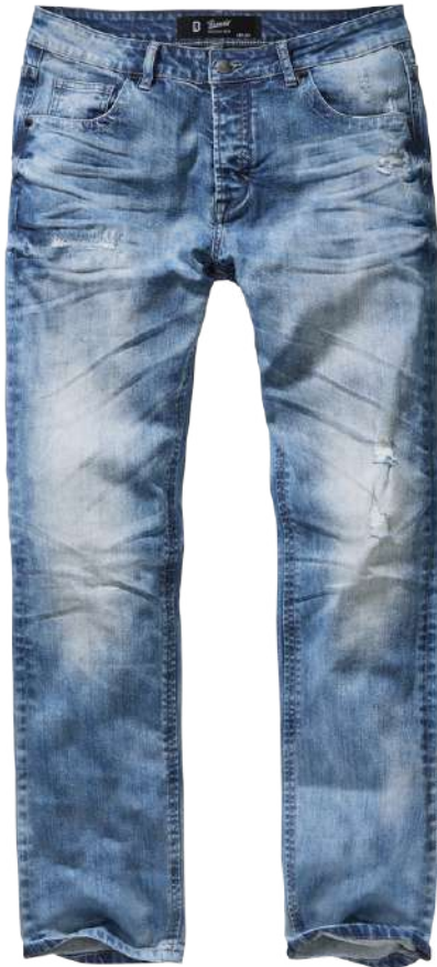
62 · denim blue