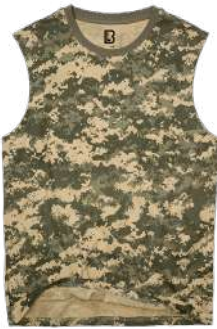
15112 · AT digital