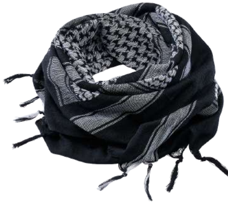
99 · black/white