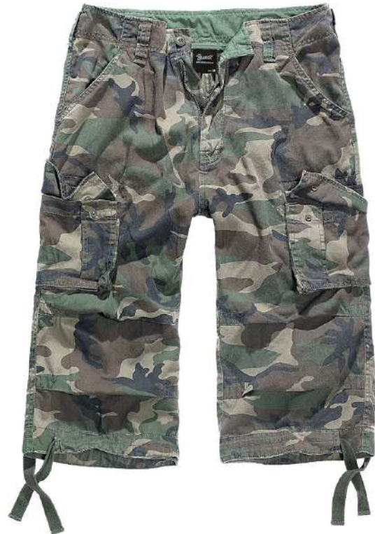
10 · woodland