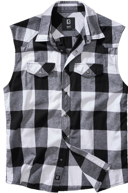
46 · white/black