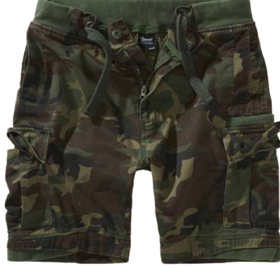
10 · woodland