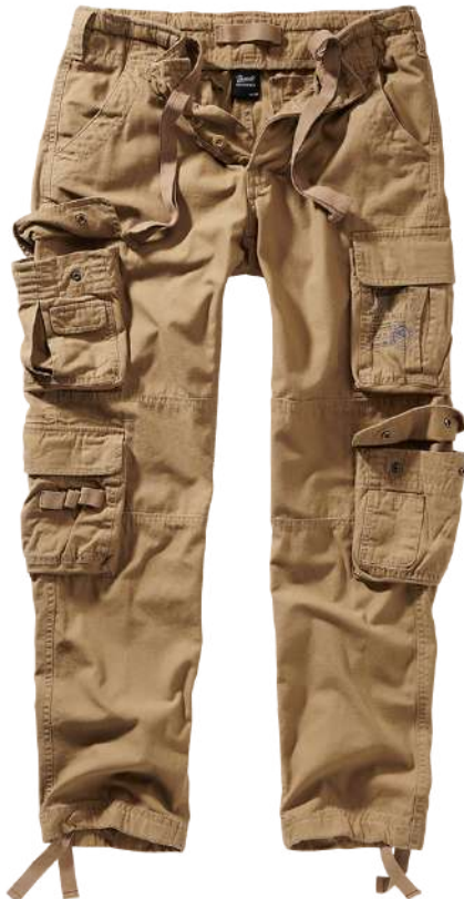
3 · beige