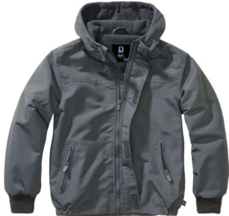
5 · anthracite