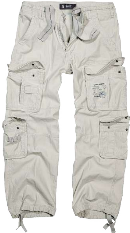
12 · old white