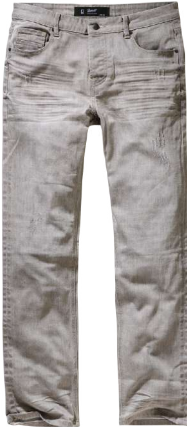
169 · grey denim