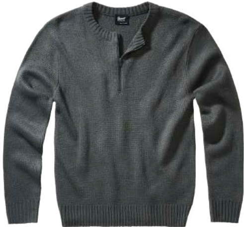
5 · anthracite