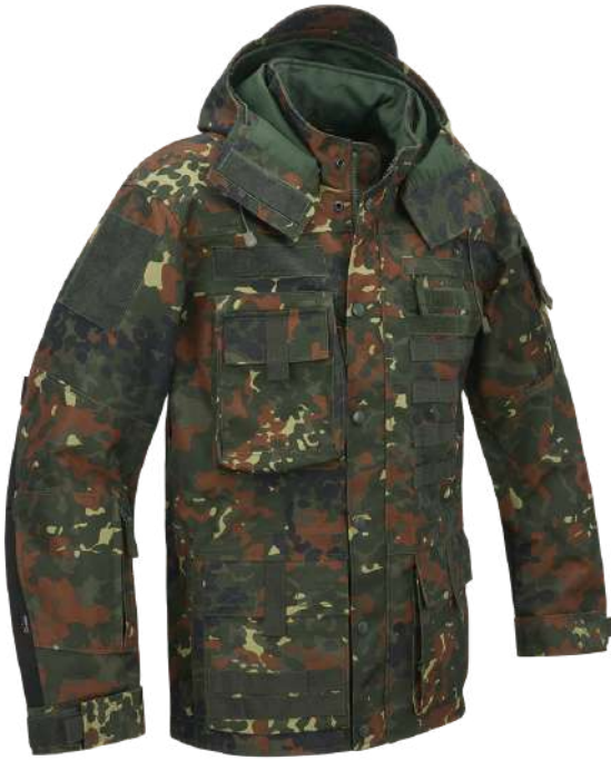
14 · flecktarn