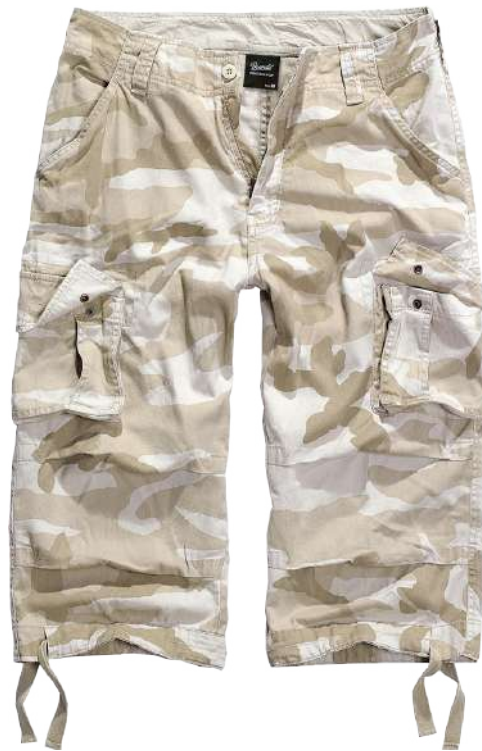
11 · desertstorm