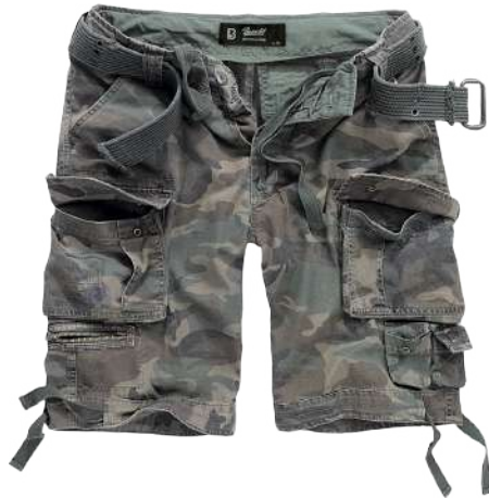
10 · woodland