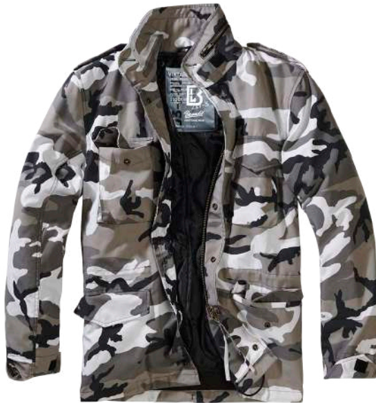
15 · urban