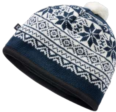
8 · navy