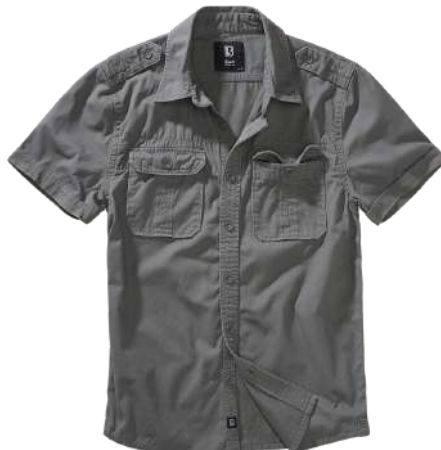
213 · charcoal grey