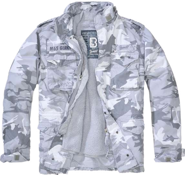
280 · blizzard camo