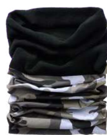
15 · urban