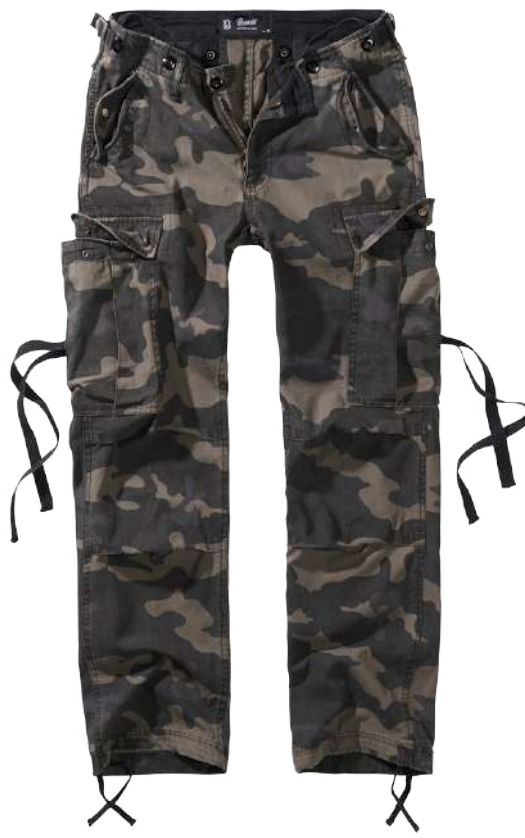
4 · darkcamo