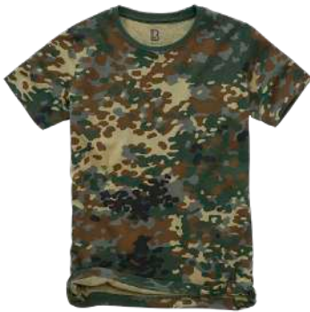
14 · flecktarn