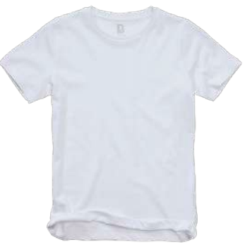
7 · white