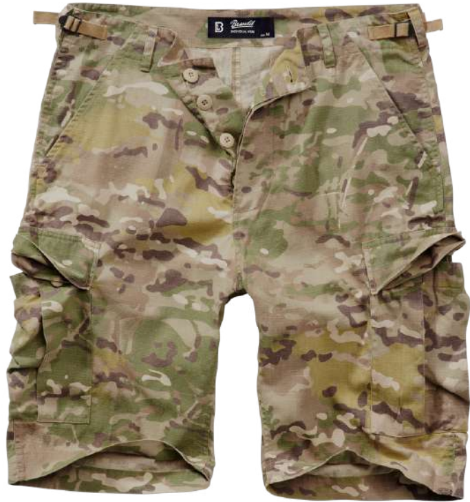
161 · tactical camo