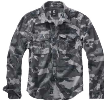
222 · grey camo