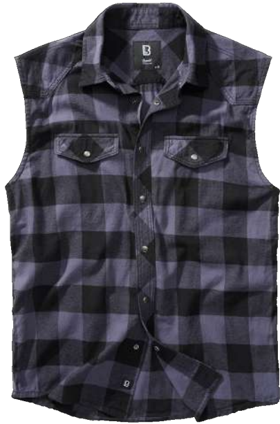
28 · black/grey