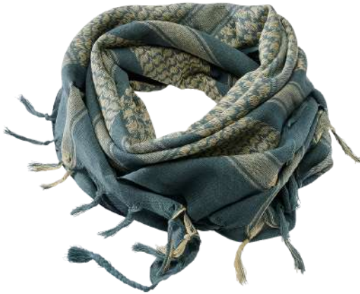
189 · petrol/khaki