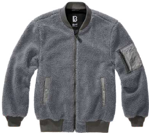
12005 · anthracite