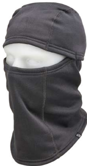
5 · anthracite