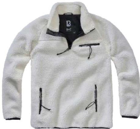
7 · white