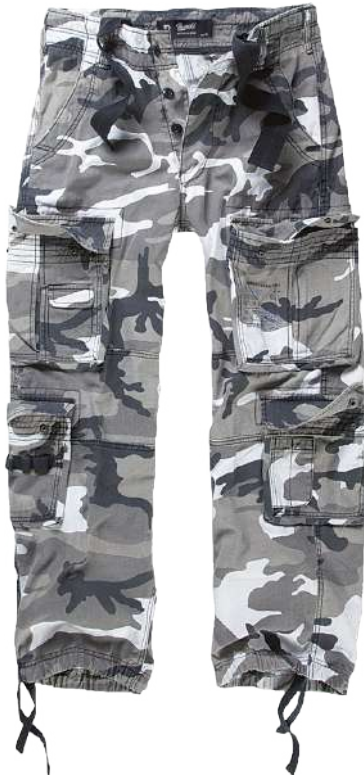
15 · urban