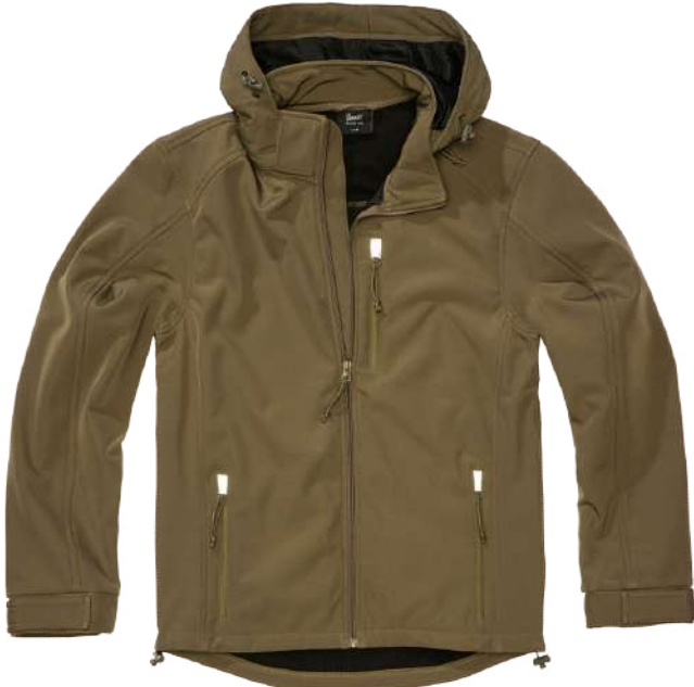
15001 · olive