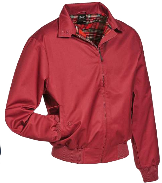
13 · bordeaux