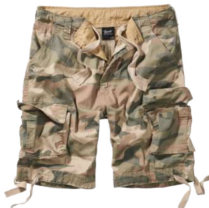
107 · light woodland