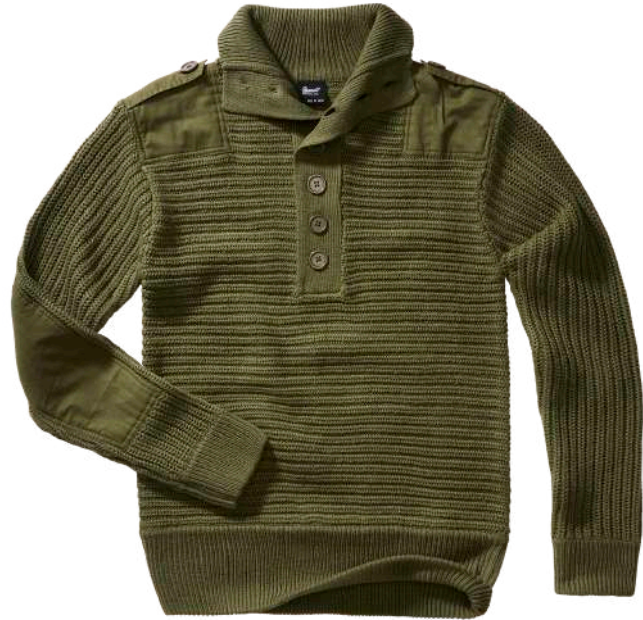
1 · olive