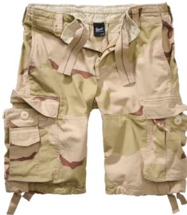
16 · 3 color desert