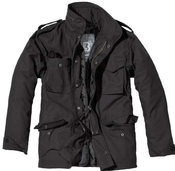
2 · black