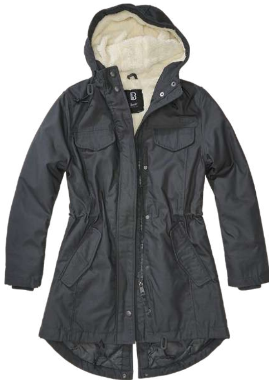
5 · anthracite