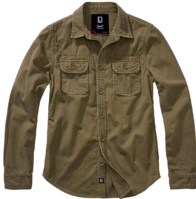
1 · olive