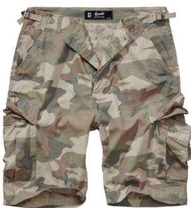
107 · light woodland