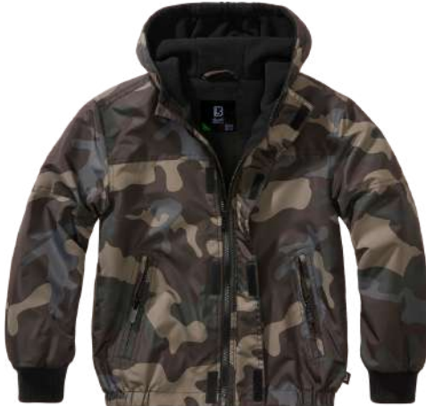
4 · darkcamo