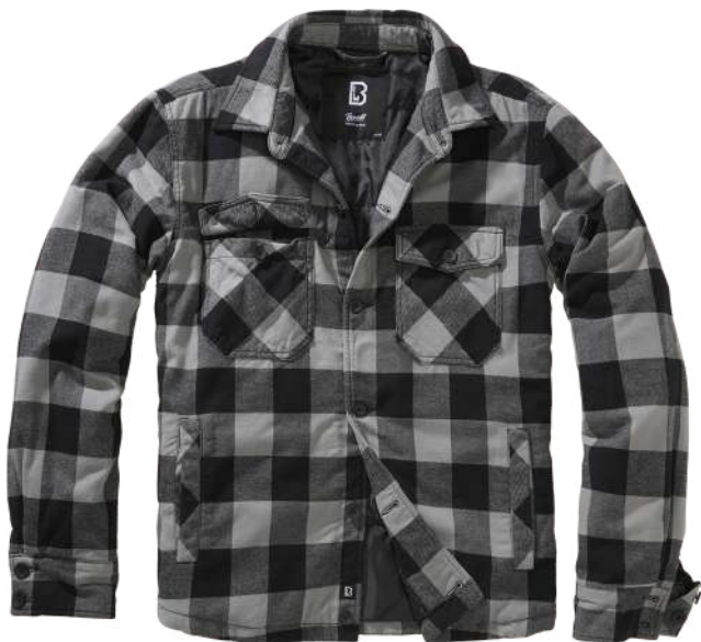
221 · black/charcoal