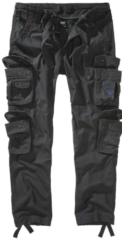
5 · anthracite