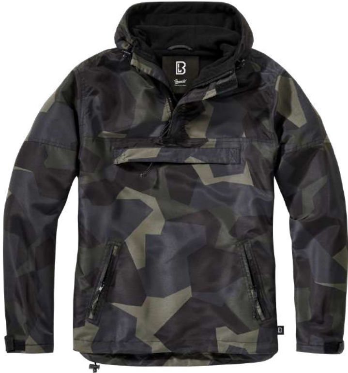
199 · M90 darkcamo