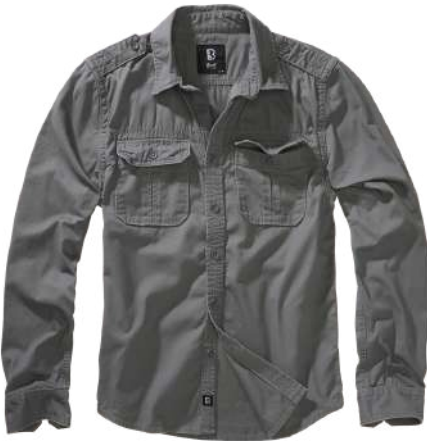
213 · charcoal grey