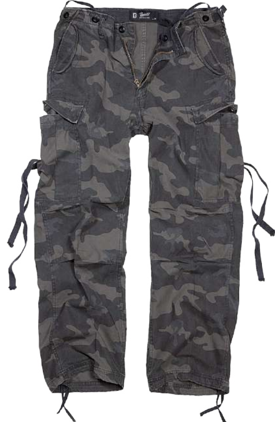
4 · darkcamo