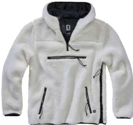
7 · white