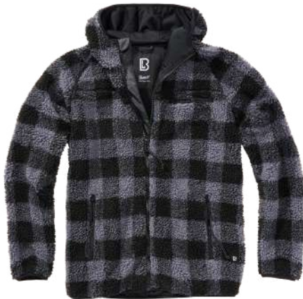
28 · black/grey