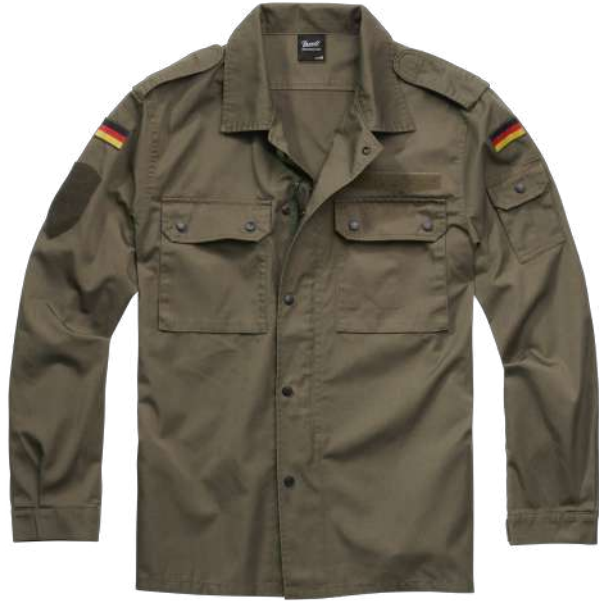
1 · olive