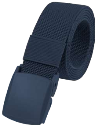
8 · navy