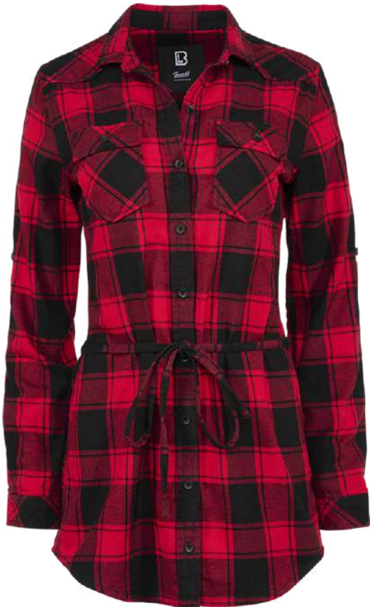
41 · red/black