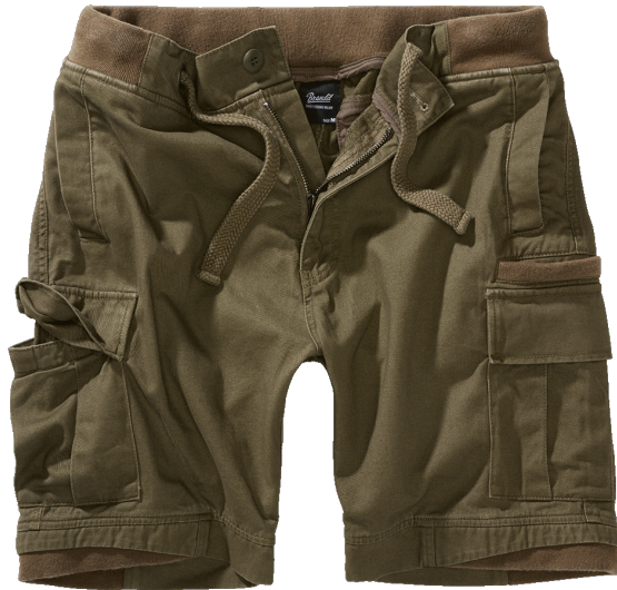
1 · olive