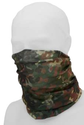
14 · flecktarn