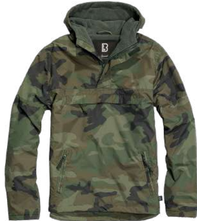
10 · woodland