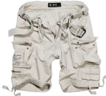
12 · old white