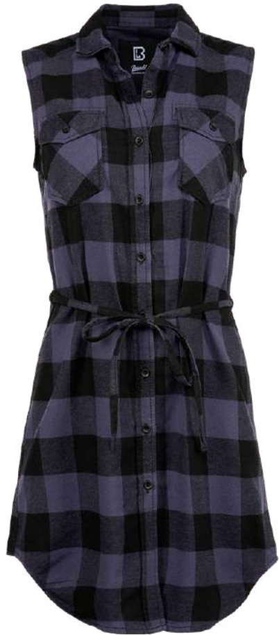
28 · black/grey