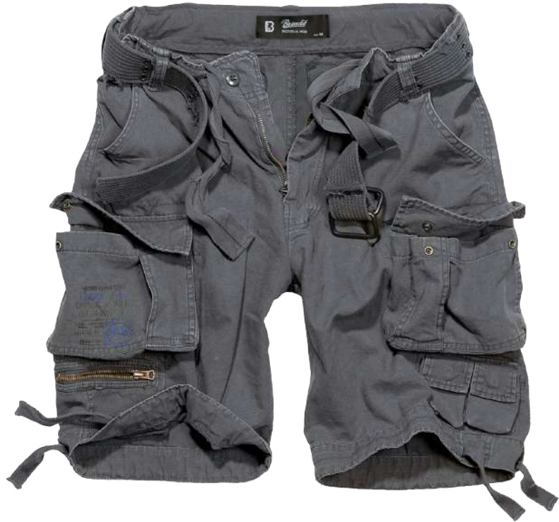
5 · anthracite