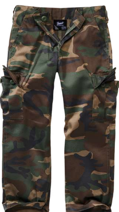
10 · woodland