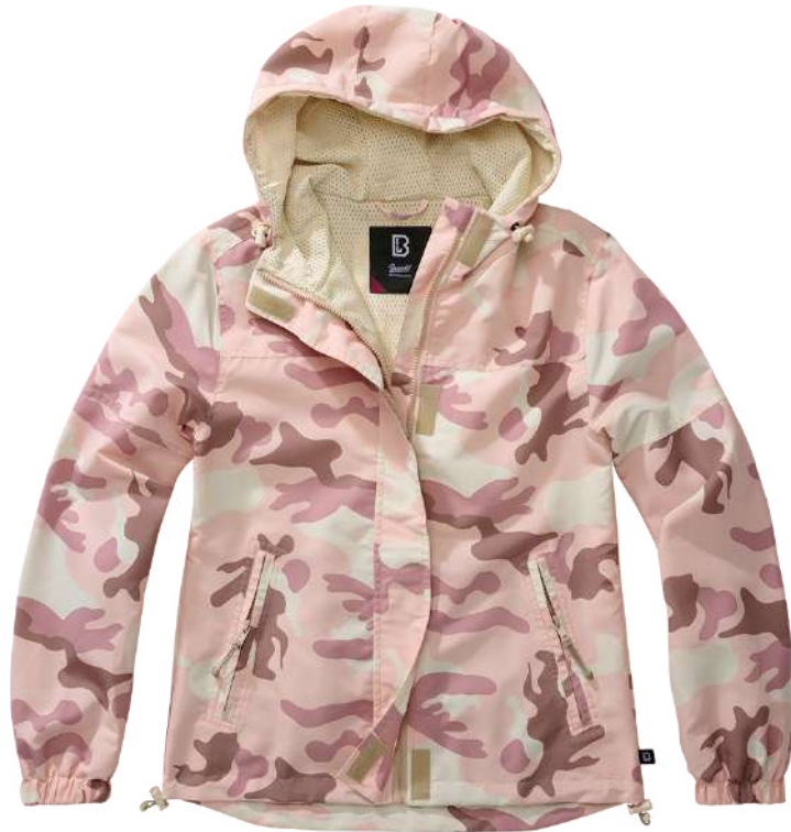
279 · candy camo