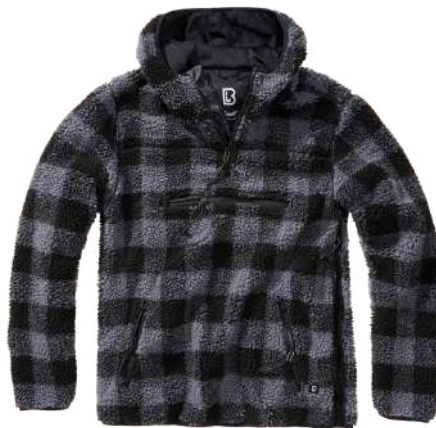
28 · black/grey