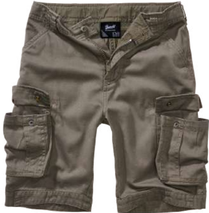
1 · olive