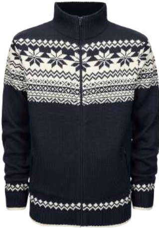
8 · navy