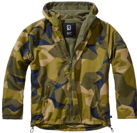
125 · swedish camo