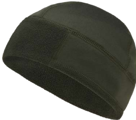
1 · olive