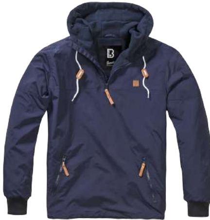
8 · navy