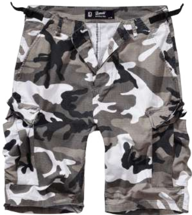
15 · urban