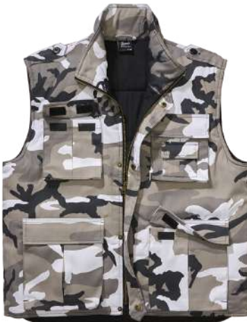
15 · urban