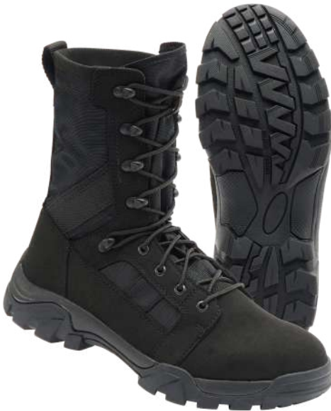
2 · black