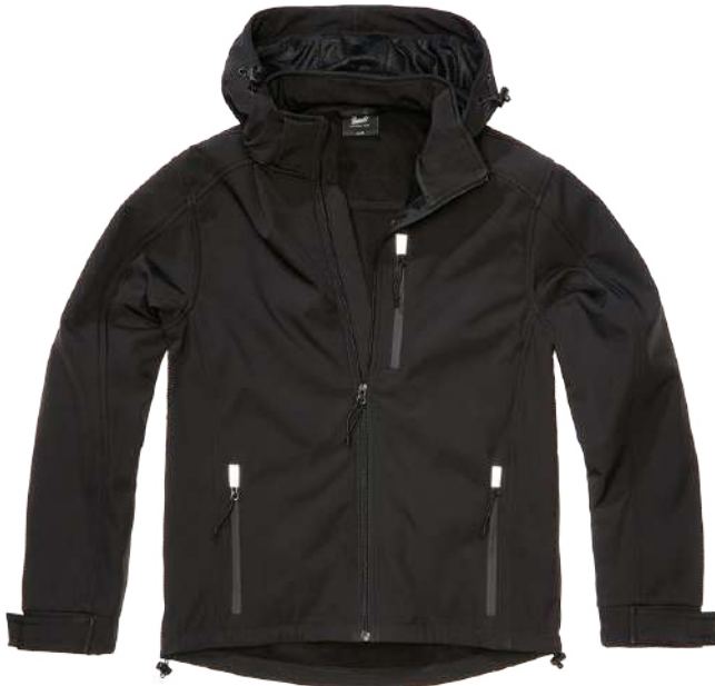
11002 · black