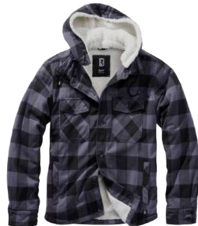
28 · black/grey