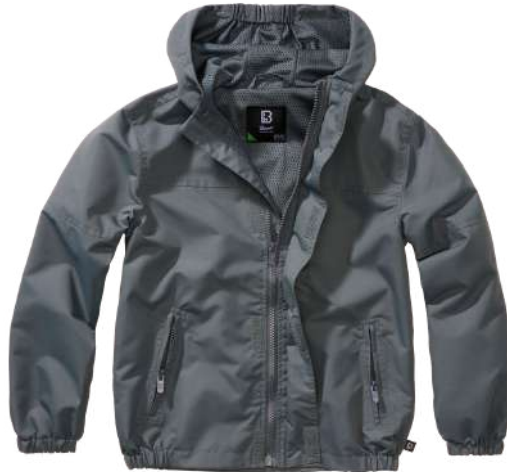
5 · anthracite