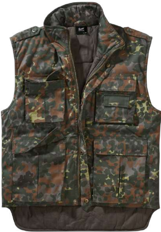
14 · flecktarn