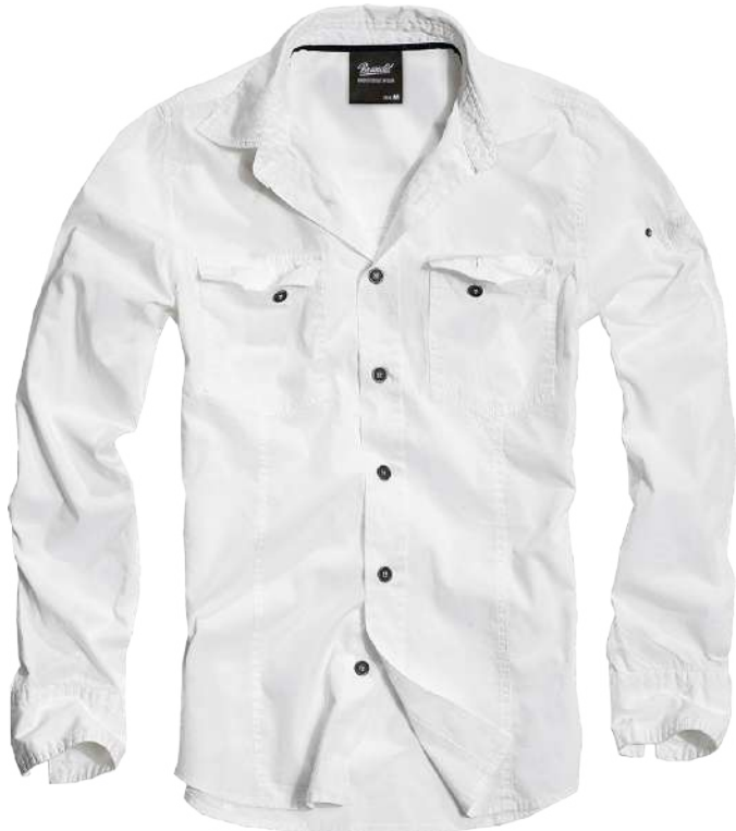
7 · white