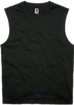
11002 · black