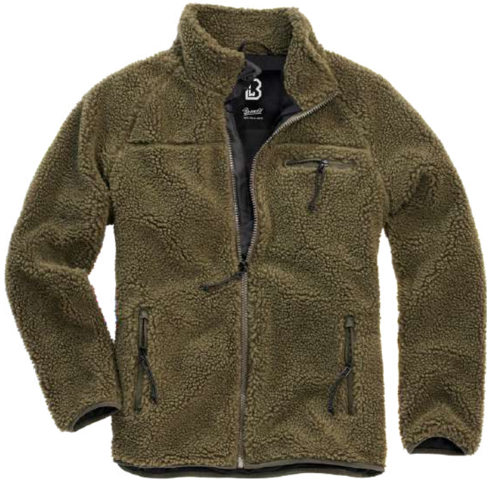
1 · olive