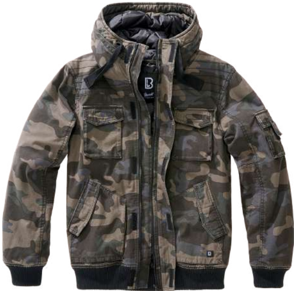
4 · darkcamo