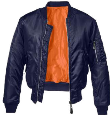
168 · dark navy