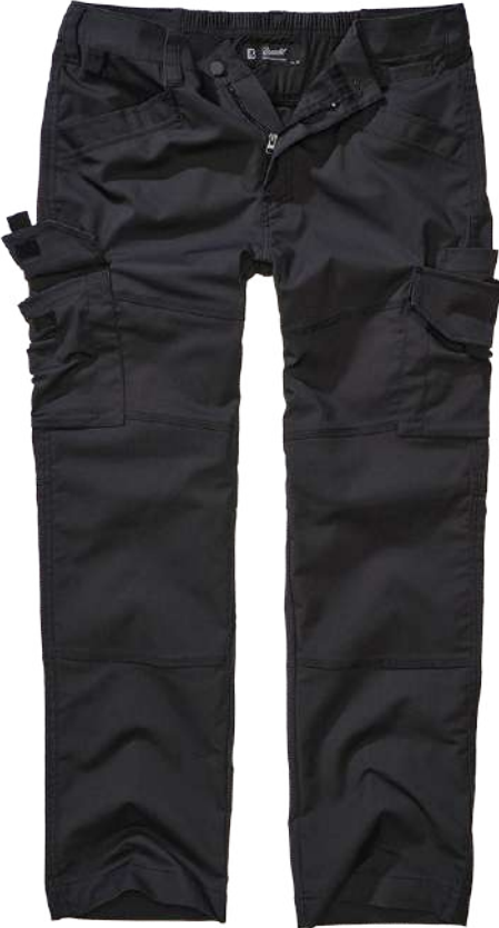
11002 · black