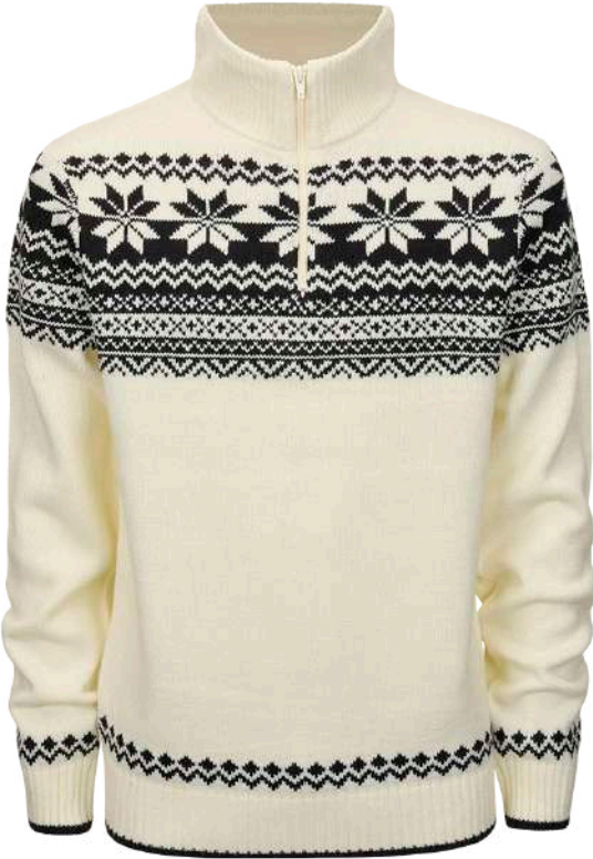
7 · white