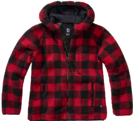
41 · red/black