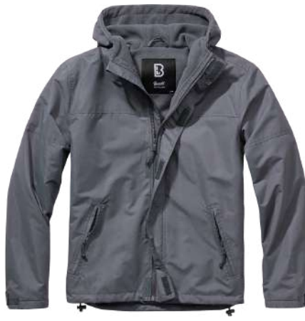
5 · anthracite