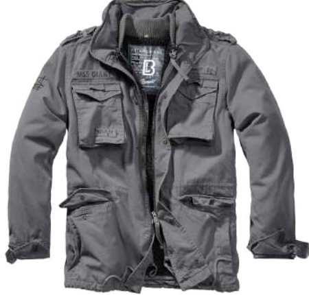
213 · charcoal grey