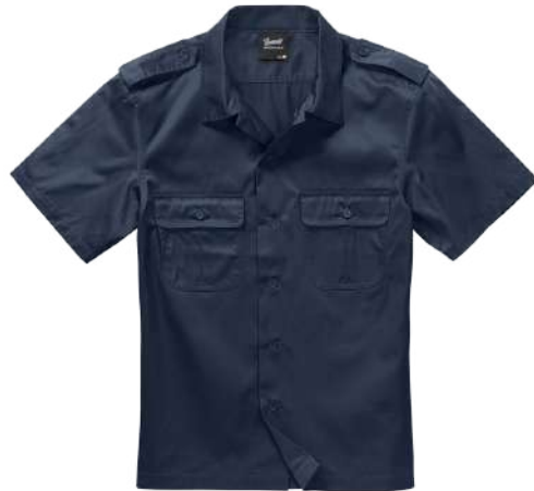
8 · navy