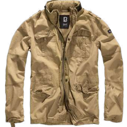
70 · camel