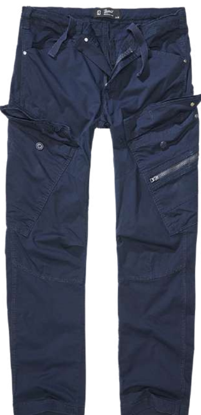
8 · navy