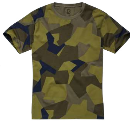
125 · swedish camo