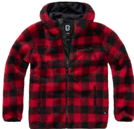
41 · red/black