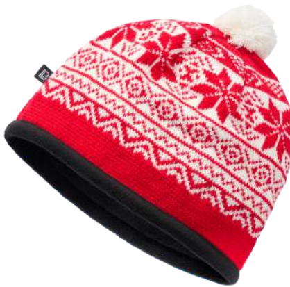
38 · red