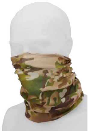
161 · tactical camo