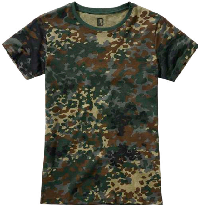
14 · flecktarn