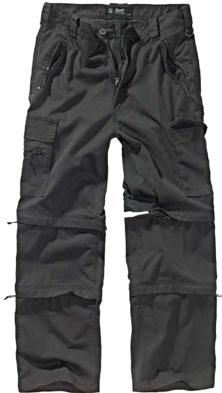
2 · black