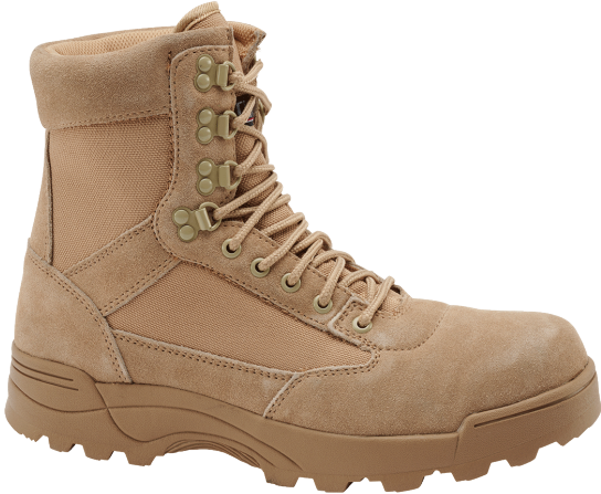
70 · camel