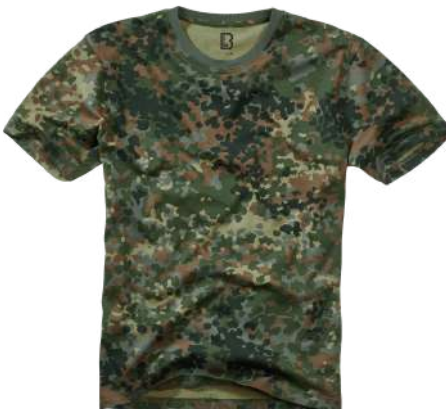
14 · flecktarn