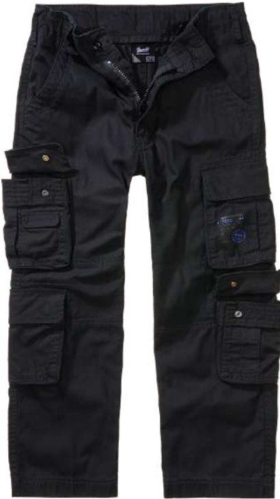
2 · black