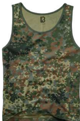
14 · flecktarn