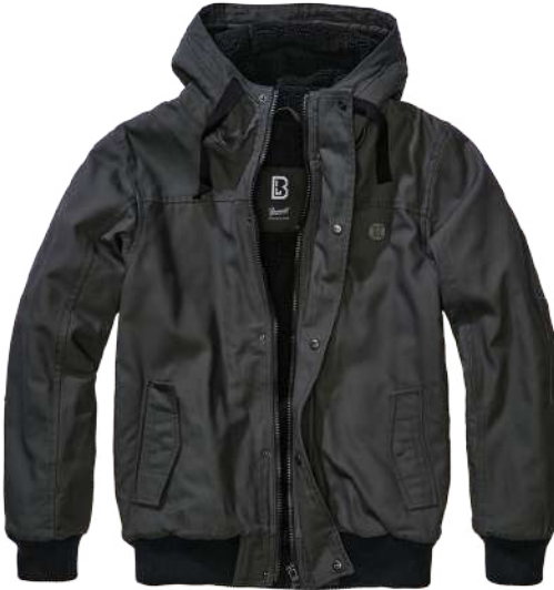
12005 · anthracite