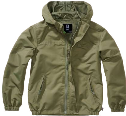
1 · olive