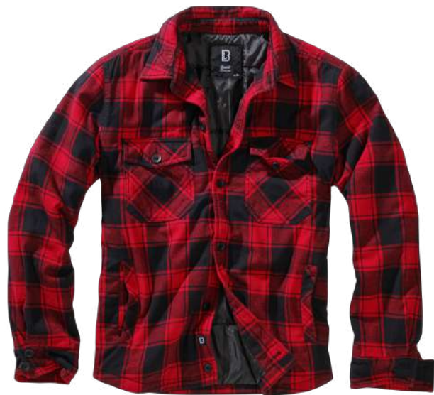
41 · red/black