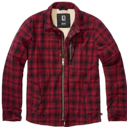
41 · red/black