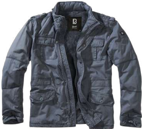
88 · indigo