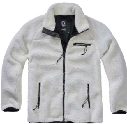
7 · white