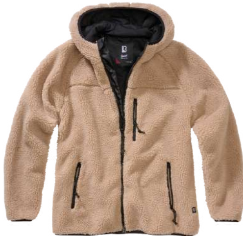
70 · camel