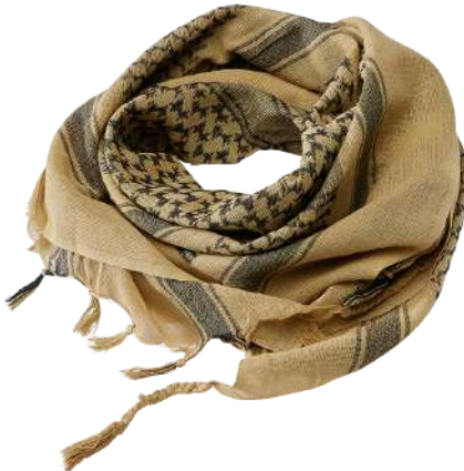
191 · khaki/black