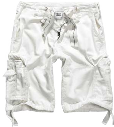
7 · white