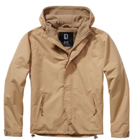
70 · camel