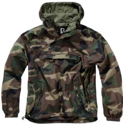
10 · woodland