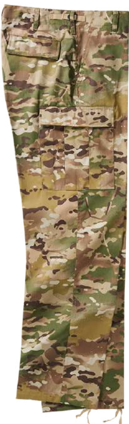
161 · tactical camo