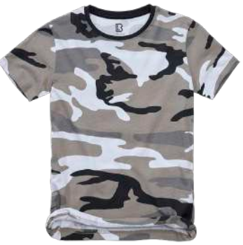
15 · urban