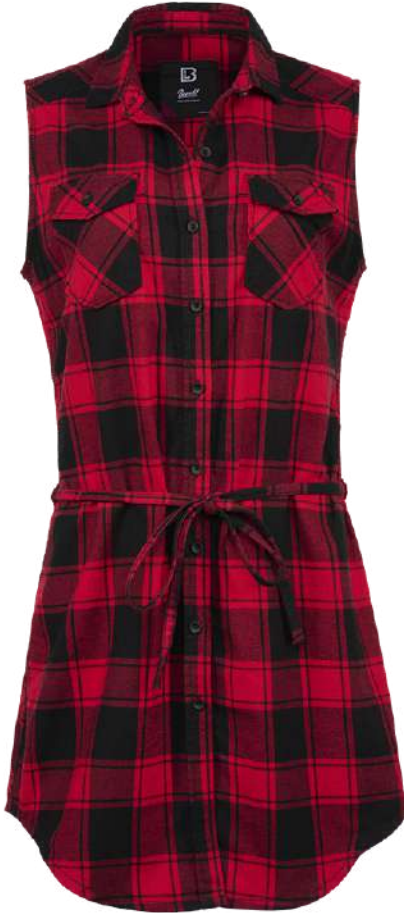
41 · red/black