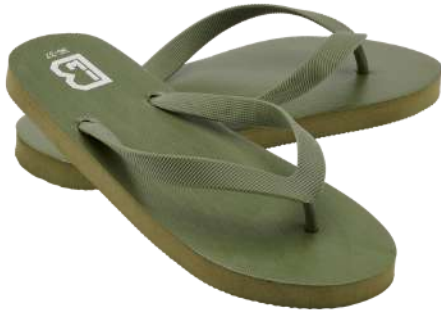
1 · olive