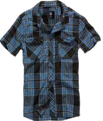
87 · indigo