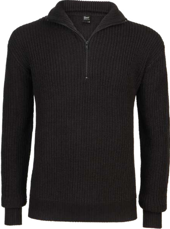
2 · black