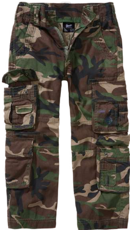
10 · woodland