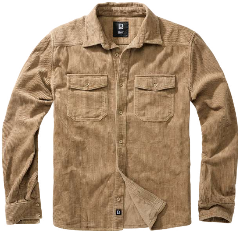
70 · camel