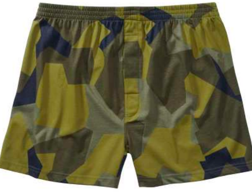
125 · swedish camo