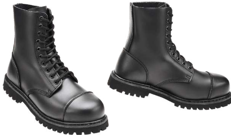
2 · black