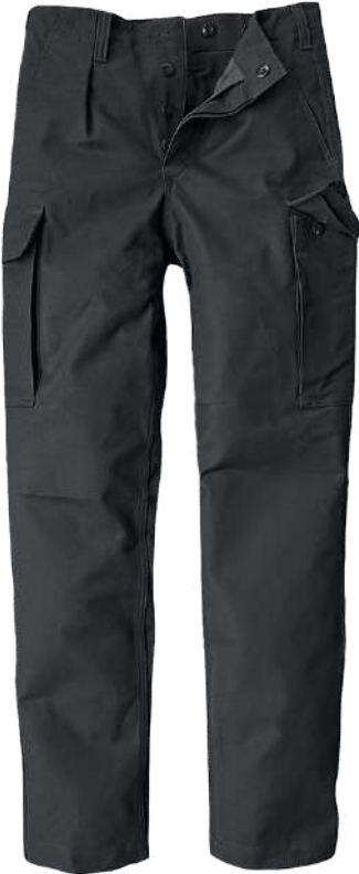
11002 · black