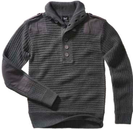
5 · anthracite