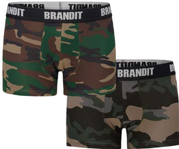
197 · woodland/darkcamo