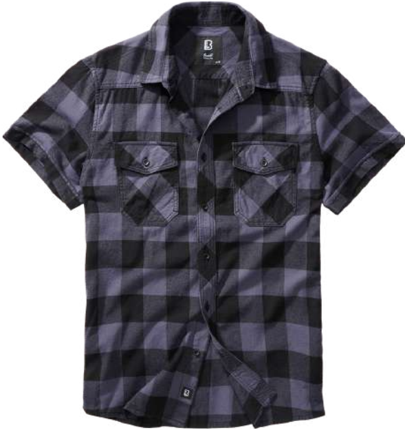
28 · black/grey