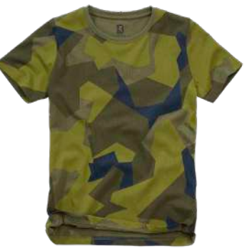
125 · swedish camo