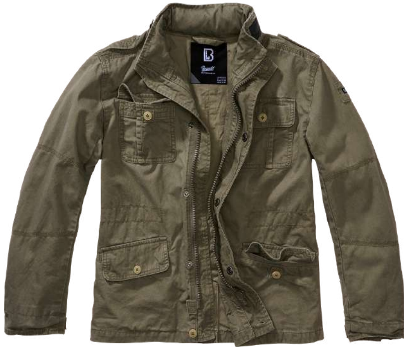
1 · olive