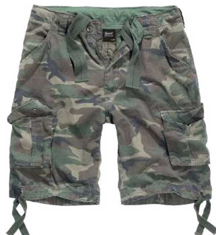
10 · woodland