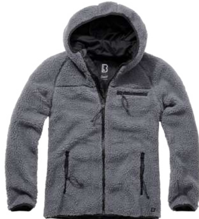
5 · anthracite