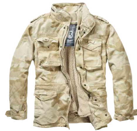
11 · sandstorm