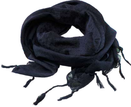
193 · black/navy