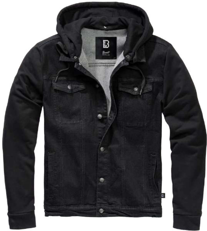
196 · black-black