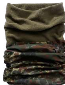
14 · flecktarn