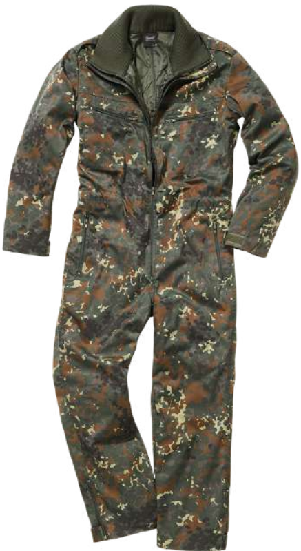
14 · flecktarn