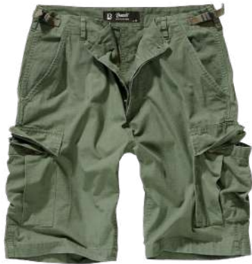
1 · olive