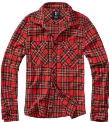
47 · tartan