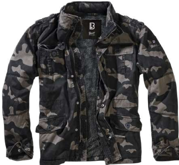
4 · darkcamo