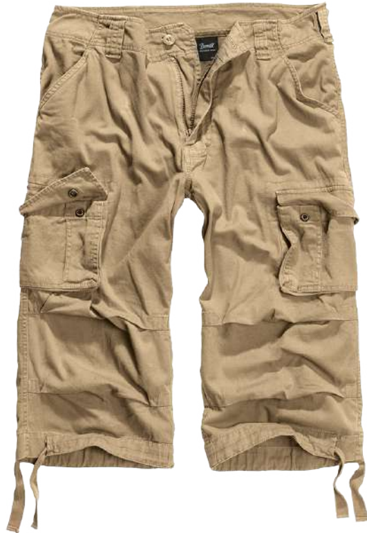
3 · beige