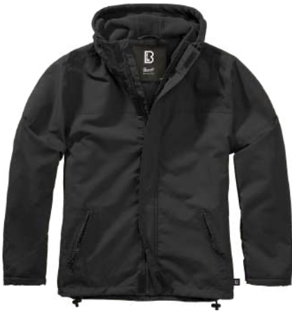
2 · black