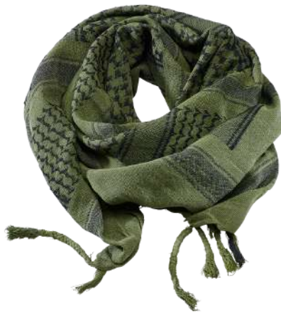
190 · olive/black