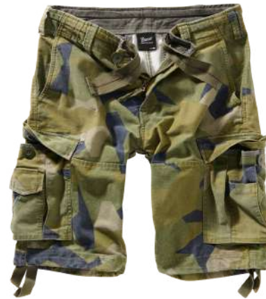
125 · swedish camo