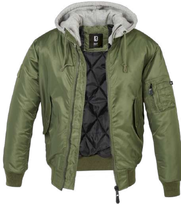
136 · olive/grey