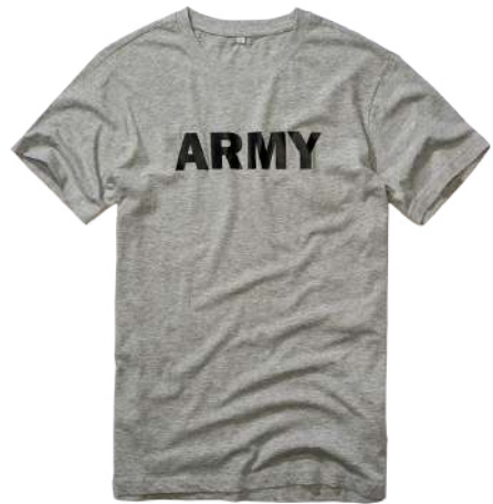
182 · grey melange