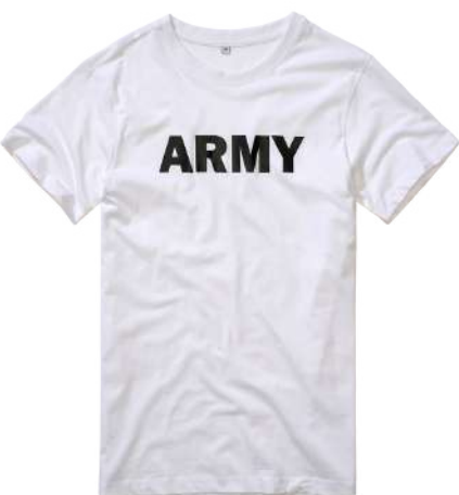
11007 · white