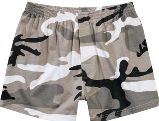
15 · urban