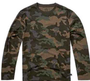
12004 · darkcamo