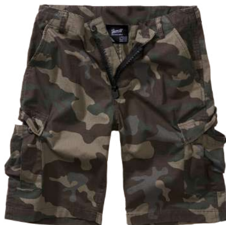
4 · darkcamo