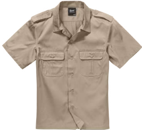
3 · beige