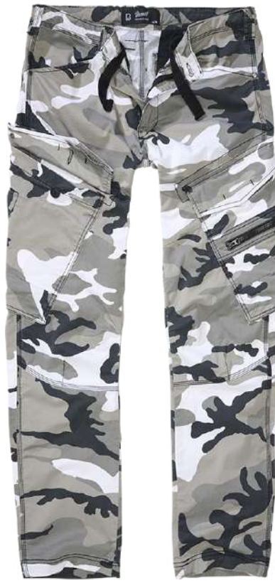
15 · urban