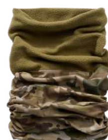
161 · tactical camo