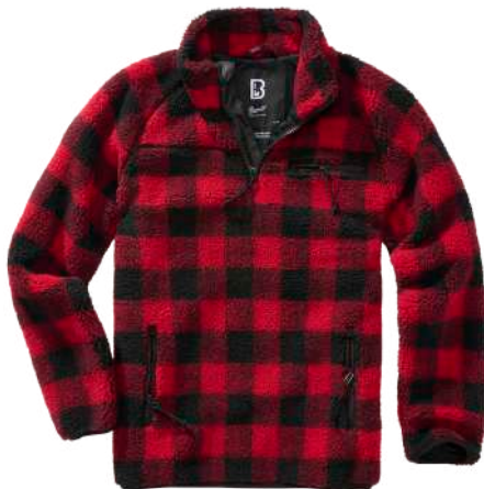
41 · red/black