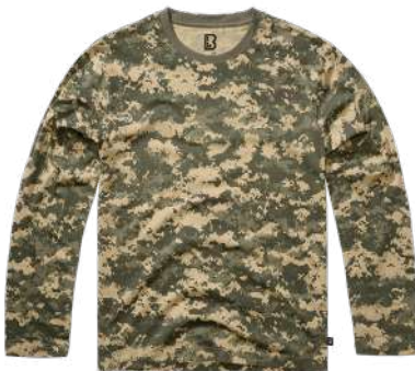
15112 · AT digital