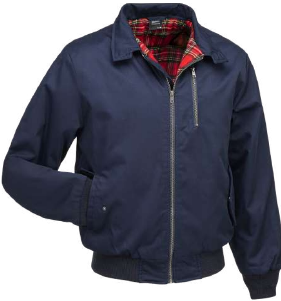
8 · navy