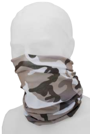
15 · urban