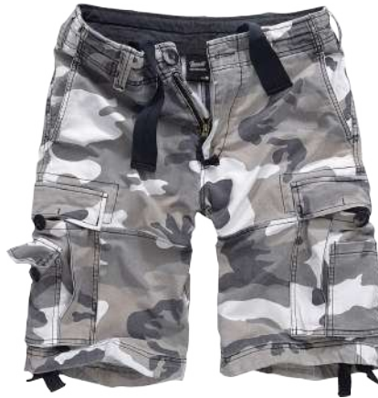
15 · urban