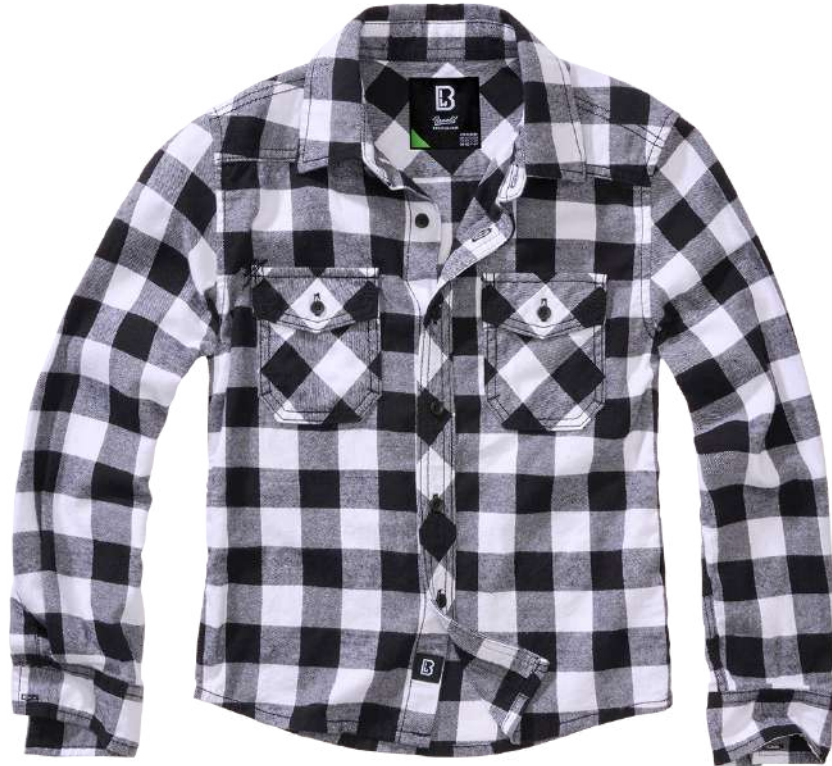
46 · white/black