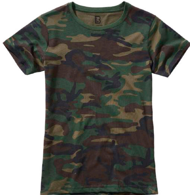
10 · woodland