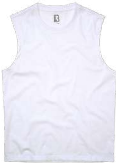
11007 · white