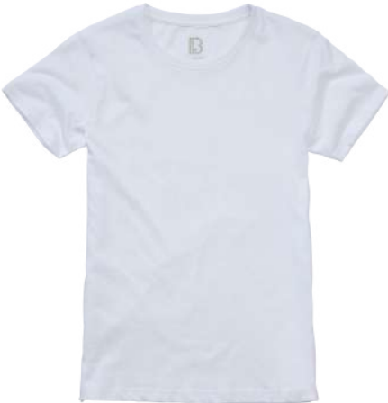
7 · white