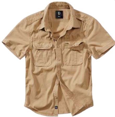
70 · camel