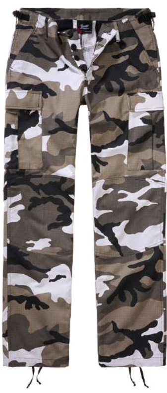
15 · urban