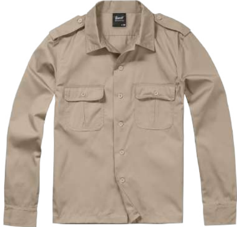
3 · beige