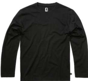
11002 · black