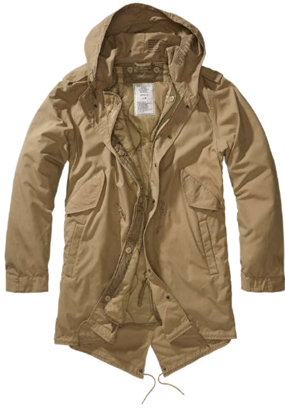
70 · camel