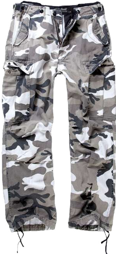
15 · urban