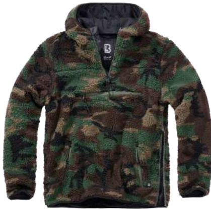
10 · woodland