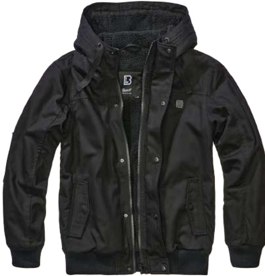
11002 · black