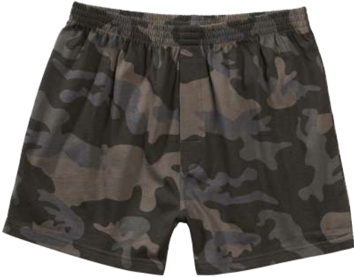
4 · darkcamo