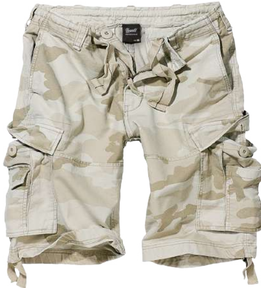
11 · sandstorm