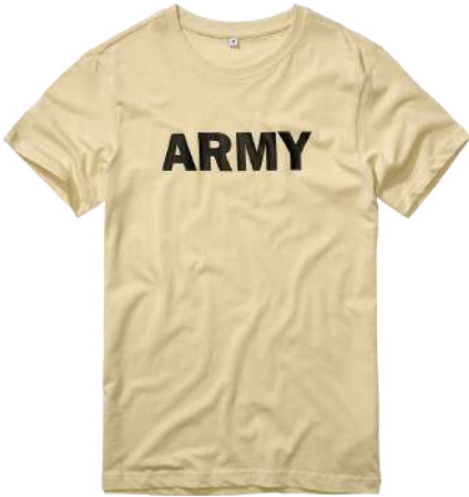
20003 · beige