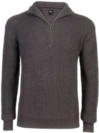
5 · anthracite