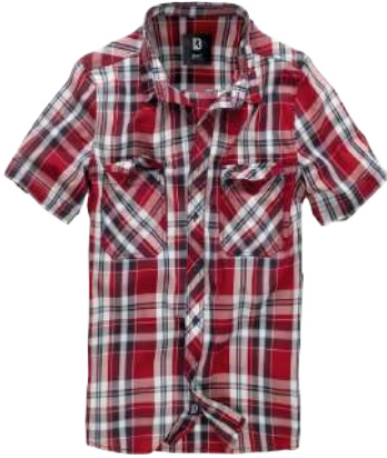
38 · red