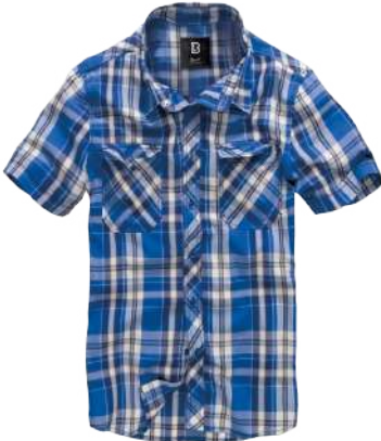
53 · blue