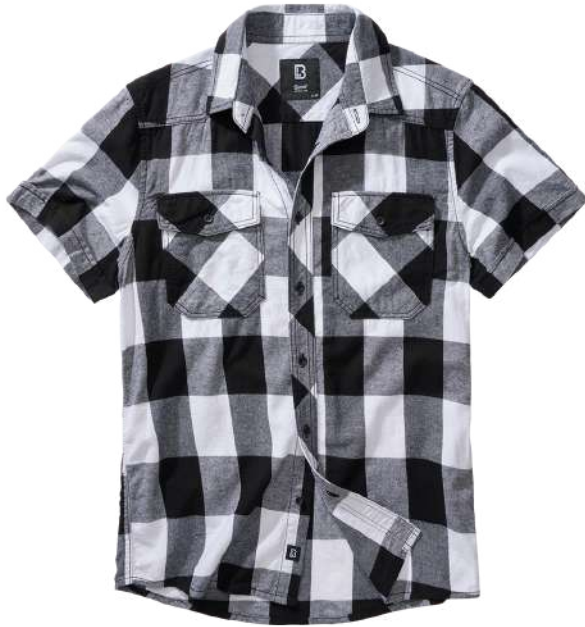
46 · white/black