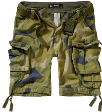
125 · swedish camo