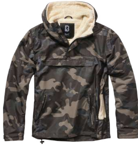
4 · darkcamo