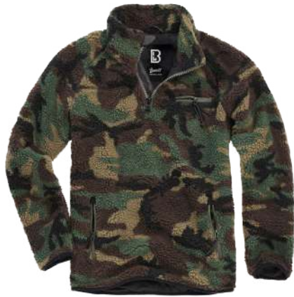
10 · woodland