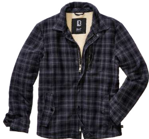
130 · anthra/black