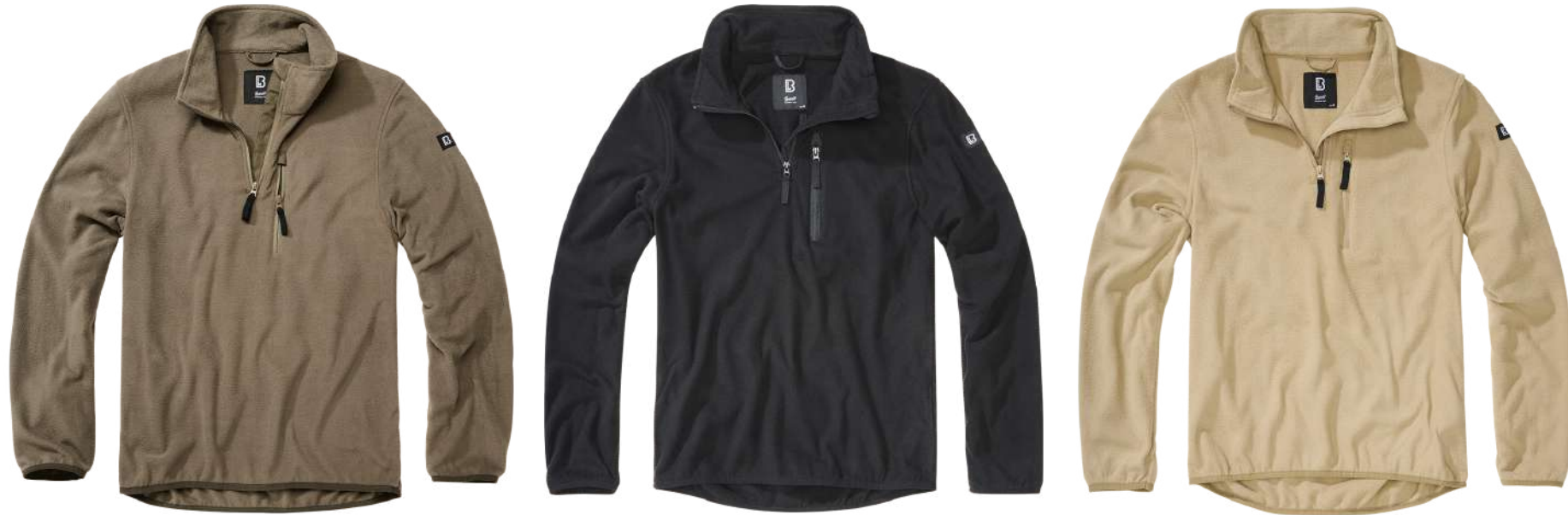
1 · olive