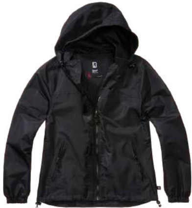
2 · black