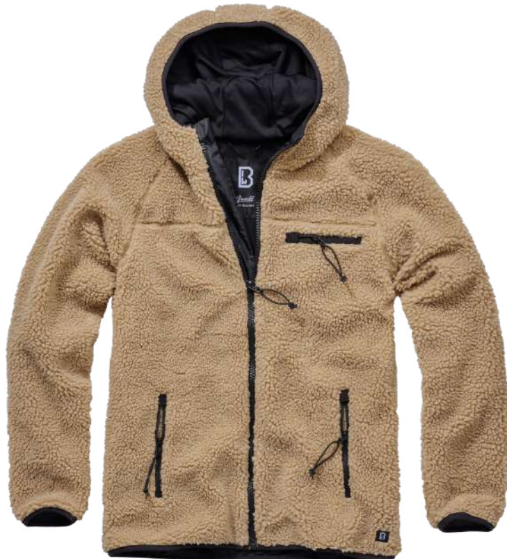
70 · camel