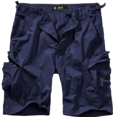
8 · navy