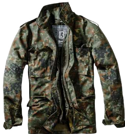
14 · flecktarn