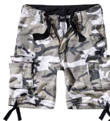
15 · urban