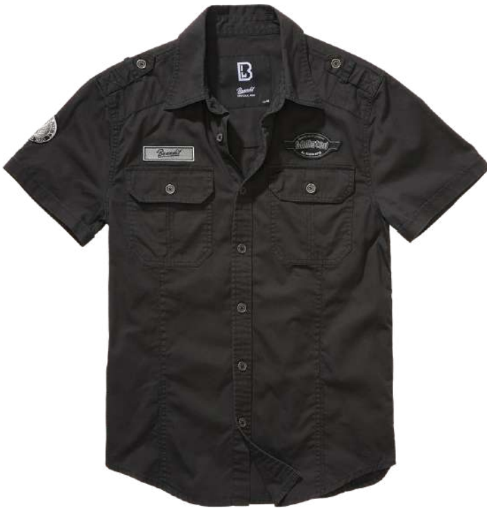
2 · black