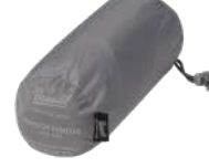
5 · anthracite