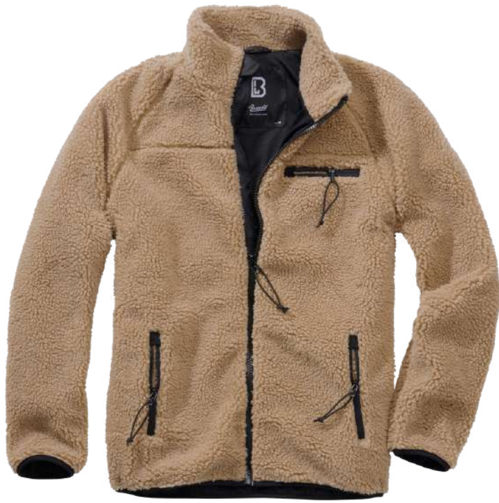
70 · camel