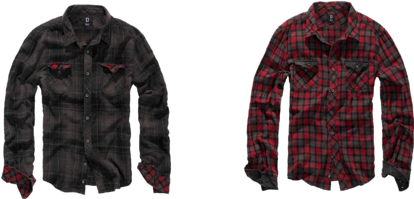
67 · brown/black