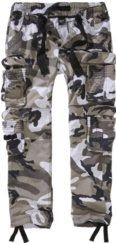
15 · urban