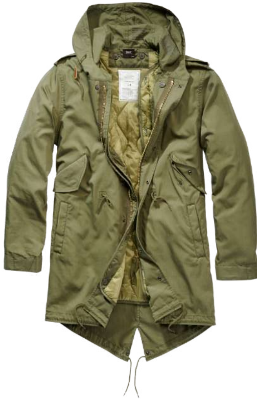
1 · olive