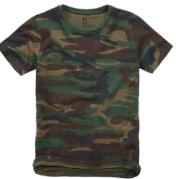
10 · woodland