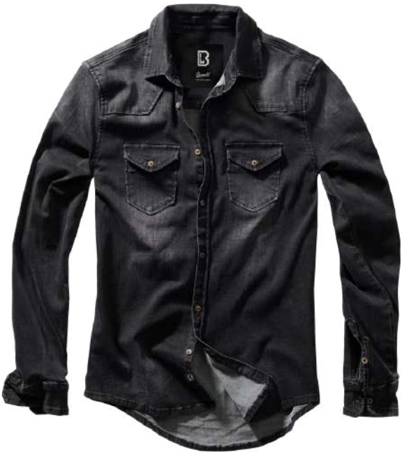
2 · black