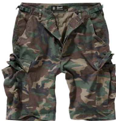
10 · woodland