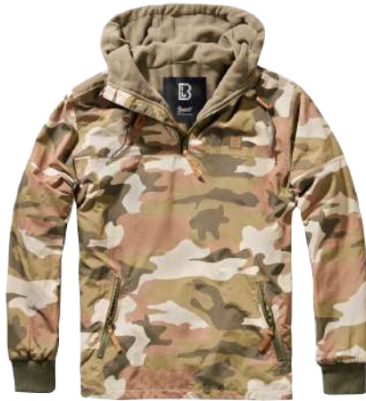
107 · light woodland