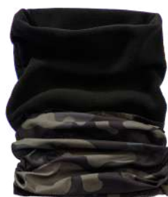
4 · darkcamo