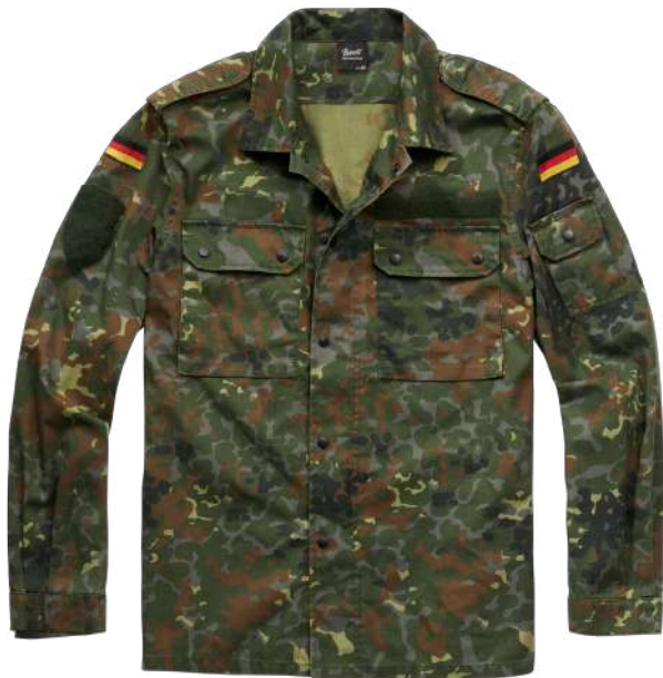
14 · flecktarn