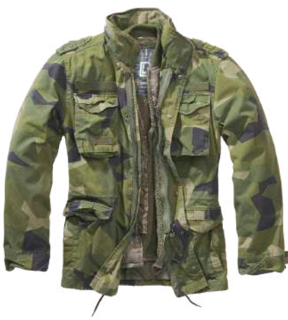
125 · swedish camo