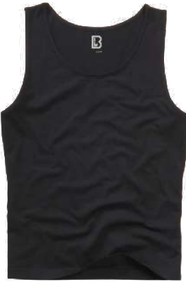
2 · black