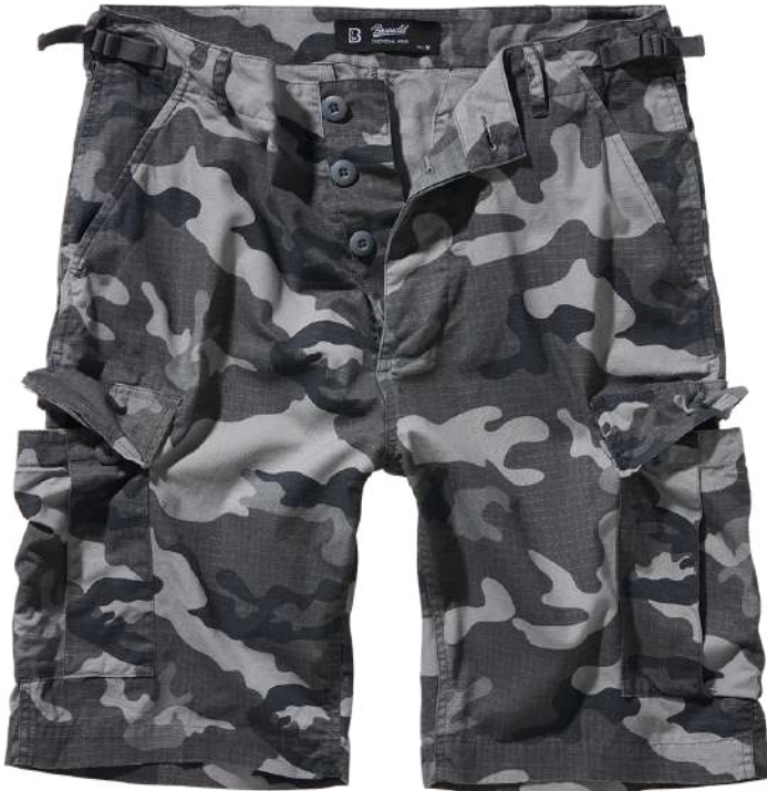
222 · grey camo