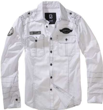
7 · white