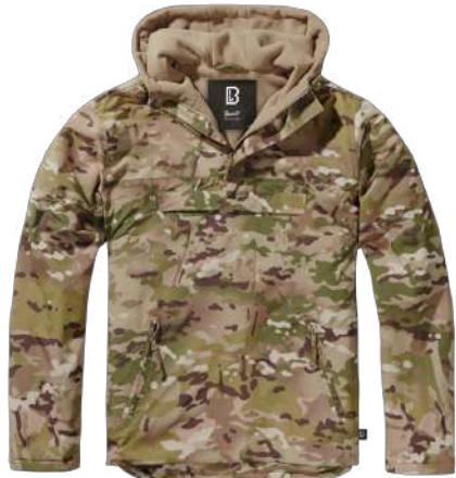
161 · tactical camo