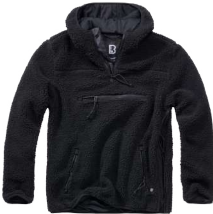
2 · black