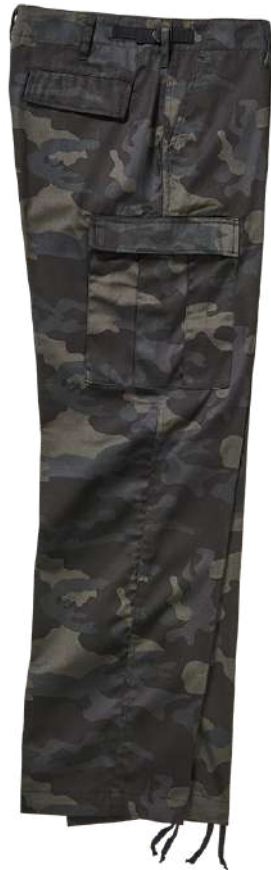
4 · darkcamo