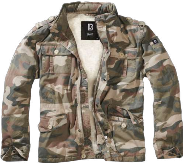
107 · light woodland