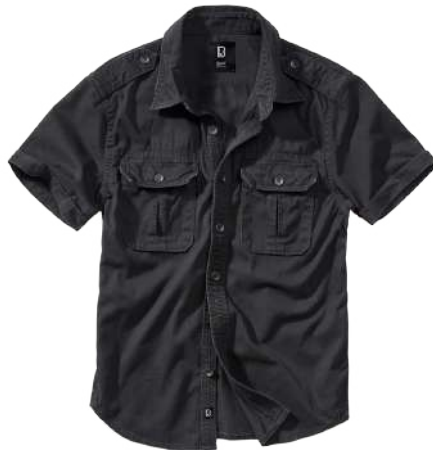
2 · black