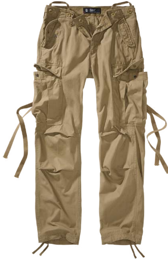
70 · camel