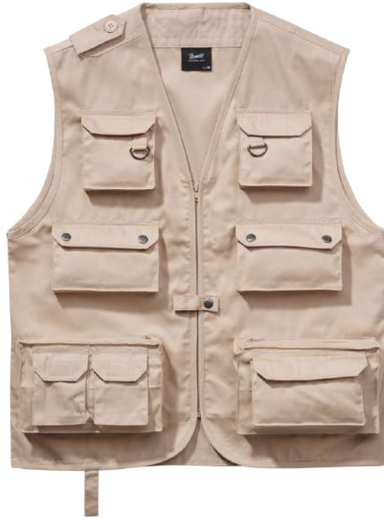
3 · beige