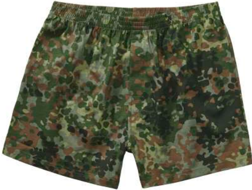
14 · flecktarn