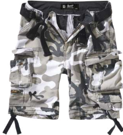
15 · urban