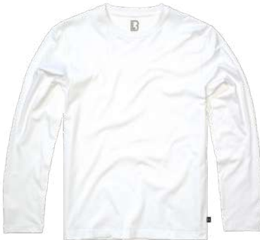
11007 · white