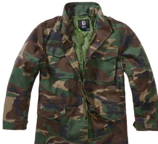
10 · woodland