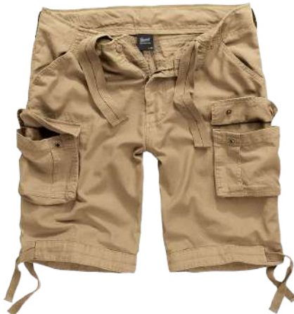
3 · beige