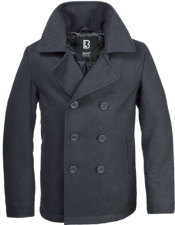
2 · black