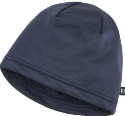
8 · navy