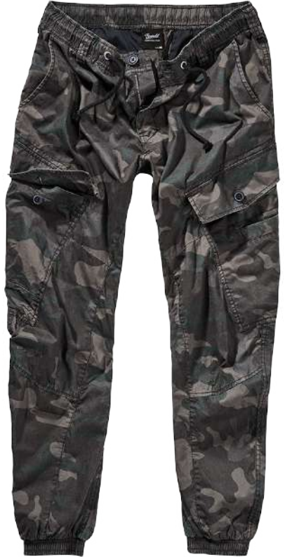
4 · darkcamo