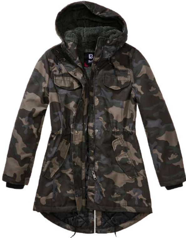
4 · darkcamo