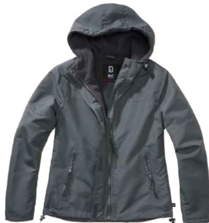
5 · anthracite