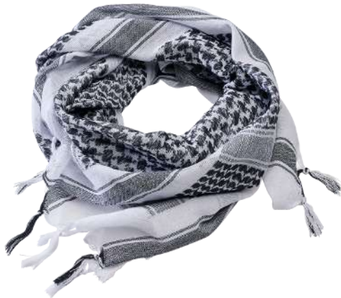
188 · white/black