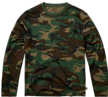
15010 · woodland