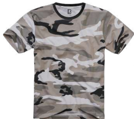
15 · urban