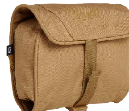
COLOR | 20070 - camel