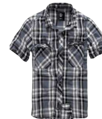
COLOR | 12069 black_anthracite_ch