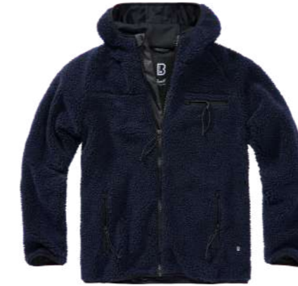
COLOR | 14008 · navy