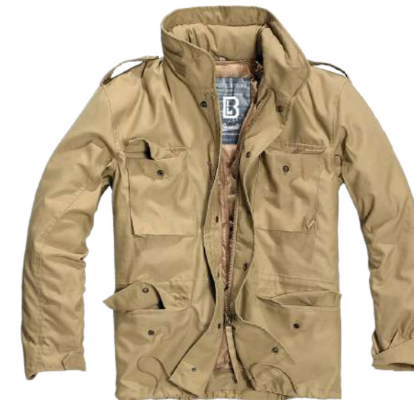
COLOR | 20070 · camel