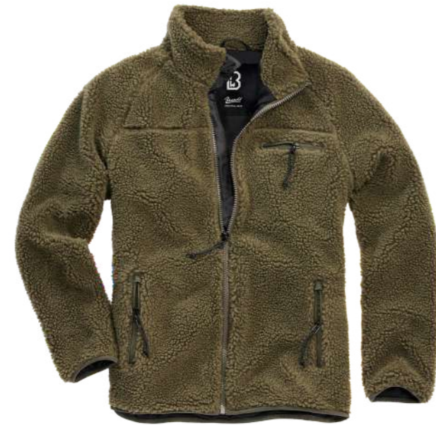
COLOR | 15001 · olive