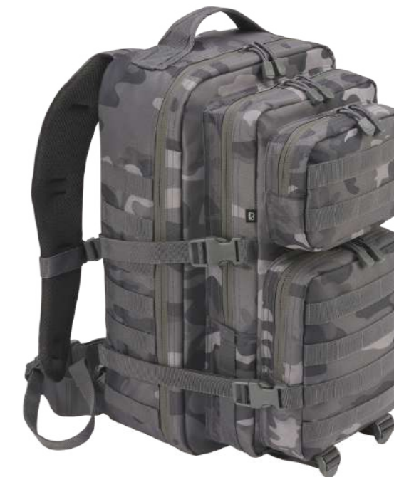
COLOR | 12222 · grey_camo