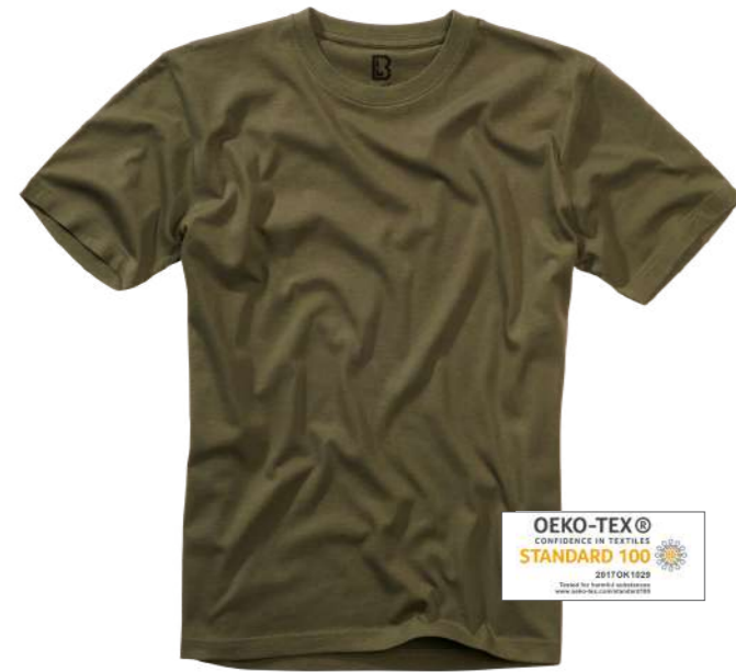
COLOR | 15001 · olive