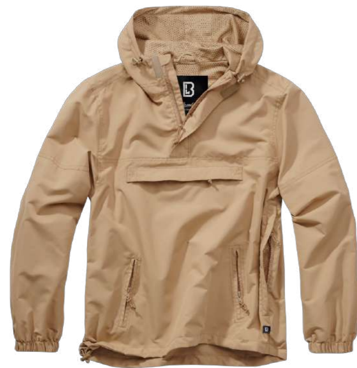
COLOR | 20070 · camel