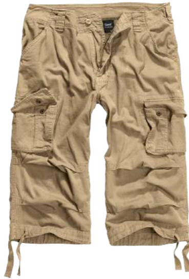
COLOR | 20003 · beige