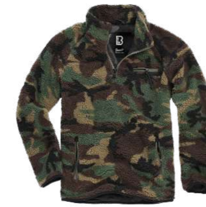
COLOR | 15010 · woodland