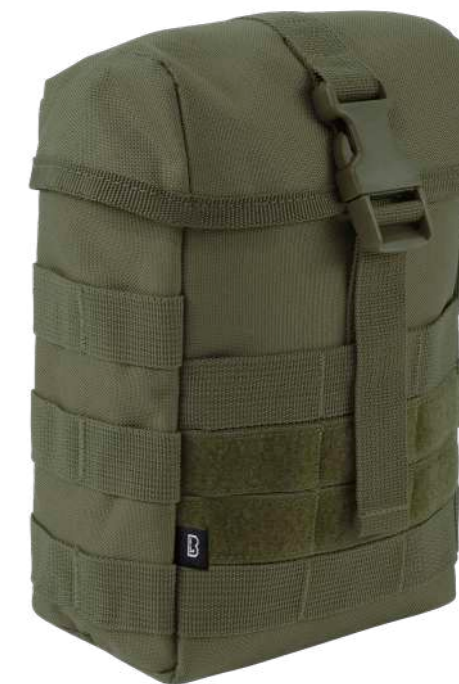
COLOR | 15001 · olive