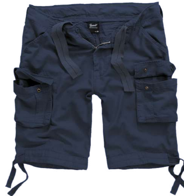
COLOR | 14008 · navy