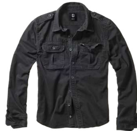
COLOR | 11002 · black