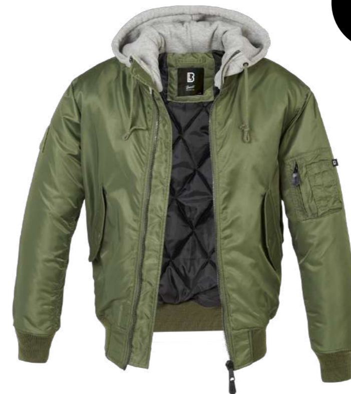
COLOR | 15136 · olive_grey