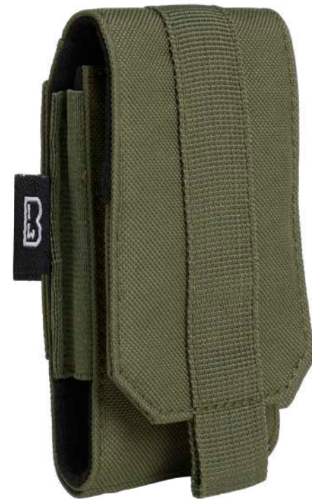
COLOR | 15001 - olive