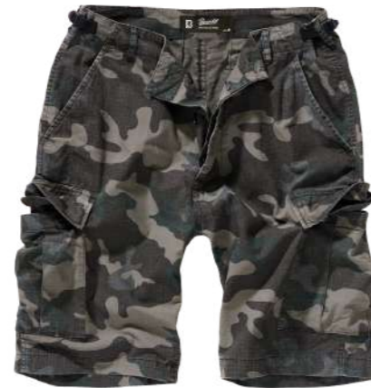
COLOR | 12004 · dark_camo