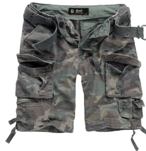
COLOR | 15010 · woodland