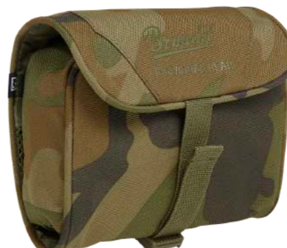
COLOR | 15010 - woodland