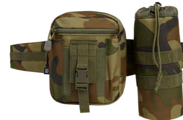
COLOR | 15010 · woodland