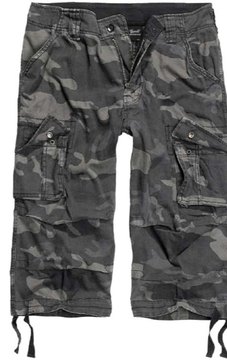
COLOR | 12004 · dark_camo