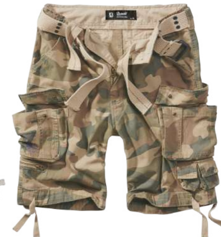
COLOR | 15107 · light_woodland