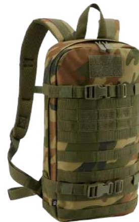
COLOR | 15010 · woodland