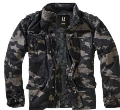
COLOR | 12004 · dark_camo