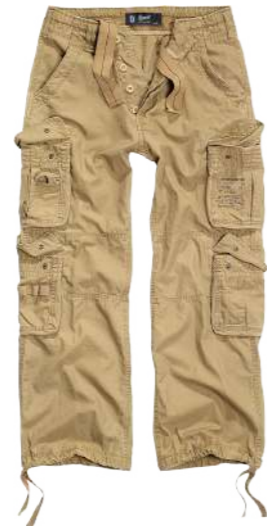
COLOR | 20003 · beige