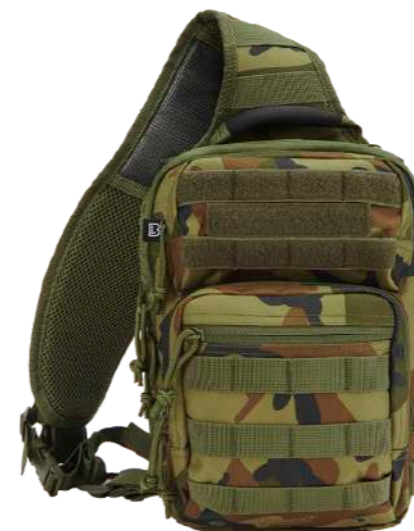
COLOR | 15010 · woodland