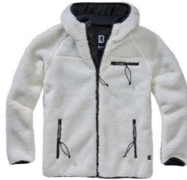
COLOR | 10007 · white