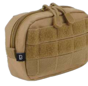
COLOR | 20070 · camel