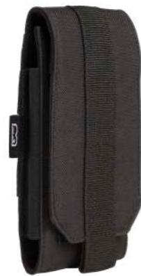
COLOR | 11002 · black