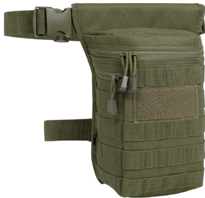
COLOR | 15001 · olive