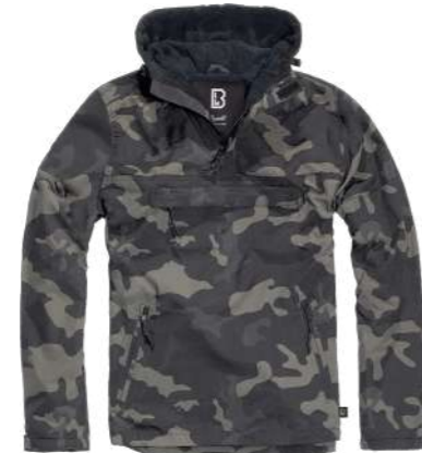
COLOR | 12004 · dark_camo