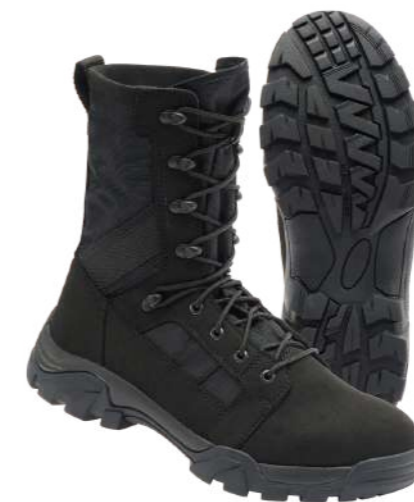
COLOR | 11002 · black