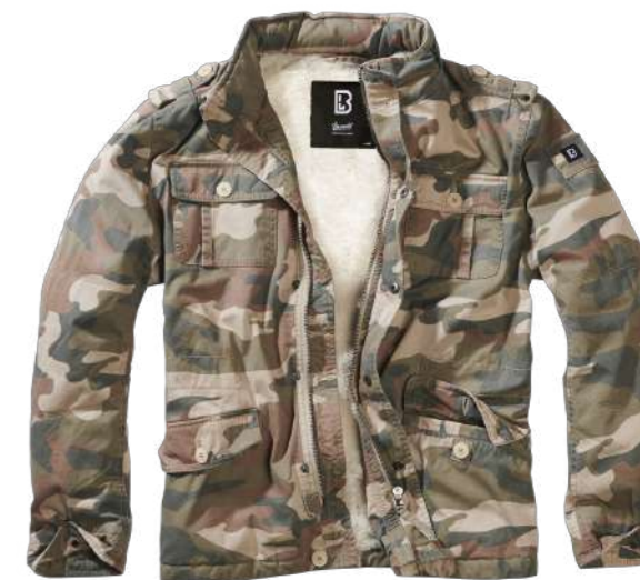
COLOR | 15107 · light_woodland