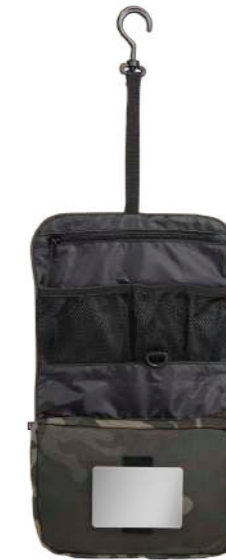
COLOR | 12004 · dark_camo