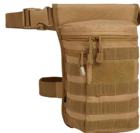
COLOR | 20070 · camel