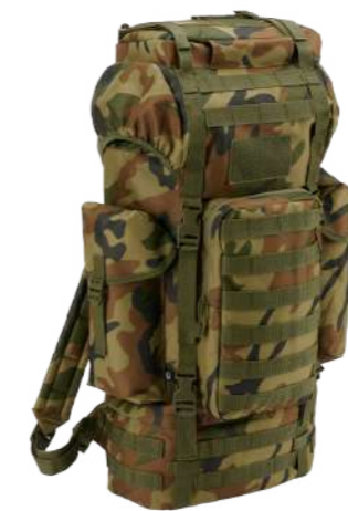
COLOR | 15010 · woodland