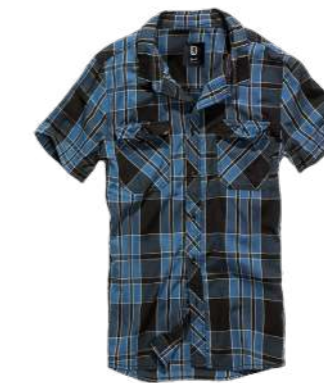
COLOR | 14087 indigo_ch