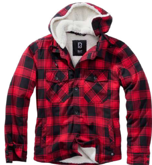
COLOR | 13041 · red_black_ch