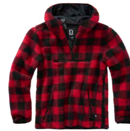
COLOR | 13041 · red_black_ch