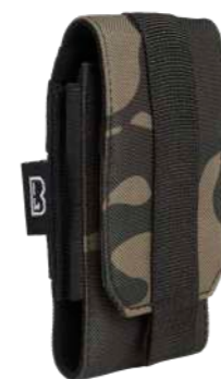
COLOR | 12004 - dark_camo