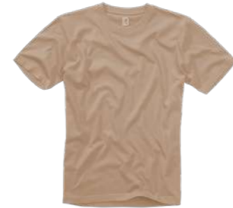
COLOR | 20003 · beige