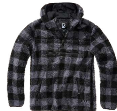
COLOR | 12028 · black_grey_ch