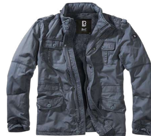
COLOR | 14088 · indigo