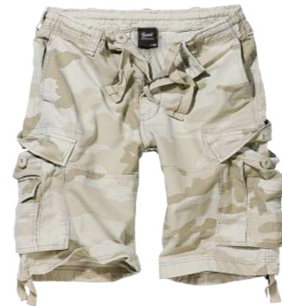
COLOR | 20011 · sandstorm