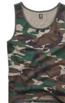
COLOR | 15010 woodland