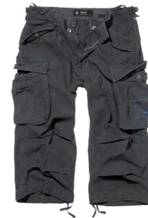
COLOR | 11002 · black