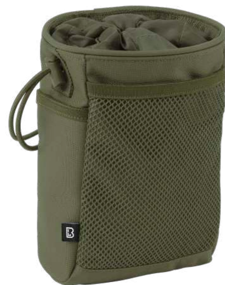
COLOR | 15001 · olive