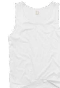
COLOR | 10007 · white