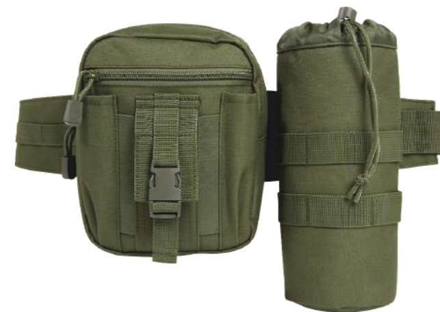
COLOR | 15001 · olive