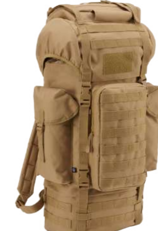
COLOR | 20070 · camel