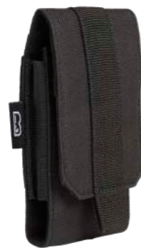
COLOR | 11002 - black