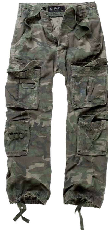
COLOR | 15010 · woodland