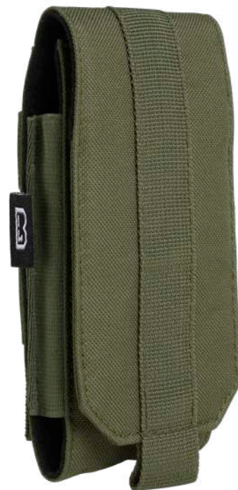
COLOR | 15001 · olive