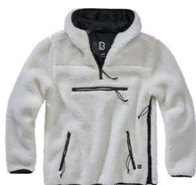
COLOR | 10007 · white