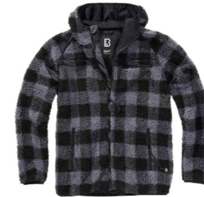
COLOR | 12028 · black_grey_ch