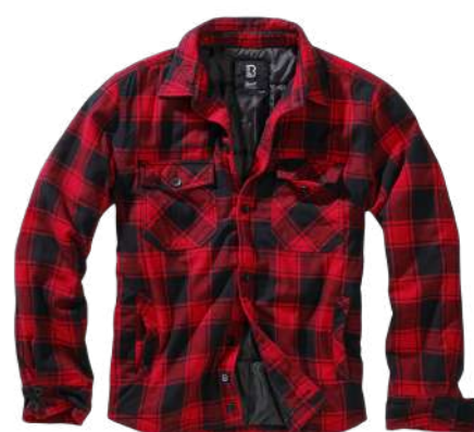
COLOR | 13041 · red_black_ch