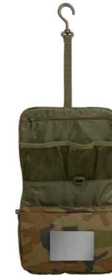
COLOR | 15010 · woodland