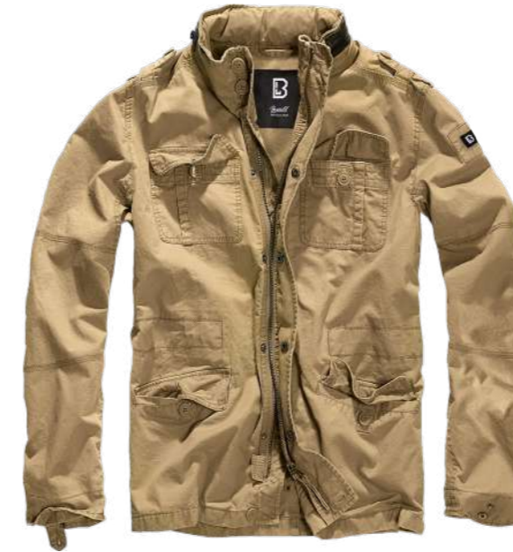
COLOR | 20070 - camel