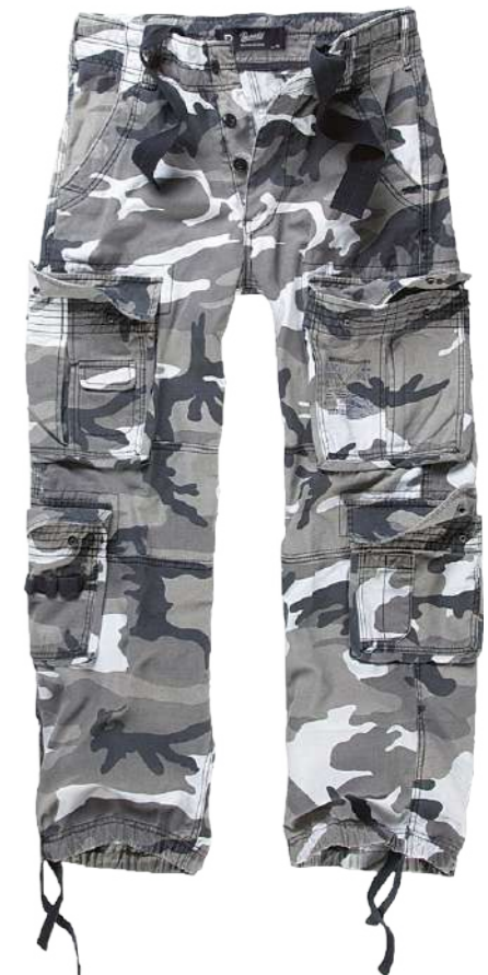
COLOR | 12015 · urban