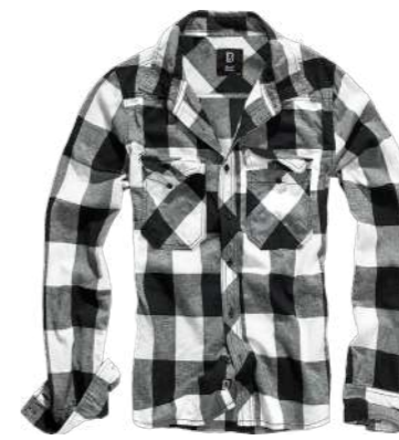
COLOR | 10046 · white_black_ch