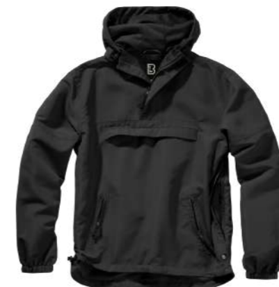
COLOR | 11002 · black