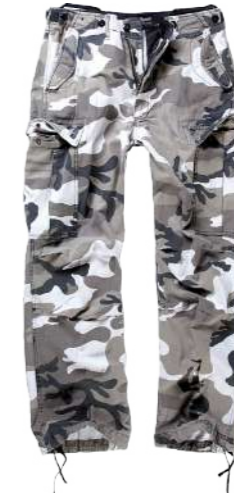
COLOR | 12015 · urban