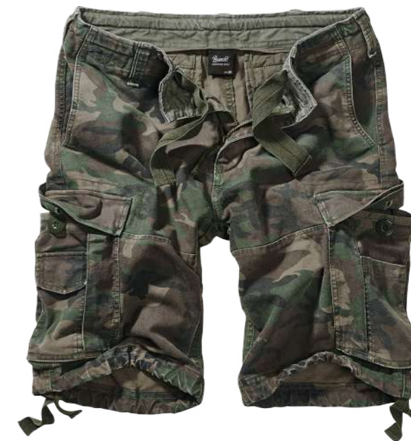
COLOR | 15010 · woodland