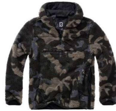
COLOR | 12004 · dark_camo