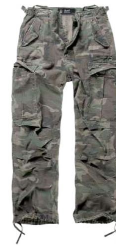
COLOR | 15010 · woodland