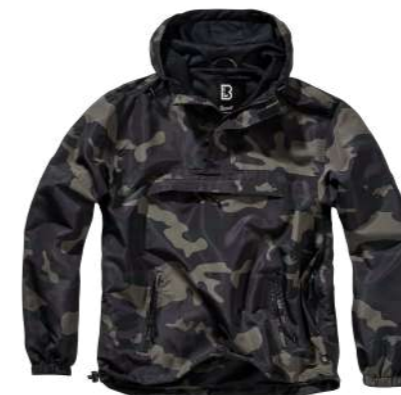
COLOR | 12004 · dark_camo