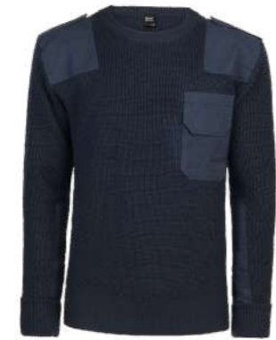
COLOR | 14008 - navy