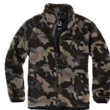
COLOR | 12004 · dark_camo