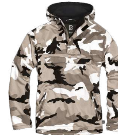
COLOR | 12015 · urban