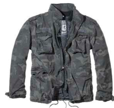
COLOR | 12004 · dark_camo