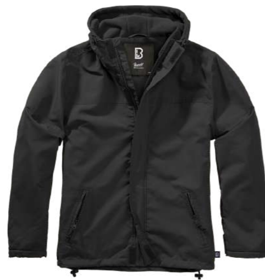
COLOR | 11002 - black