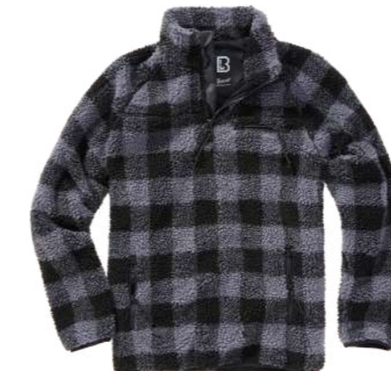
COLOR | 12028 · black_grey_ch