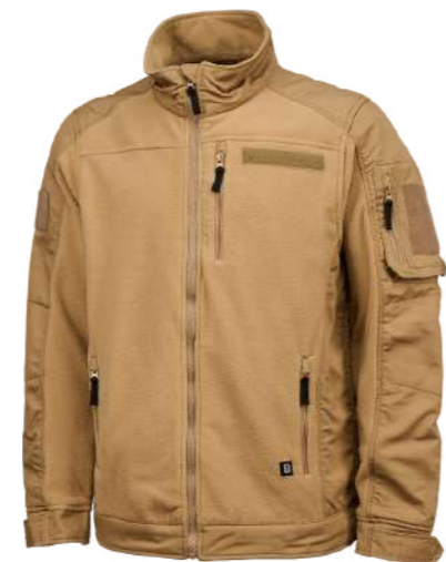
COLOR | 20070 · camel