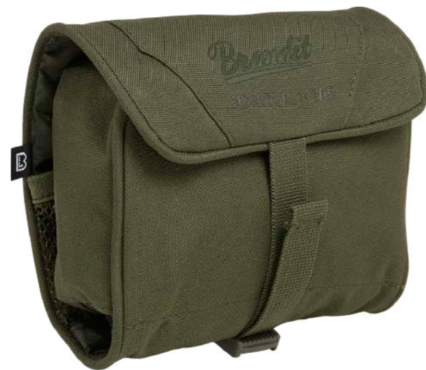
COLOR | 15001 - olive