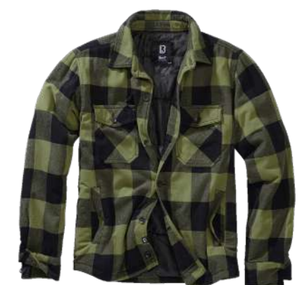
COLOR | 15184 · black_olive_ch