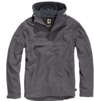
COLOR | 12005 · anthracite