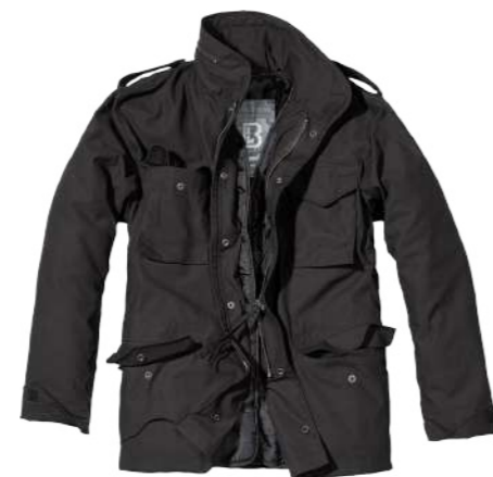
COLOR | 11002 · black