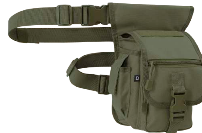
COLOR | 15001 · olive