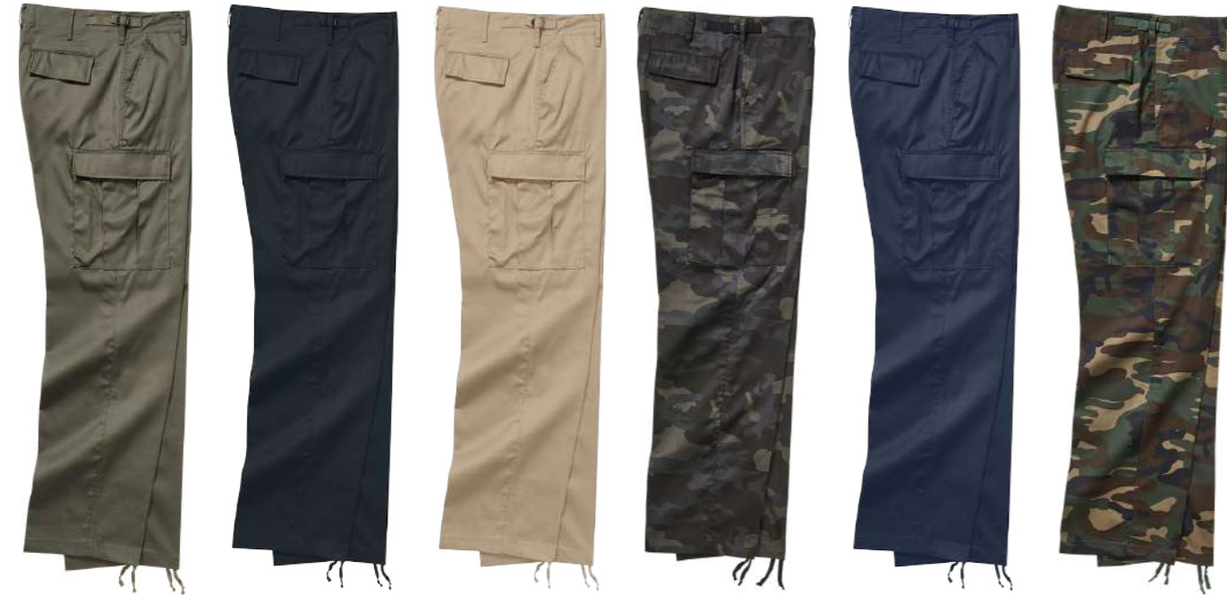
COLOR 15001 · olive