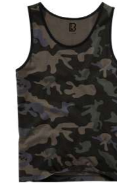
COLOR | 12004 dark_camo