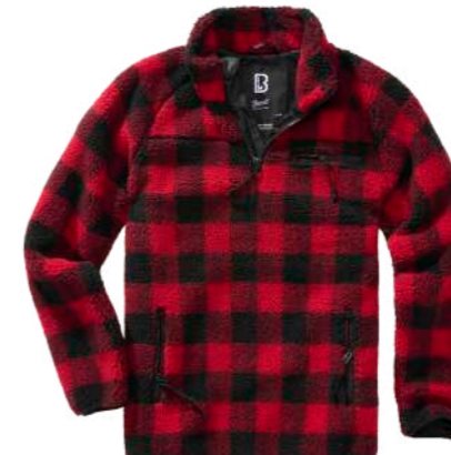
COLOR | 13041 · red_black_ch