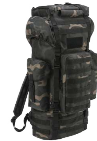
COLOR | 12004 · dark_camo