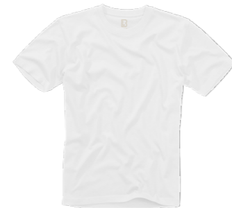
COLOR | 10007 · white