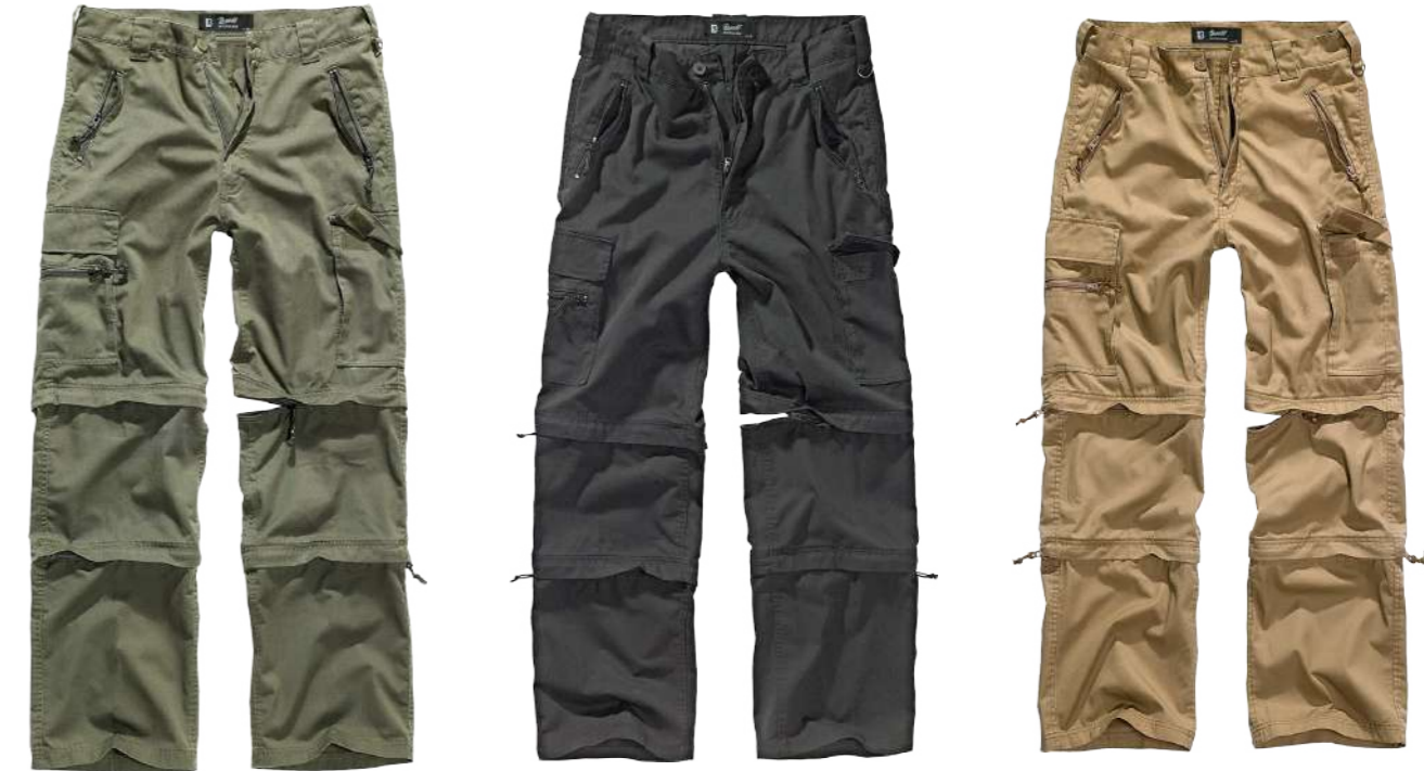
COLOR | 15001 · olive