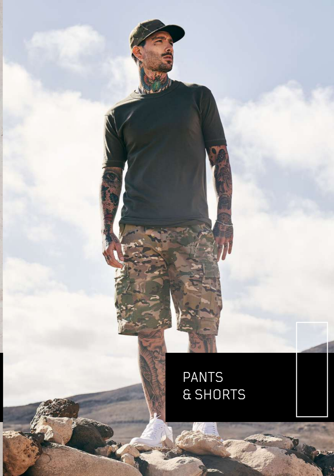
PANTS & SHORTS