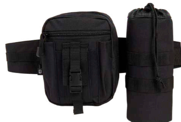
COLOR | 11002 · black