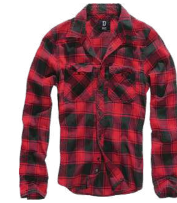
COLOR | 13041 · red_black_ch