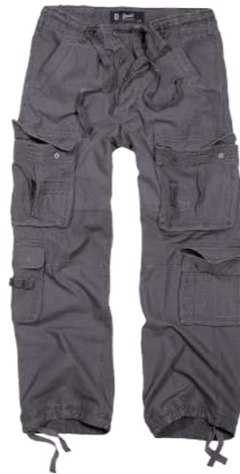
COLOR | 12005 · anthracite