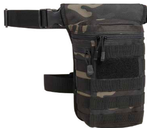
COLOR | 12004 · dark_camo