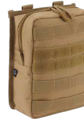
COLOR | 20070 · camel