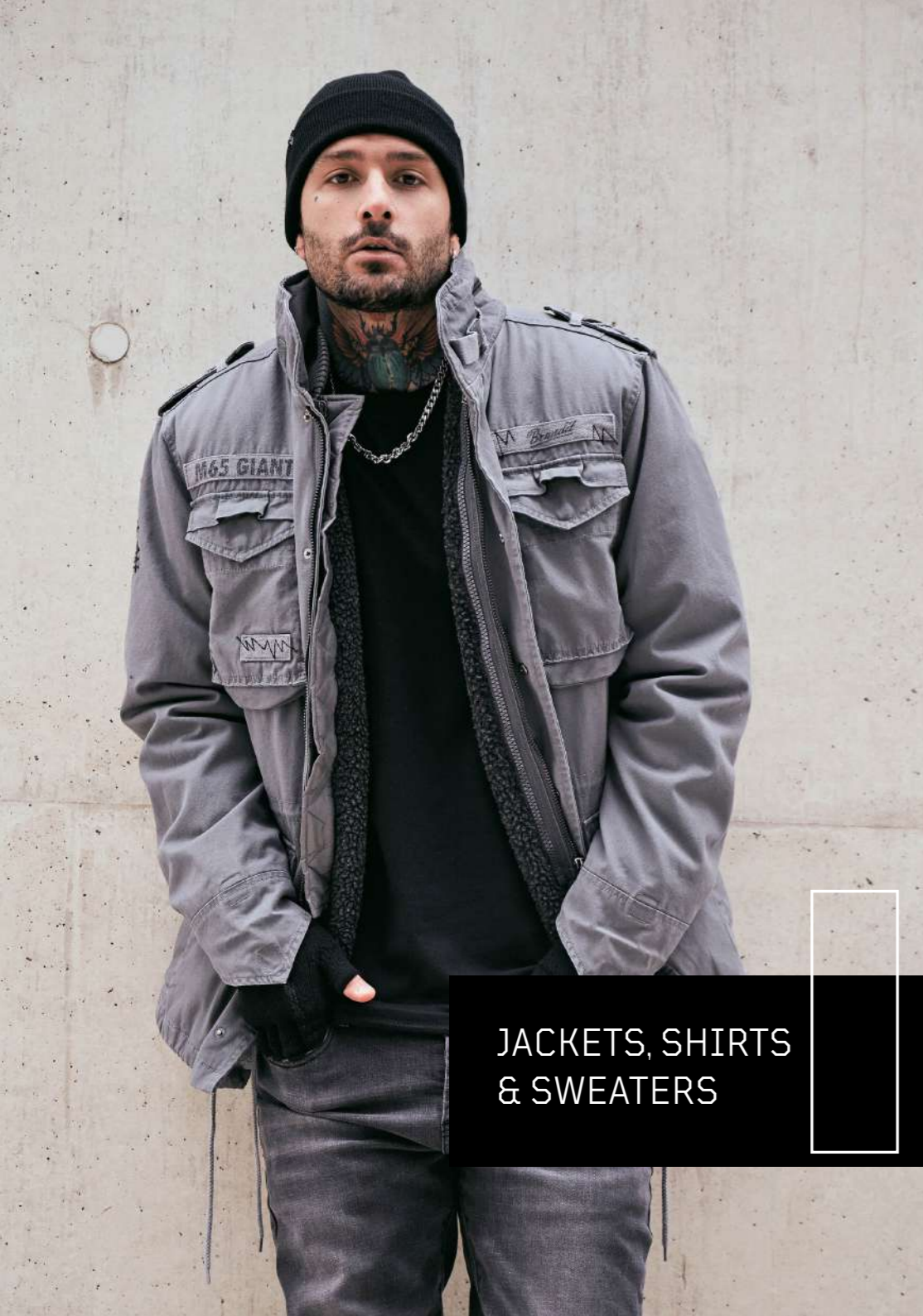
JACKETS, SHIRTS & SWEATERS