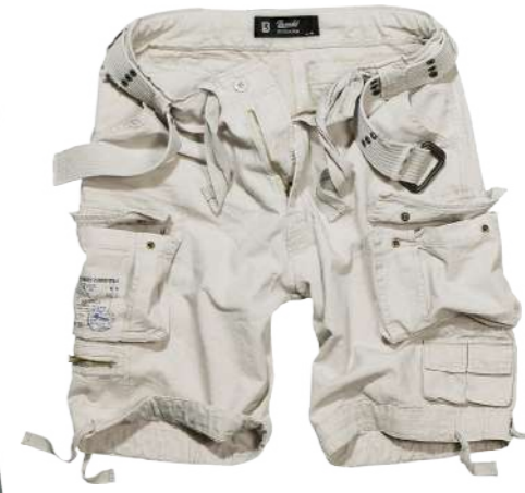
COLOR | 10012 · old_white