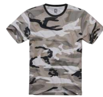
COLOR | 12015 · urban