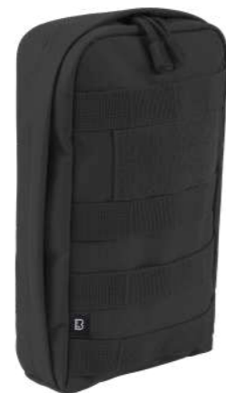
COLOR | 11002 · black