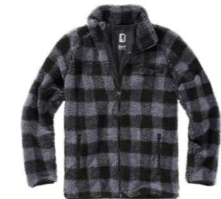
COLOR | 12028 · black_grey_ch