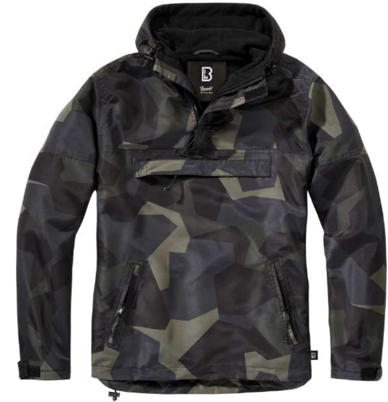
COLOR | 12199 · dark_camo_m90