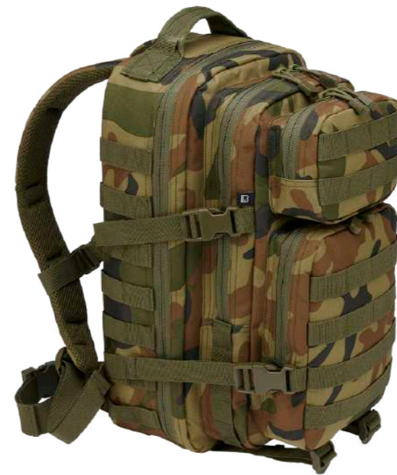
COLOR | 15010 · woodland