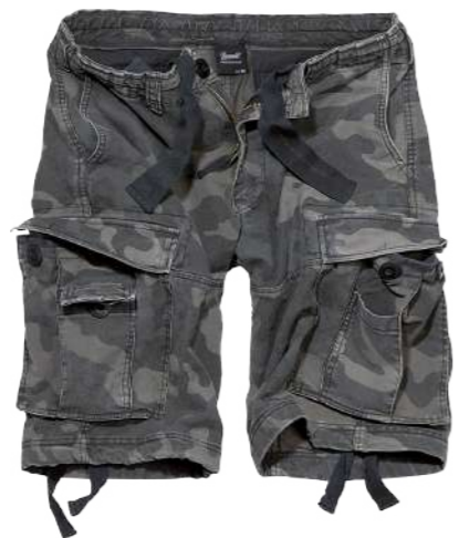
COLOR | 12004 · dark_camo