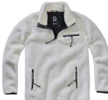
COLOR | 10007 · white