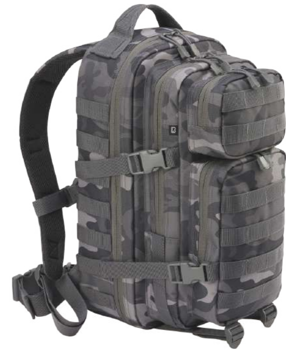
COLOR | 12222 · grey_camo