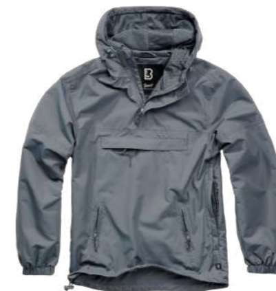
COLOR | 12005 · anthracite