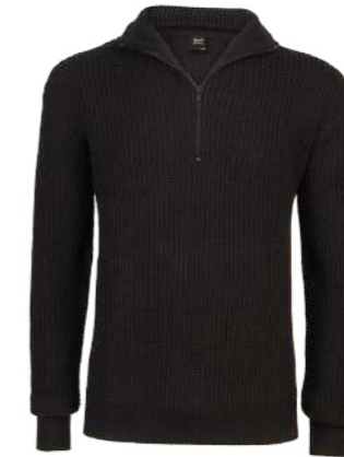
COLOR | 11002 - black