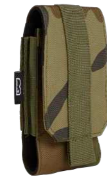
COLOR | 15010 - woodland