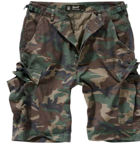
COLOR | 15010 · woodland