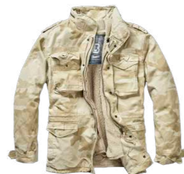
COLOR | 20011 · sandstorm