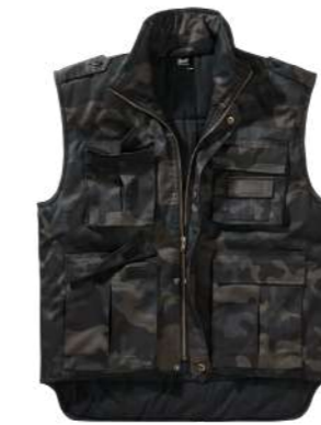
COLOR | 12004 · dark_camo