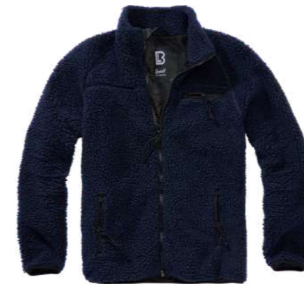
COLOR | 14008 · navy