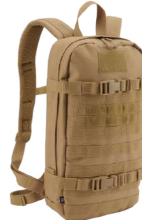
COLOR | 20070 · camel