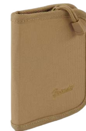
COLOR | 20070 · camel