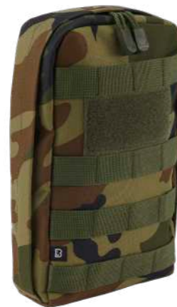
COLOR | 15010 · woodland