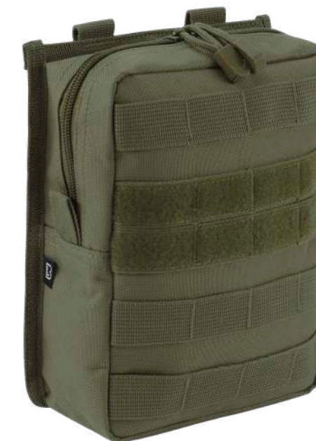
COLOR | 15001 · olive