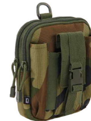
COLOR | 15010 · woodland