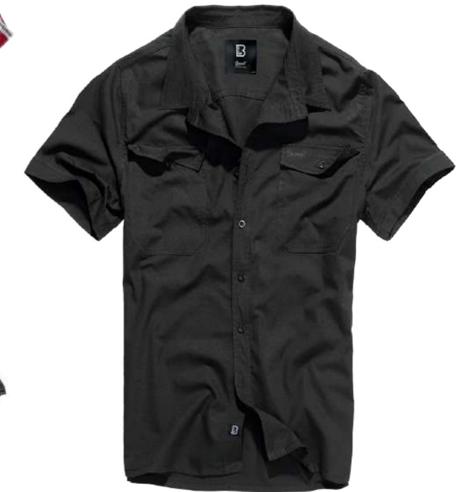
COLOR | 11002 · black