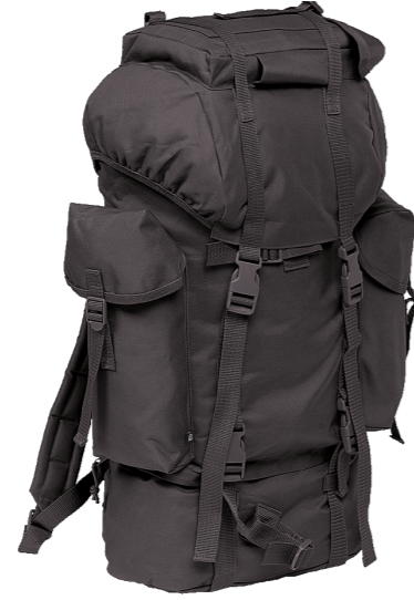
COLOR | 11002 · black