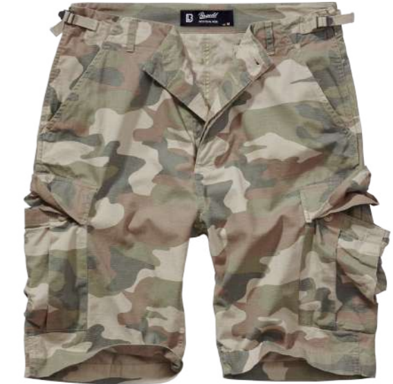
COLOR | 15107 · light_woodland