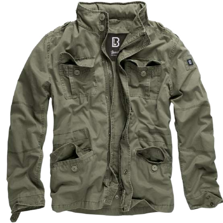
COLOR | 15001 - olive