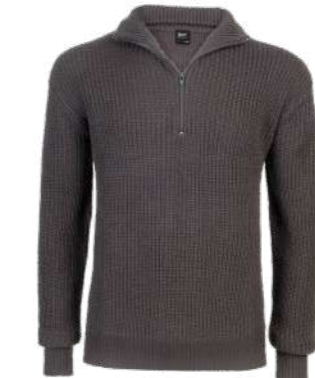
COLOR | 12005 - anthracite