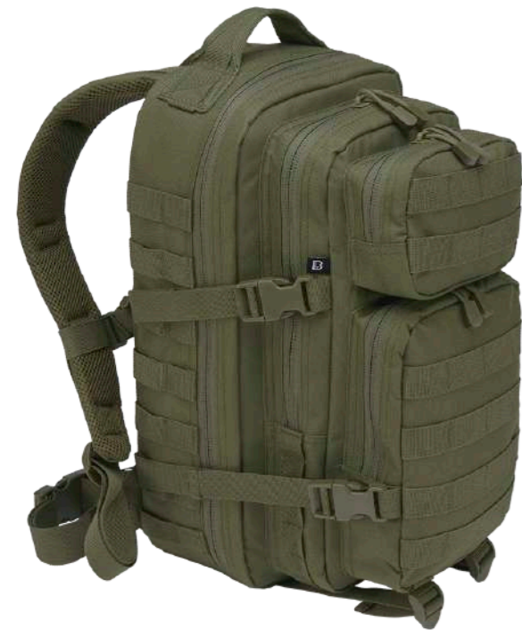
COLOR | 15001 · olive