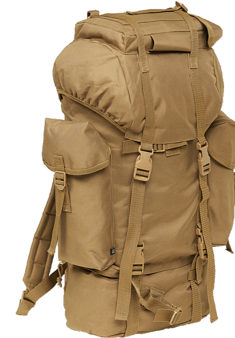
COLOR | 20070 · camel