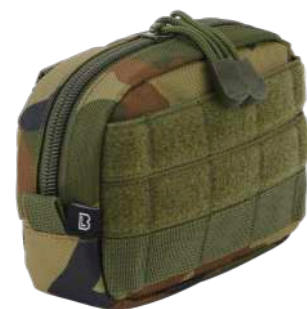
COLOR | 15010 · woodland