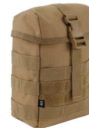
COLOR | 20070 · camel