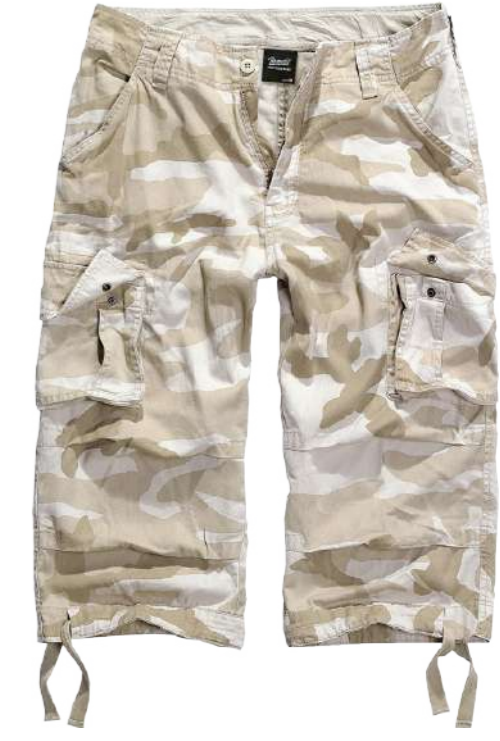
COLOR | 20011 · sandstorm