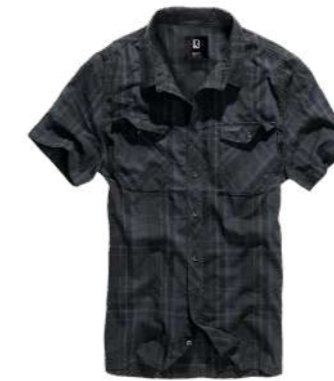
COLOR | 11029 black_blue_ch