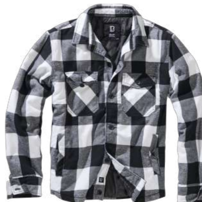
COLOR | 10046 · white_black_ch