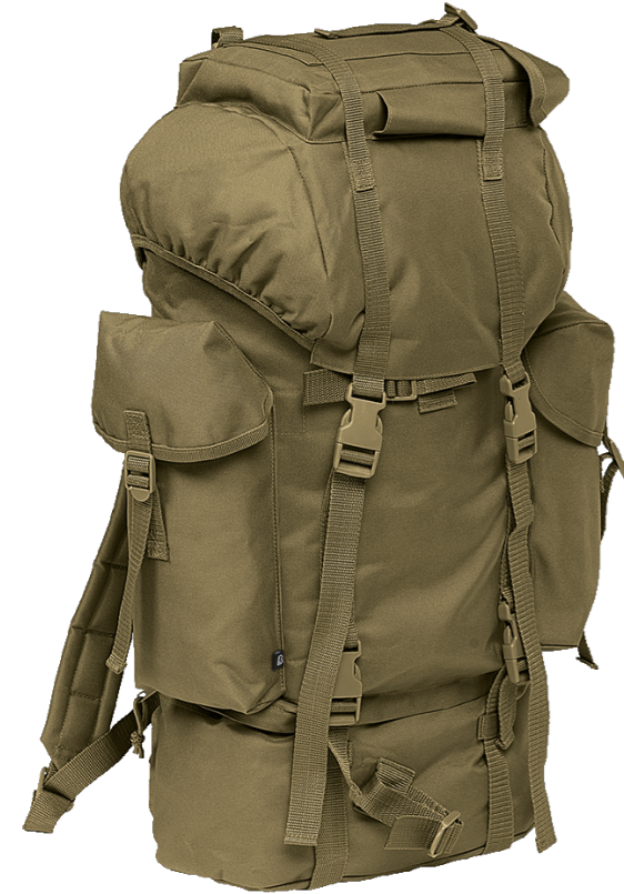
COLOR | 15001 · olive