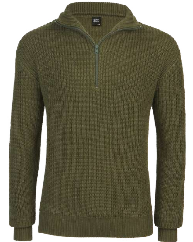
COLOR | 15001 - olive