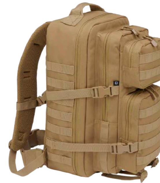
COLOR | 20070 · camel