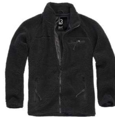
COLOR | 11002 · black