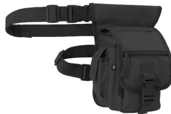
COLOR | 11002 · black