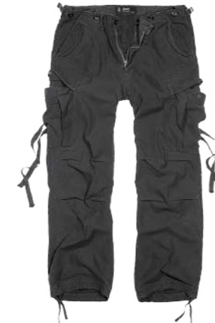
COLOR | 11002 · black