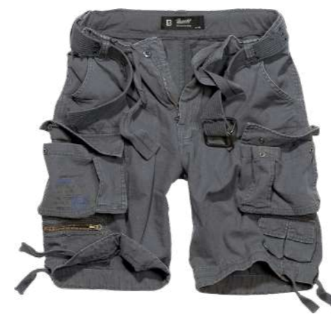
COLOR | 12005 · anthracite