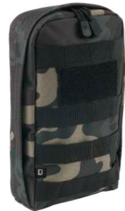
COLOR | 12004 · dark_camo