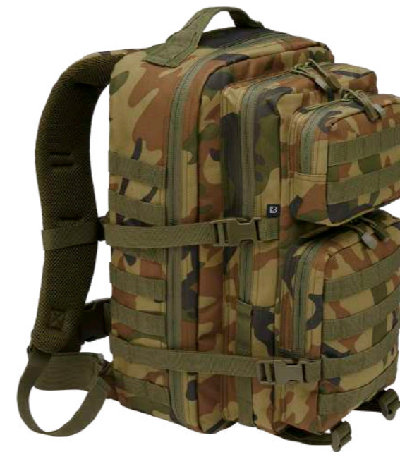
COLOR | 15010 · woodland