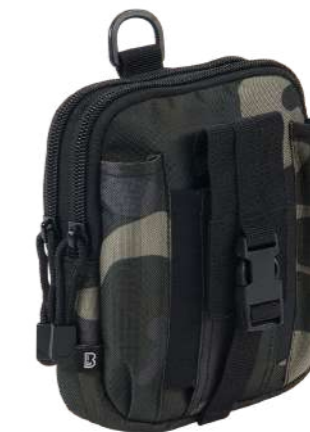
COLOR | 12004 · dark_camo