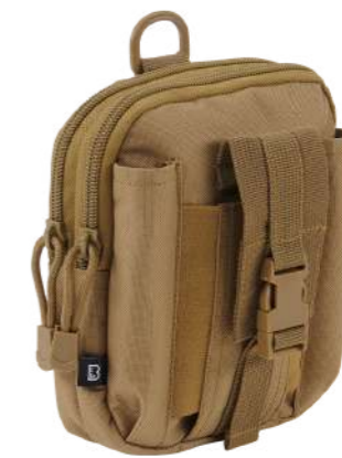
COLOR | 20070 · camel