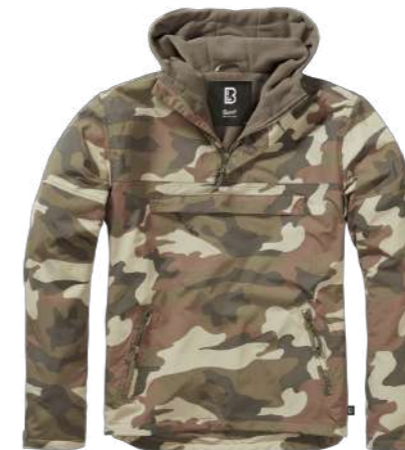
COLOR | 15107 · light_woodland