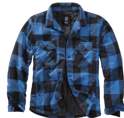
COLOR | 11029 · black_blue_ch