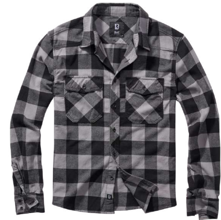
COLOR | 12221 · black_charcoal_ch