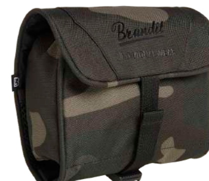
COLOR | 12004 - dark_camo