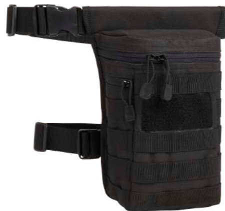
COLOR | 11002 · black