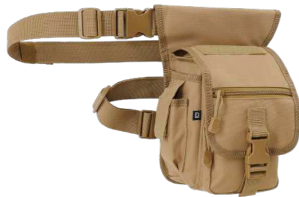
COLOR | 20070 · camel