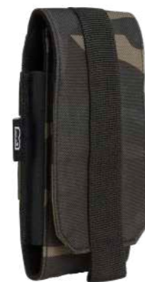
COLOR | 12004 · dark_camo