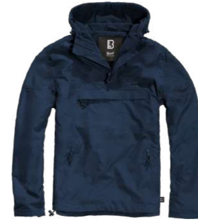
COLOR | 14008 · navy