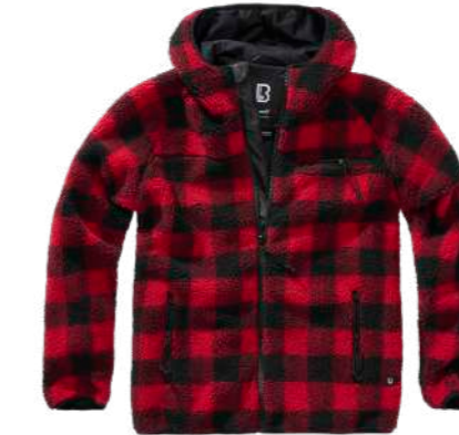
COLOR | 13041 · red_black_ch