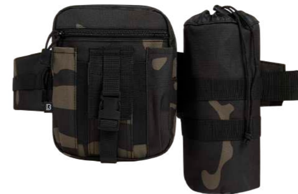
COLOR | 12004 · dark_camo