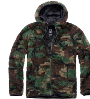
COLOR | 15010 · woodland