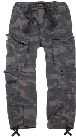
COLOR | 12004 · dark_camo