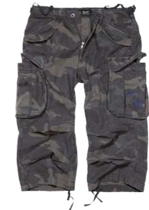
COLOR | 12004 · dark_camo