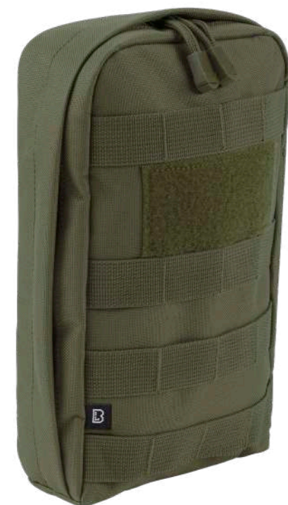
COLOR | 15001 · olive