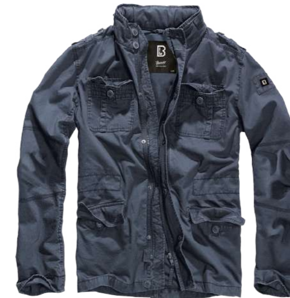
COLOR | 14088 - indigo