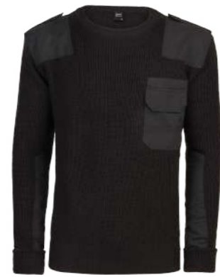
COLOR | 11002 - black