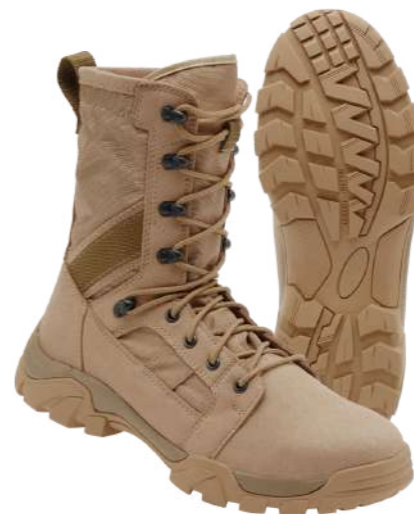
COLOR | 20070 · camel