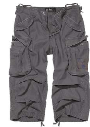
COLOR | 12005 · anthracite