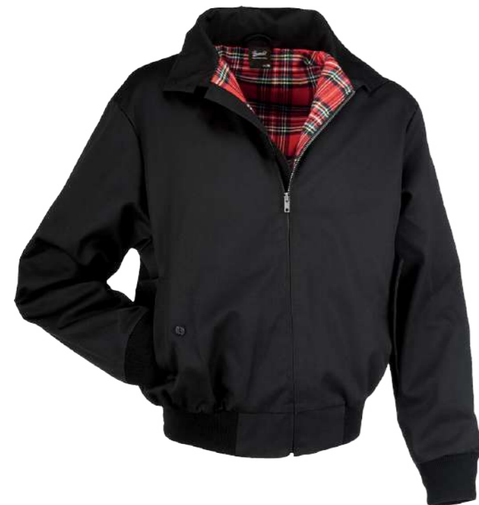
COLOR | 11002 · black