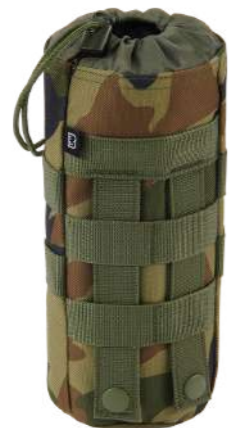
COLOR | 15010 · woodland