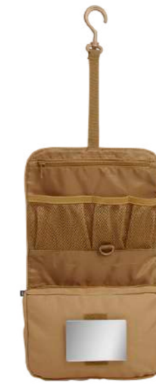
COLOR | 20070 · camel