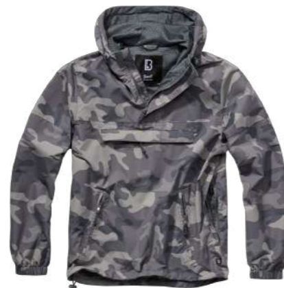
COLOR | 12222 · grey_camo