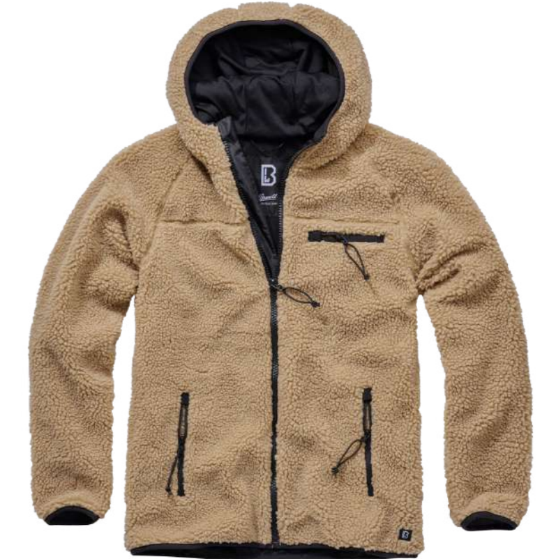
COLOR | 20070 · camel