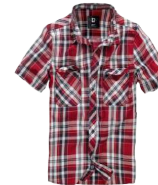
COLOR | 13038 · red