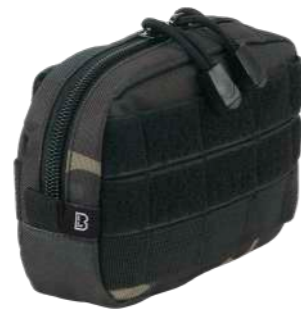
COLOR | 12004 · dark_camo