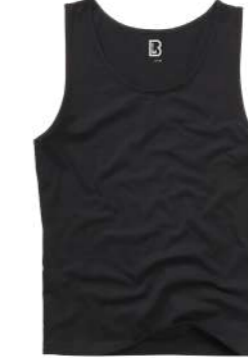
COLOR | 11002 · black