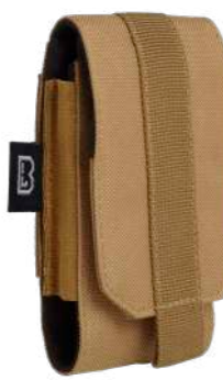
COLOR | 20070 - camel