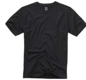
COLOR | 11002 · black