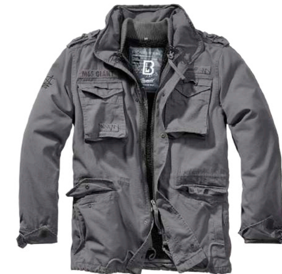
COLOR | 12213 · charcoal_grey