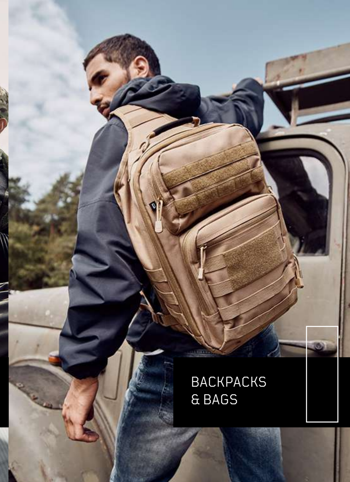
BACKPACKS & BAGS