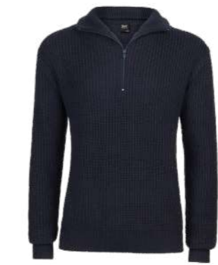
COLOR | 14008 - navy