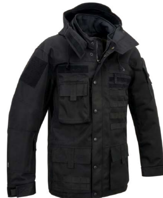
COLOR | 11002 · black