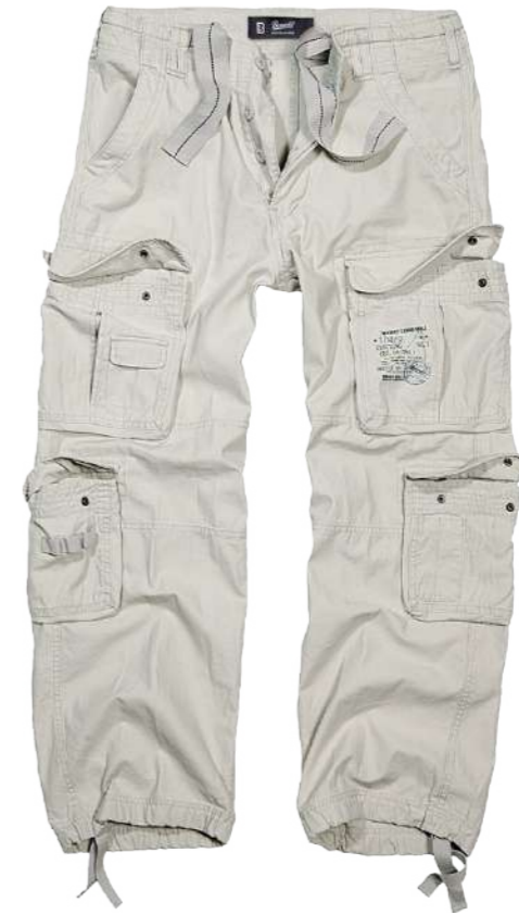
COLOR | 10012 · old_white