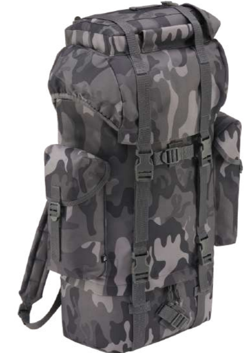
COLOR | 12222 · grey_camo