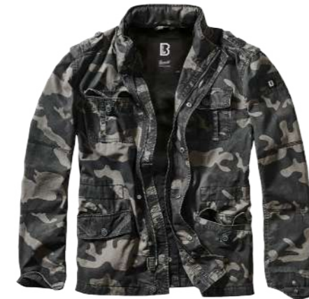
COLOR | 12004 - dark_camo