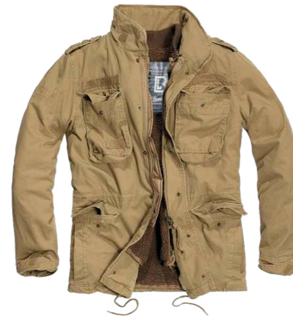
COLOR | 20070 · camel