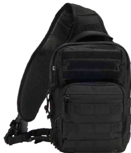
COLOR | 11002 · black