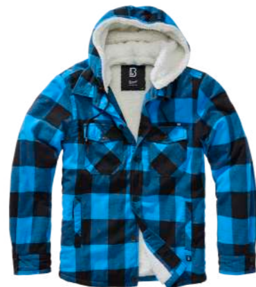
COLOR | 11029 · black_blue_ch