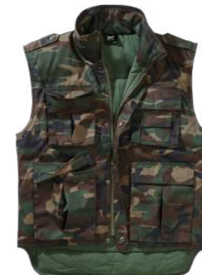
COLOR | 15010 · woodland