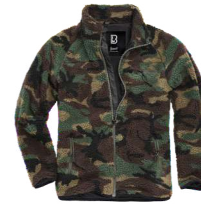
COLOR | 15010 · woodland