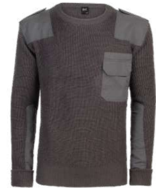
COLOR | 12005 - anthracite