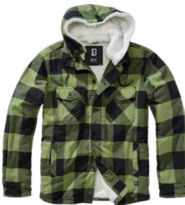
COLOR | 15184 · black_olive_ch