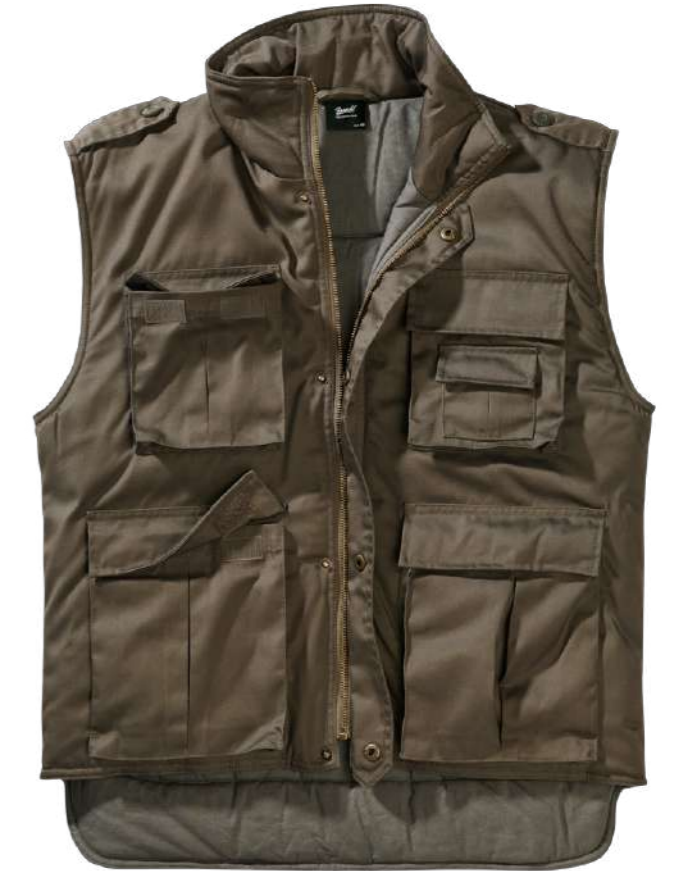
COLOR | 15001 · olive