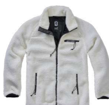
COLOR | 10007 · white