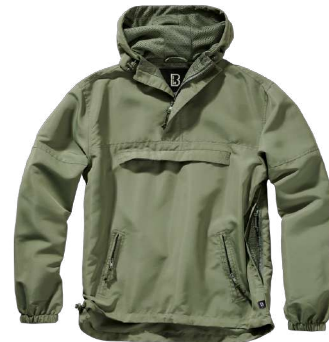
COLOR | 15001 · olive