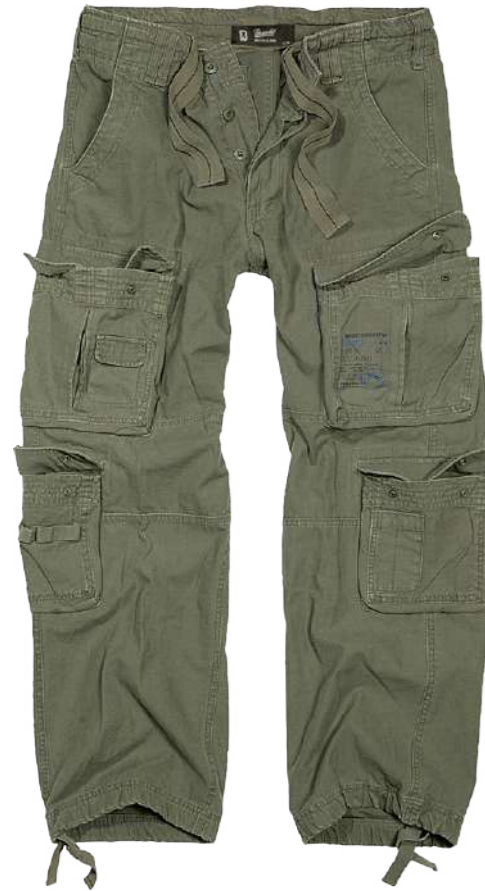
COLOR | 15001 · olive