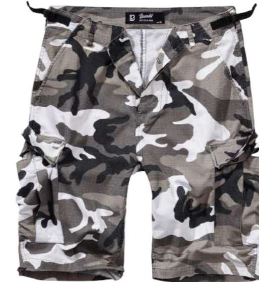
COLOR | 12015 · urban