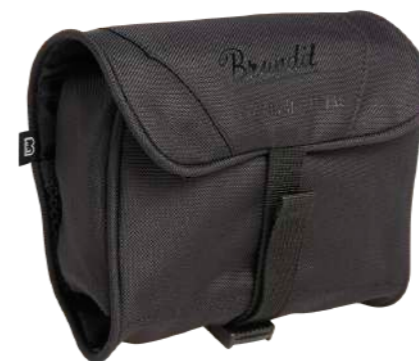
COLOR | 11002 - black