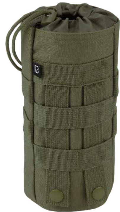
COLOR | 15001 · olive