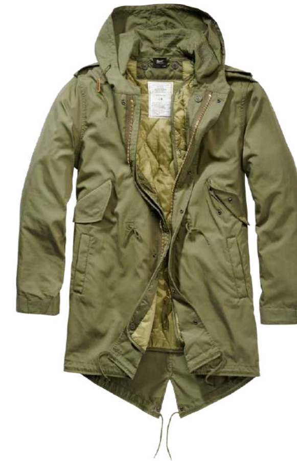
COLOR | 15001 · olive