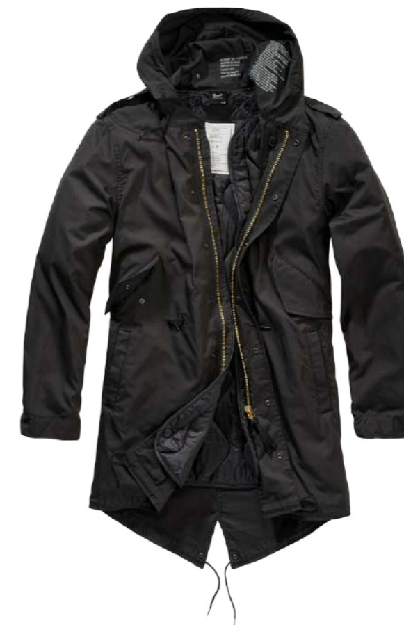
COLOR | 11002 · black