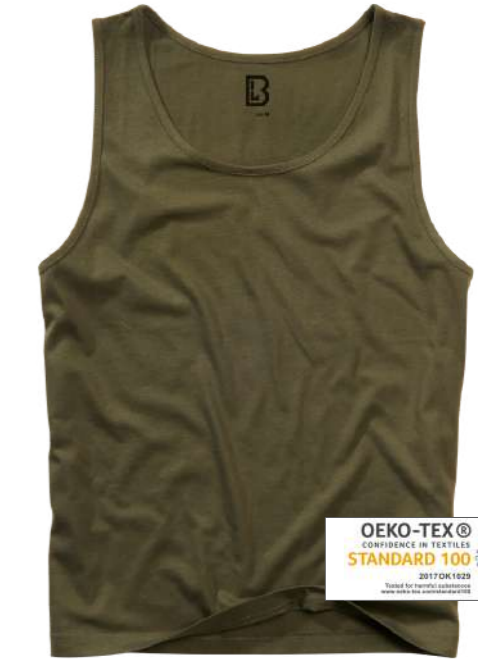
COLOR | 15001 · olive