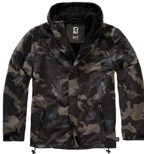
COLOR | 12004 - dark_camo