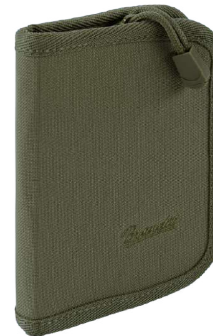
COLOR | 15001 · olive