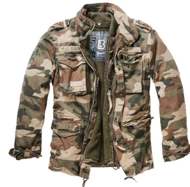
COLOR | 15107 · light_woodland