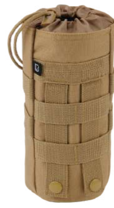
COLOR | 20070 · camel