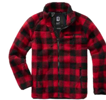
COLOR | 13041 · red_black_ch