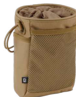
COLOR | 20070 · camel