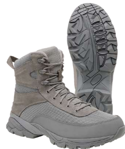
COLOR | 12005 · anthracite