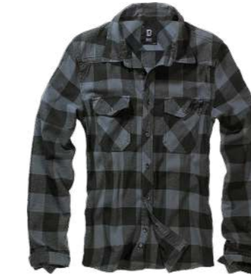
COLOR | 12028 · black_grey_ch