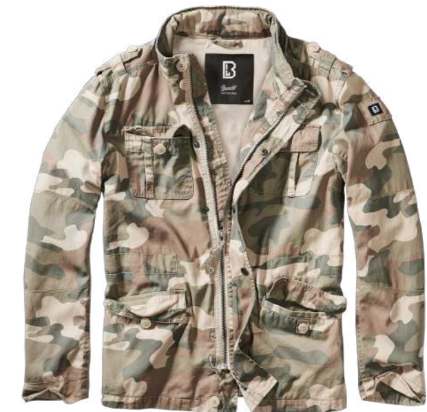
COLOR | 15107 - light_woodland